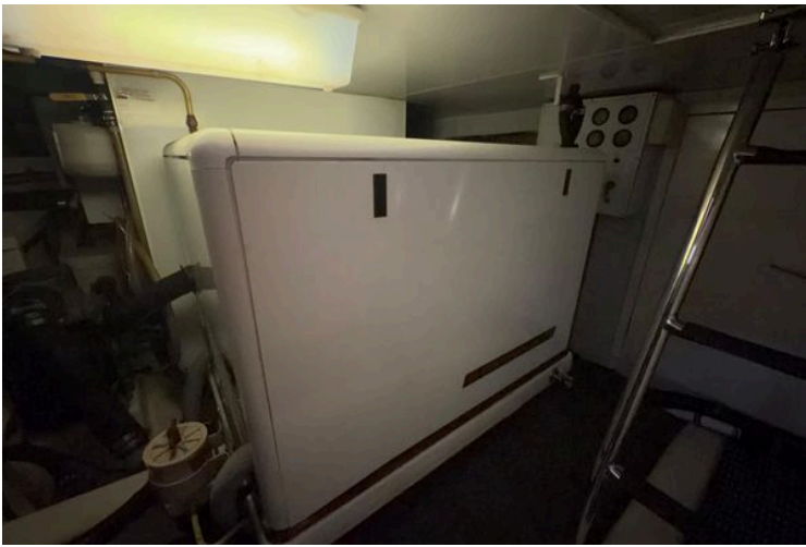
Engine room of 2006 Ocean Alexander 48 Classicco yacht, featuring machinery and control panels.