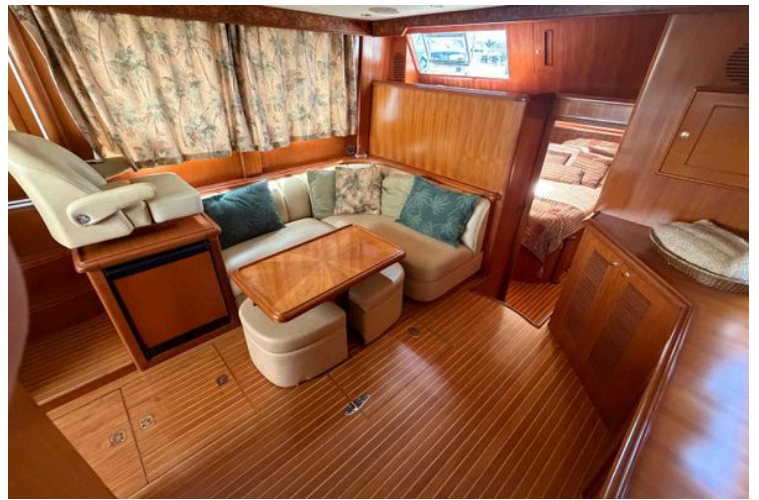
Luxurious interior of 2006 Ocean Alexander 48 Classicco yacht with elegant wood finishes.