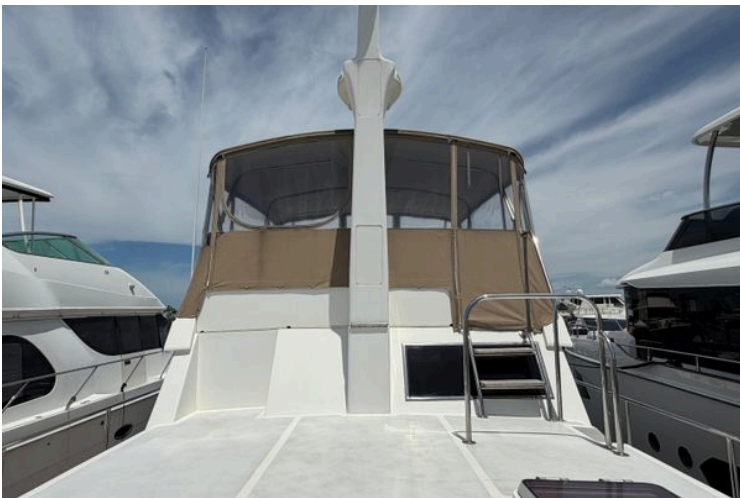
2006 Ocean Alexander 48 Classicco yacht docked under a partly cloudy sky.