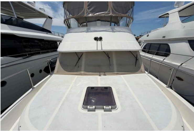
2006 Ocean Alexander 48 Classicco yacht docked between two other boats.