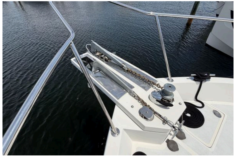
Bow of 2006 Ocean Alexander 48 Classicco yacht with anchor and chain mechanism.