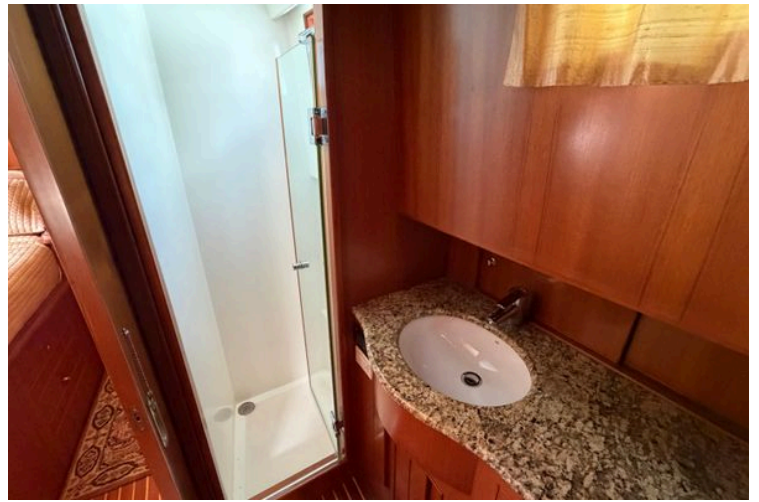
Luxurious bathroom in 2006 Ocean Alexander 48 Classicco yacht with granite countertop and shower.