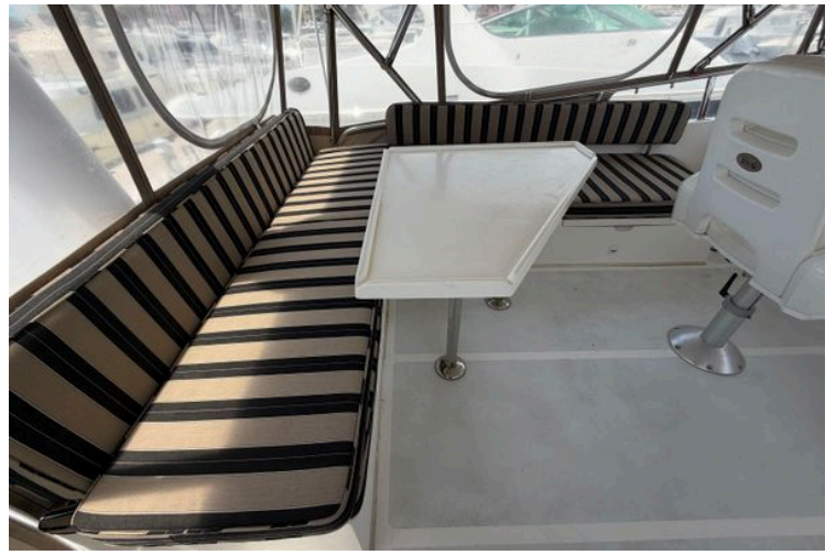
Interior seating area of 2006 Ocean Alexander 48 Classicco yacht with striped cushions and table.