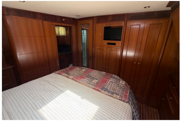
Luxurious 2006 Ocean Alexander 48 Classicco yacht bedroom with wood paneling and cozy bedding.