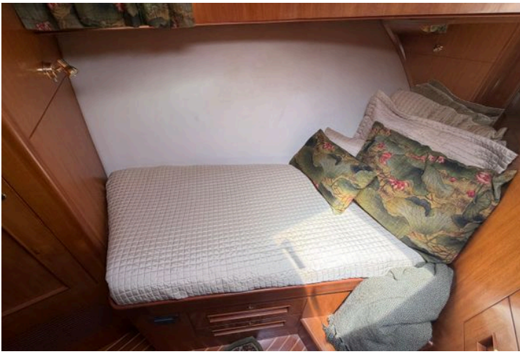
Cozy cabin bed in 2006 Ocean Alexander 48 Classicco yacht with floral pillows.