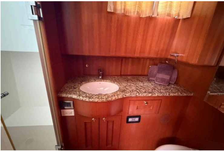
Luxurious bathroom in 2006 Ocean Alexander 48 Classicco yacht with granite countertop.