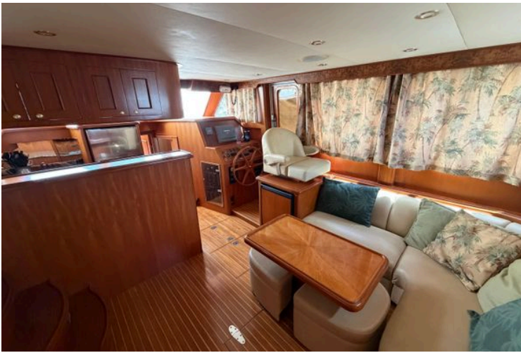
Luxurious interior of 2006 Ocean Alexander 48 Classicco yacht with elegant wood finishes.