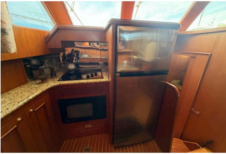
Galley kitchen in 2006 Ocean Alexander 48 Classicco yacht with granite countertops.