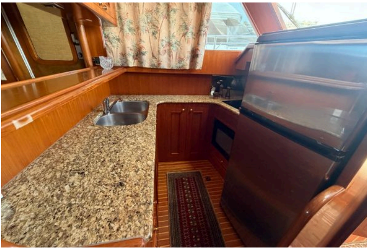
Luxurious 2006 Ocean Alexander 48 Classicco yacht kitchen with granite countertops and stainless steel appliances.