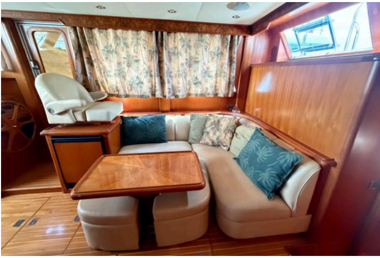
Luxurious interior of 2006 Ocean Alexander 48 Classicco yacht with plush seating and elegant wood finishes.