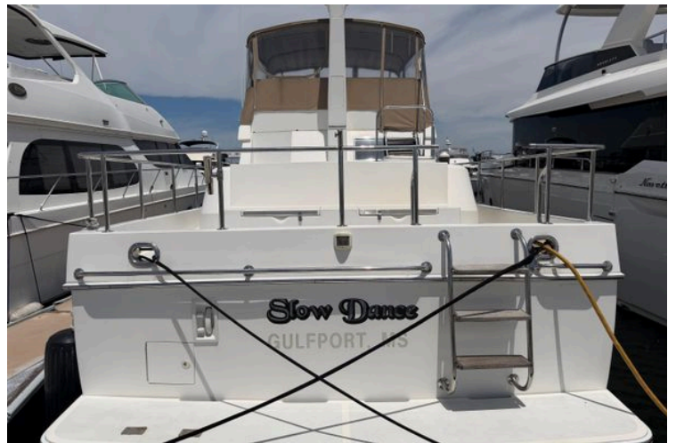
2006 Ocean Alexander 48 Classicco yacht docked, rear view with "Slow Dance" name.