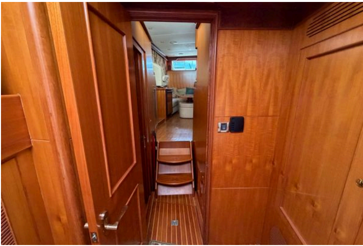
Interior view of 2006 Ocean Alexander 48 Classicco yacht with wooden paneling and steps.