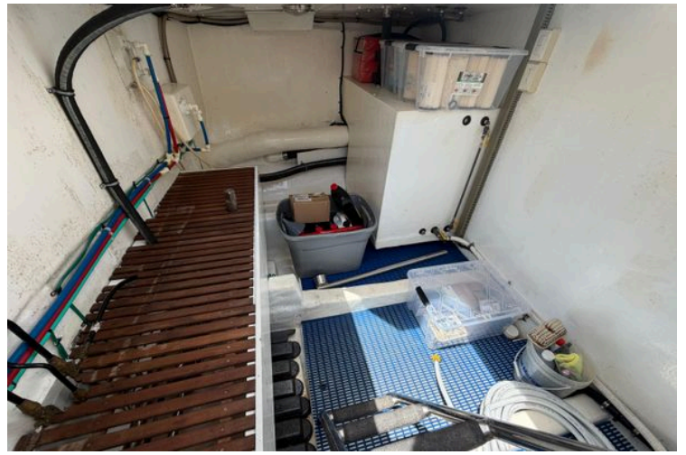
Engine room of 2006 Ocean Alexander 48 Classicco yacht, featuring organized storage and equipment.