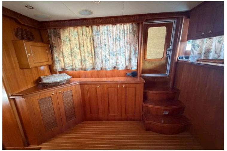
Interior of 2006 Ocean Alexander 48 Classicco yacht with wooden cabinetry and floral curtains.