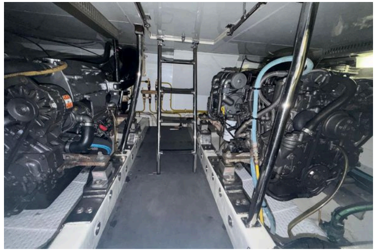
Engine room of 2006 Ocean Alexander 48 Classicco yacht, showcasing dual engines and ladder access.