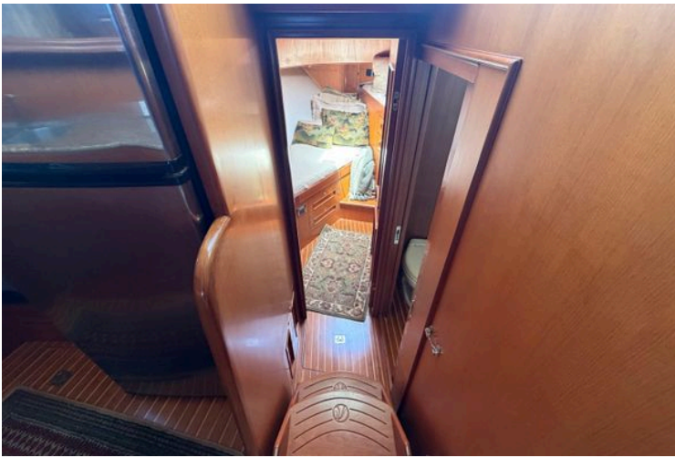
Interior view of 2006 Ocean Alexander 48 Classicco yacht cabin with wooden finish.