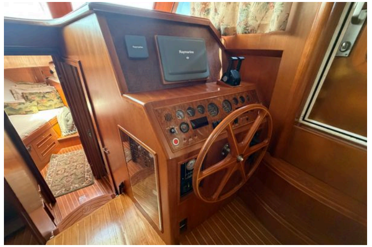
Helm of 2006 Ocean Alexander 48 Classicco yacht with wooden steering wheel and navigation equipment.