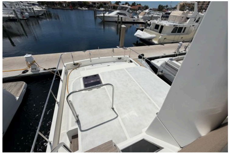
2006 Ocean Alexander 48 Classicco yacht docked at marina, showcasing spacious deck.