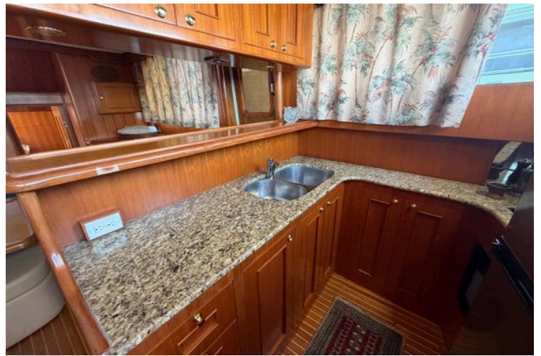
Luxurious 2006 Ocean Alexander 48 Classicco yacht kitchen with granite countertops and wooden cabinetry.