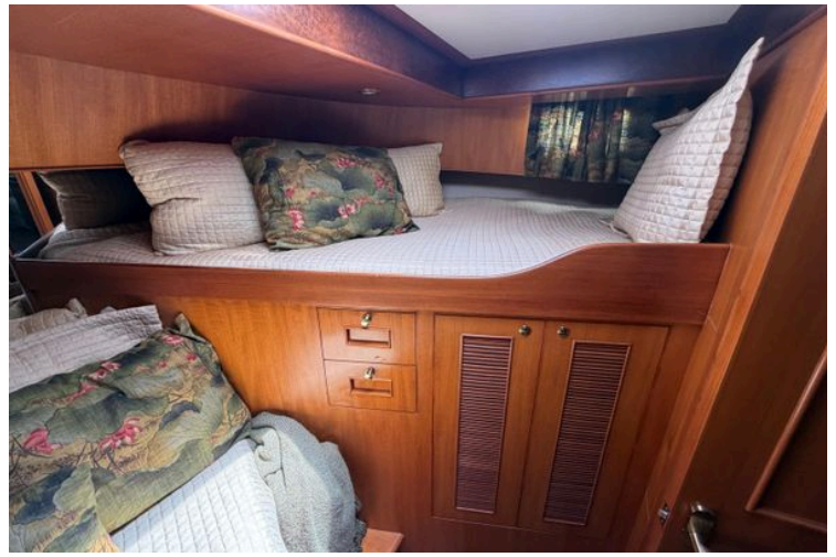
Luxurious 2006 Ocean Alexander 48 Classicco yacht cabin with cozy bedding and wooden cabinetry.