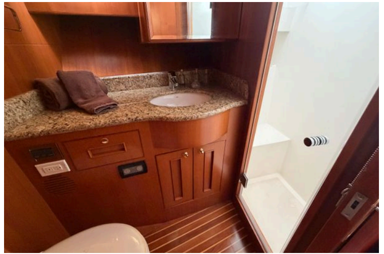
Luxurious bathroom in 2006 Ocean Alexander 48 Classicco yacht with granite countertop.