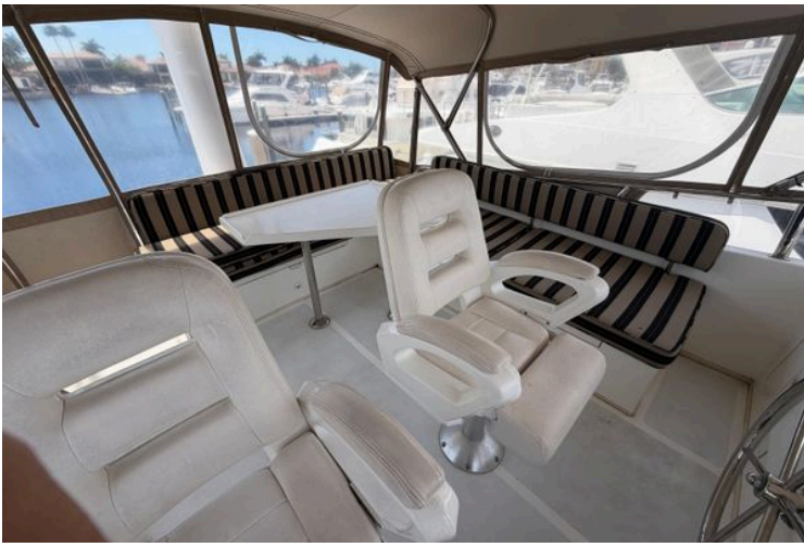
Luxurious interior of 2006 Ocean Alexander 48 Classicco yacht with seating and table.