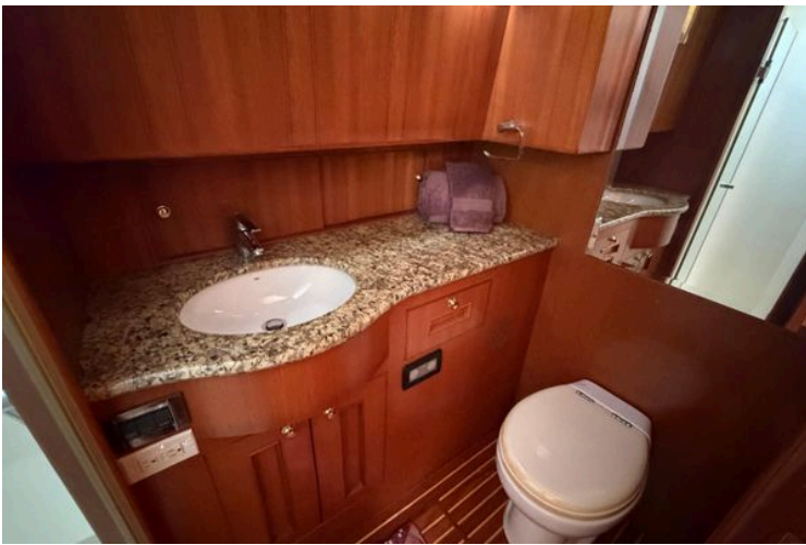
Luxurious bathroom in 2006 Ocean Alexander 48 Classicco yacht with granite countertop.