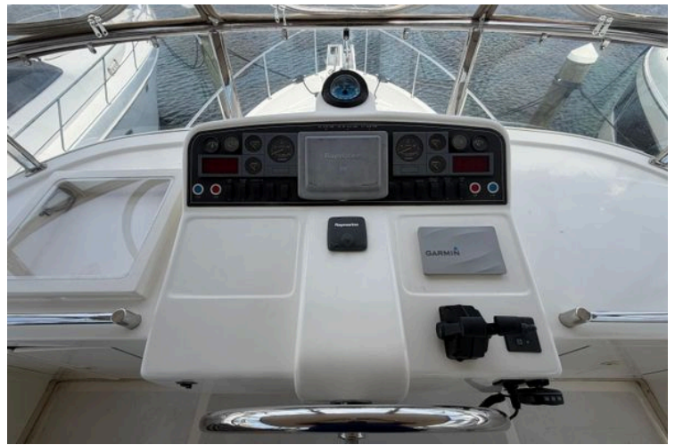
Helm of 2006 Ocean Alexander 48 Classicco yacht with navigation instruments and controls.