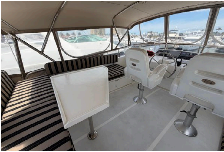
Interior view of 2006 Ocean Alexander 48 Classicco yacht with striped seating and helm.