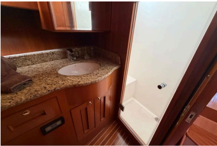
Luxurious bathroom in 2006 Ocean Alexander 48 Classicco yacht with granite countertop.