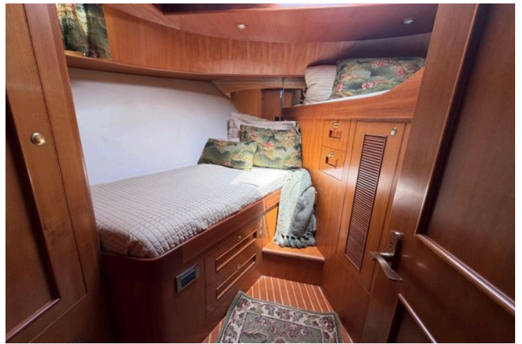
Luxurious wooden cabin interior of 2006 Ocean Alexander 48 Classicco yacht.