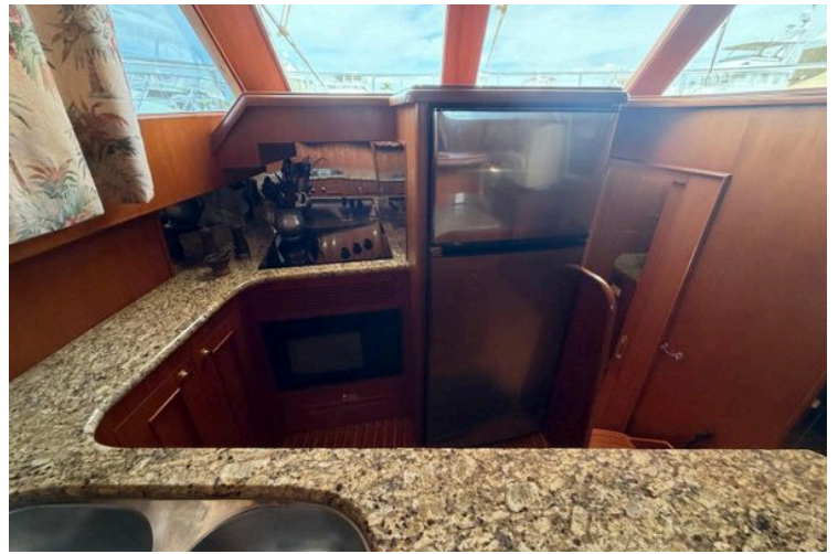
Luxurious kitchen interior of 2006 Ocean Alexander 48 Classicco yacht with granite countertops.