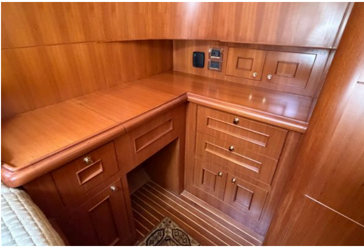
Luxurious wooden cabinetry in 2006 Ocean Alexander 48 Classicco yacht interior.