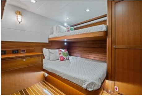
2024 Marlow 90 V - Artemis II