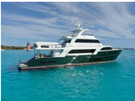
2024 Marlow 90 V - Artemis II