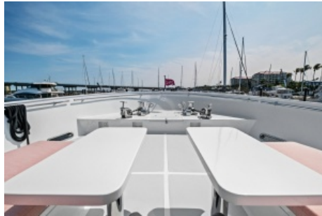
2024 Marlow 90 V - Artemis II