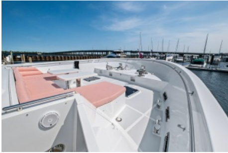
2024 Marlow 90 V - Artemis II 2024 Marlow 90 V - Artemis II