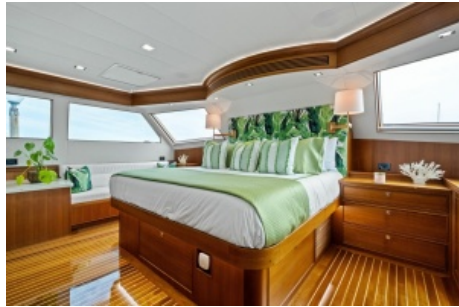
2024 Marlow 90 V - Artemis II