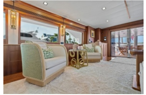
2024 Marlow 90 V - Artemis II