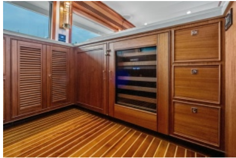
2024 Marlow 90 V - Artemis II