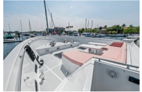
2024 Marlow 90 V - Artemis II