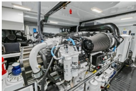
2024 Marlow 90 V - Artemis II