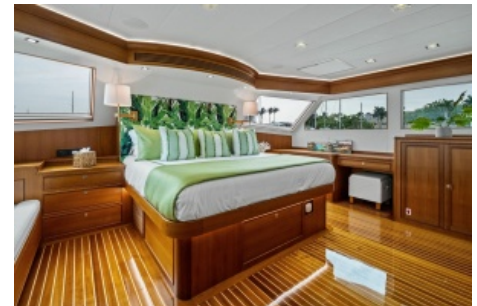
2024 Marlow 90 V - Artemis II