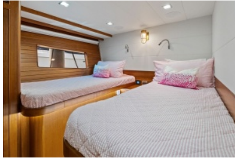
2024 Marlow 90 V - Artemis II