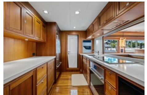
2024 Marlow 90 V - Artemis II