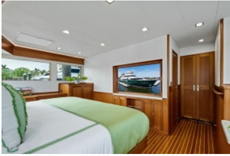
2024 Marlow 90 V - Artemis II