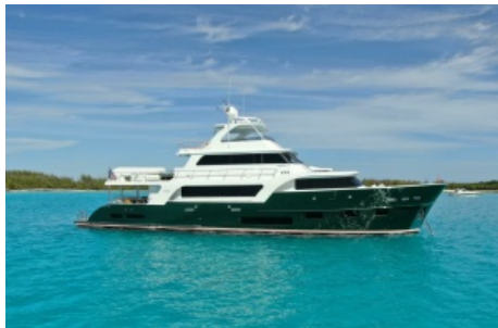
2024 Marlow 90 V - Artemis II Profile