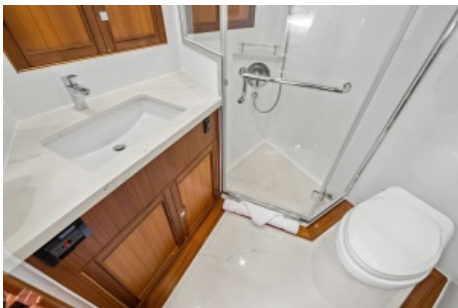
2024 Marlow 90 V - Artemis II