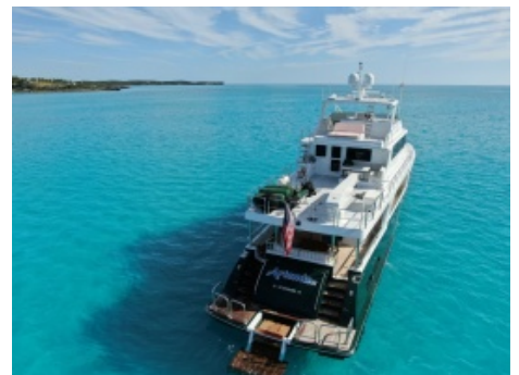
2024 Marlow 90 V - Artemis II