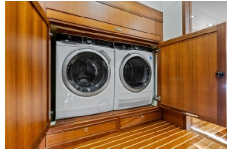
2024 Marlow 90 V - Artemis II