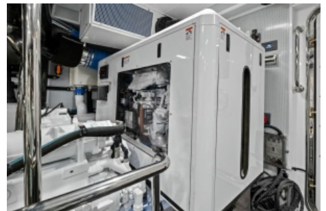
2024 Marlow 90 V - Artemis II