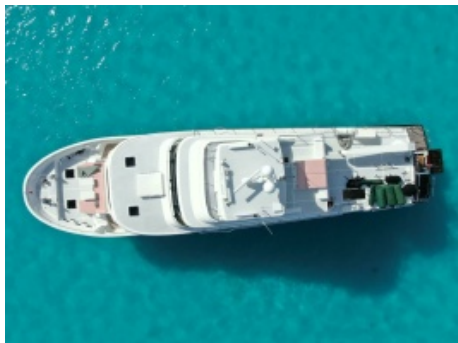
2024 Marlow 90 V - Artemis II From Above