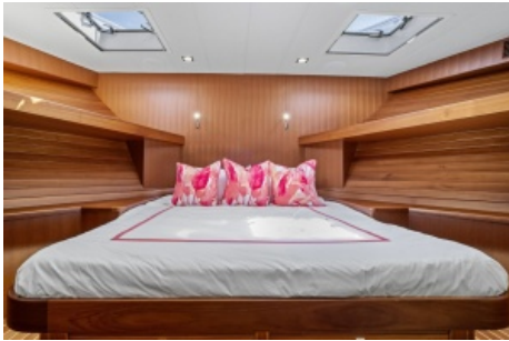
2024 Marlow 90 V - Artemis II