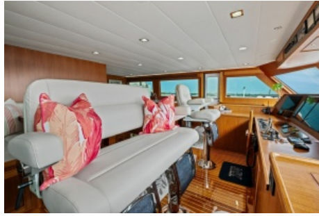
2024 Marlow 90 V - Artemis II