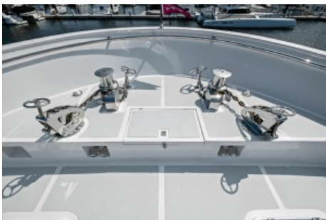
2024 Marlow 90 V - Artemis II