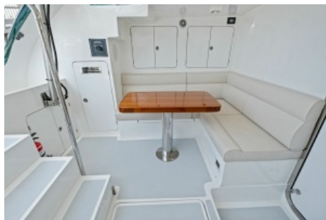
DSC2024 Marlow 90 V - Artemis II 118383