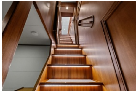
2024 Marlow 90 V - Artemis II