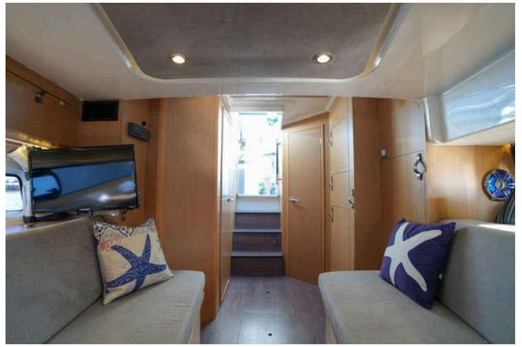
Looking aft from bow seating