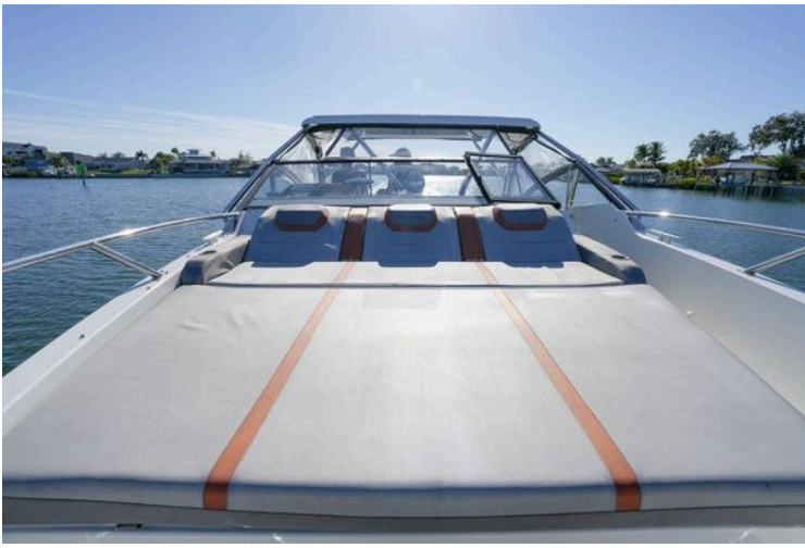
Sunpad on the bow