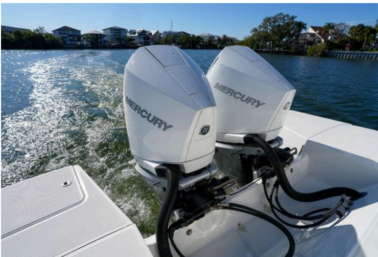
Verado 300 outboards