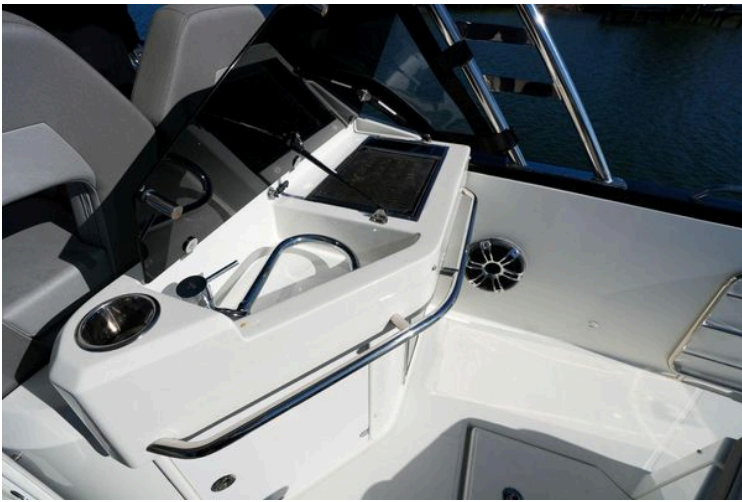
Cockpit grilling station