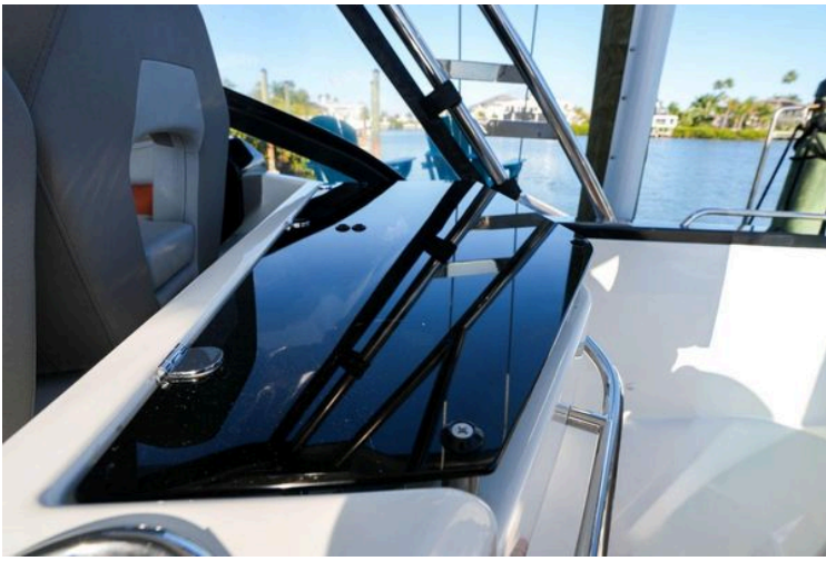
Cockpit grill cover