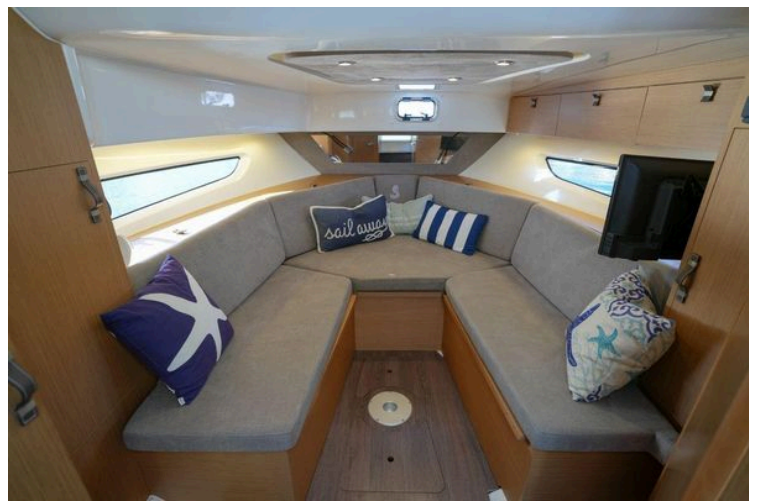
Forward interior seating