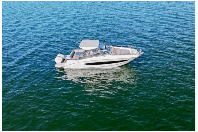
Starboard side profile