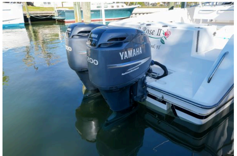
Yamaha 200 Motor