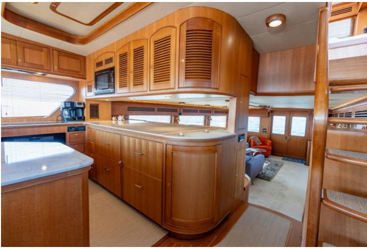
Marlow 72 GRIFFIN - Galley