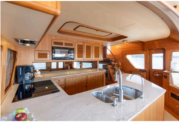
Marlow 72 GRIFFIN - Galley