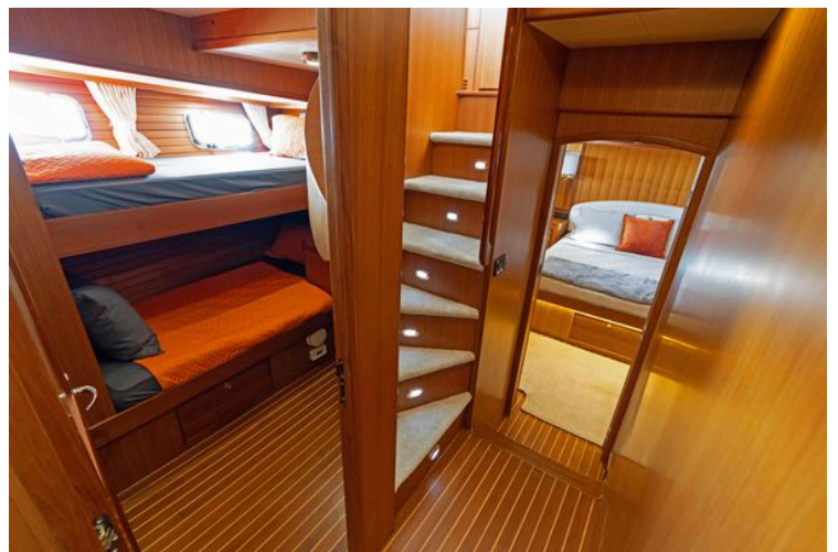
Marlow 72 GRIFFIN - Guest Stateroom Starboard