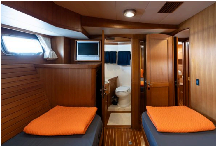
Marlow 72 GRIFFIN - Guest Stateroom Port with Ensuite Head