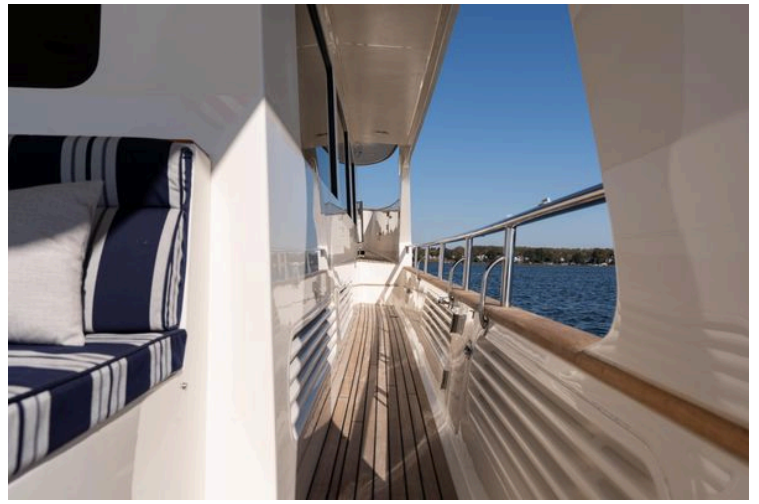
Marlow 72 GRIFFIN - Exterior