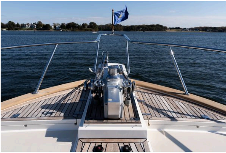
Marlow 72 GRIFFIN - Bow Ground Tackle