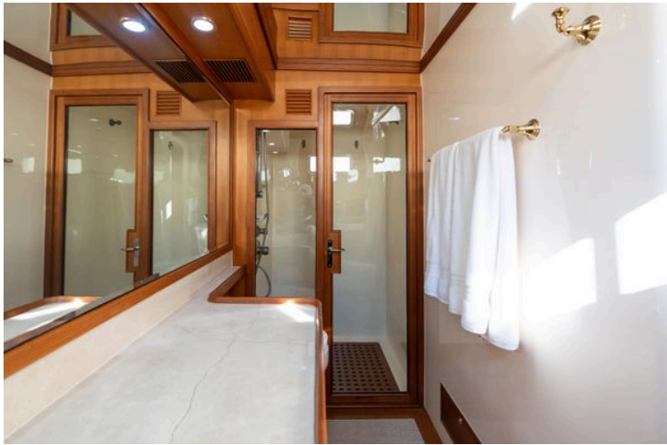
Marlow 72 GRIFFIN - Master Stateroom Ensuite Head