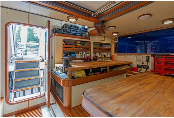
Marlow 72 GRIFFIN - Workshop