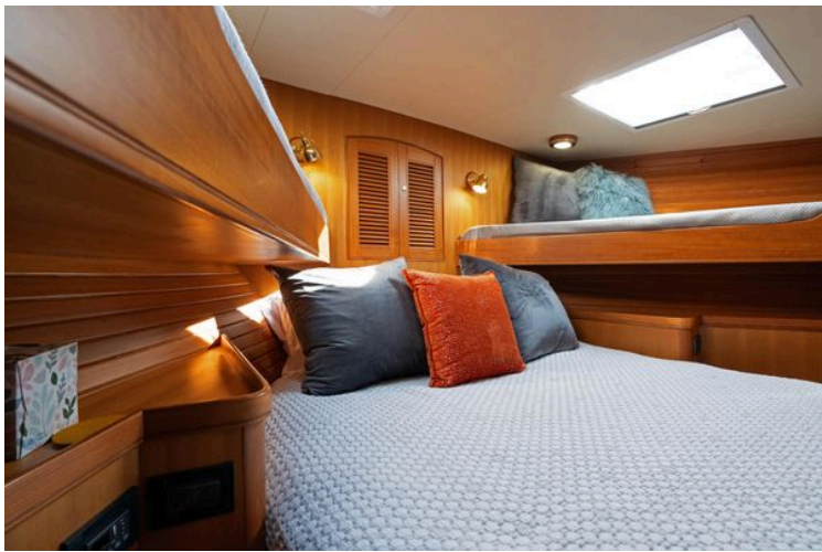
Marlow 72 GRIFFIN - VIP Stateroom Forward