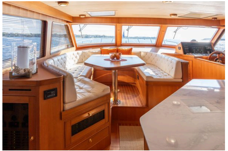
Marlow 72 GRIFFIN - Elevated Galley and Dining Helm Station