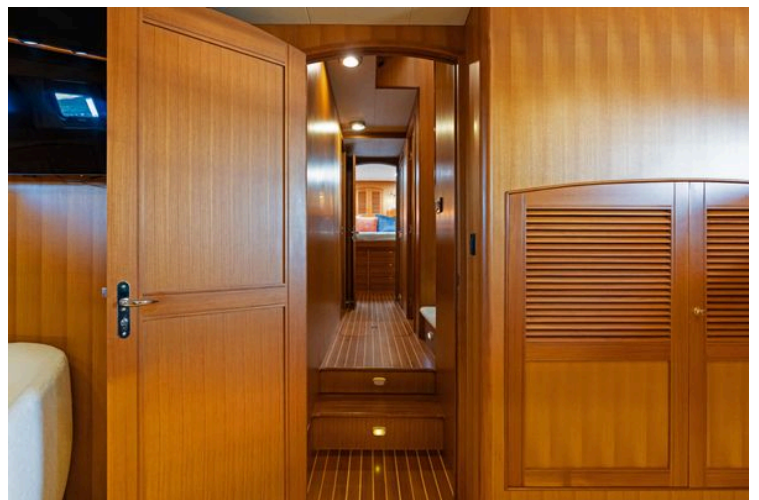
Marlow 72 GRIFFIN - Interior Hallway to Guest Cabins