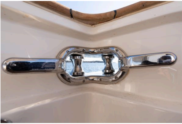
Marlow 72 GRIFFIN - Exterior Aft Deck