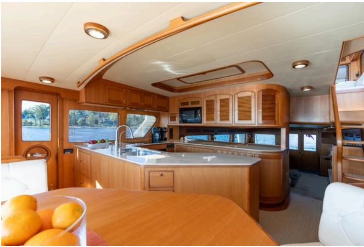
Marlow 72 GRIFFIN - Galley