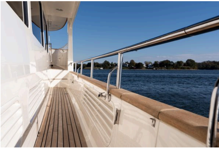
Marlow 72 GRIFFIN - Exterior