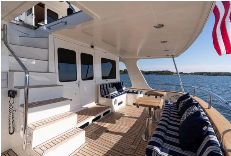
Marlow 72 GRIFFIN - Exterior Aft Deck