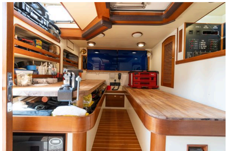
Marlow 72 GRIFFIN - Workshop