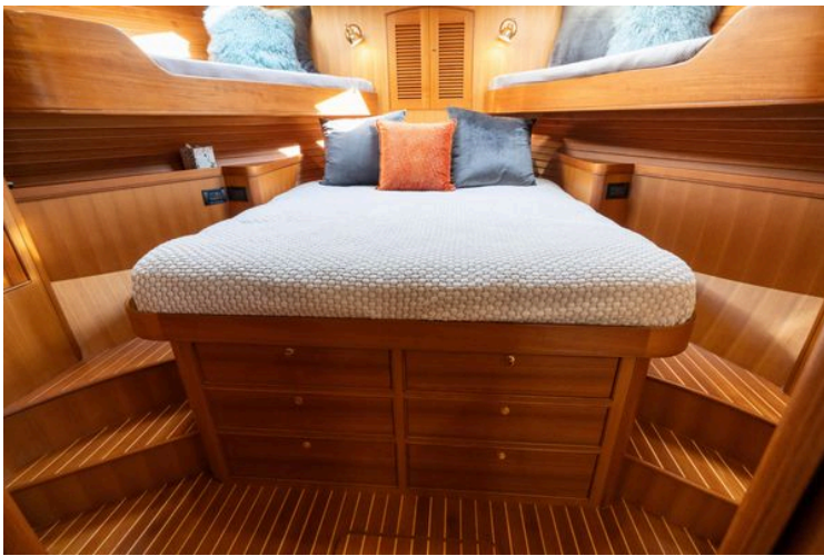
Marlow 72 GRIFFIN - VIP Stateroom Forward