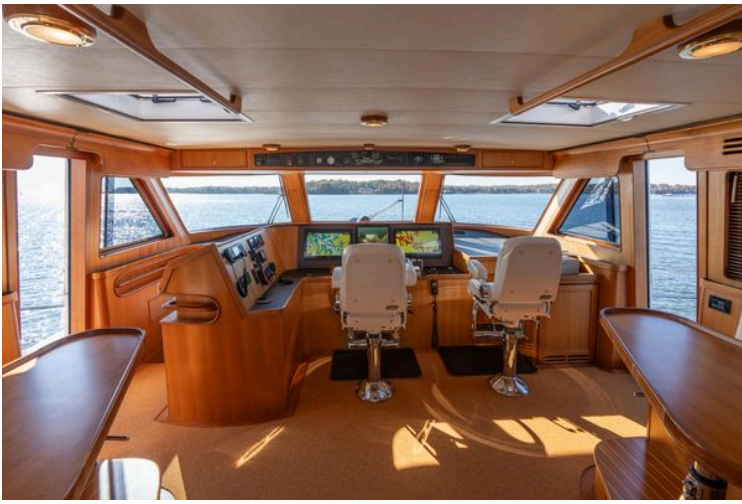
Marlow 72 GRIFFIN - Command Bridge Helm