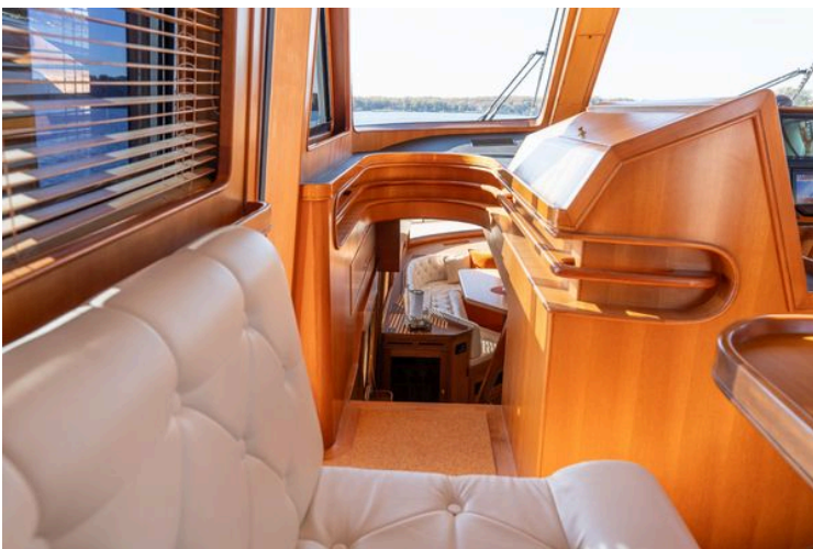
Marlow 72 GRIFFIN - Interior