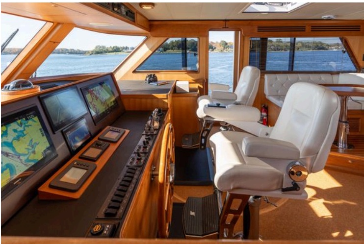
Marlow 72 GRIFFIN - Command Bridge Helm