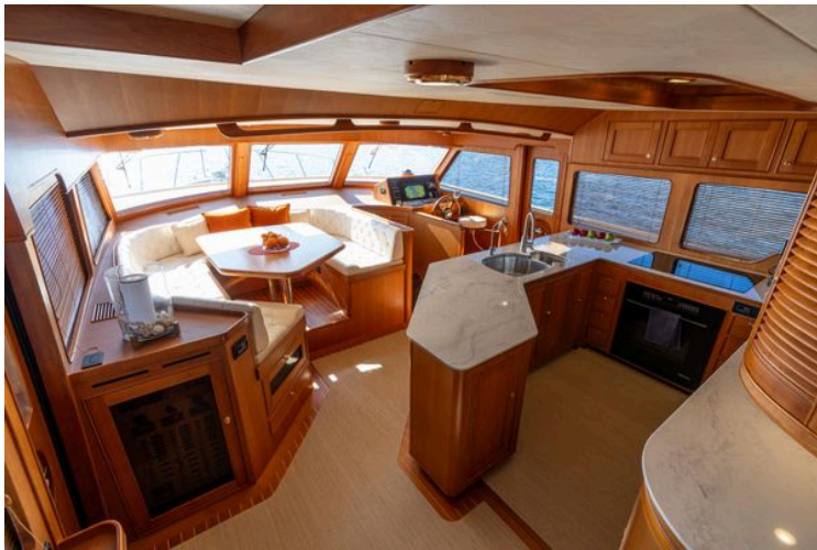
Marlow 72 GRIFFIN - Elevated Galley and Dining