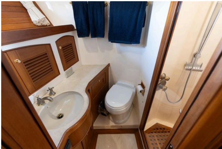
Marlow 72 GRIFFIN - Guest Stateroom Port ensuite Head