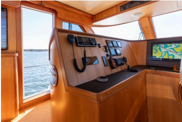
Marlow 72 GRIFFIN - Command Bridge