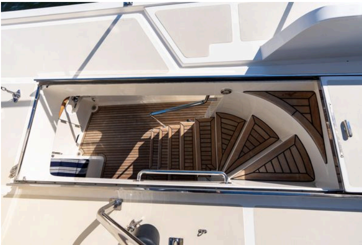
Marlow 72 GRIFFIN - Exterior