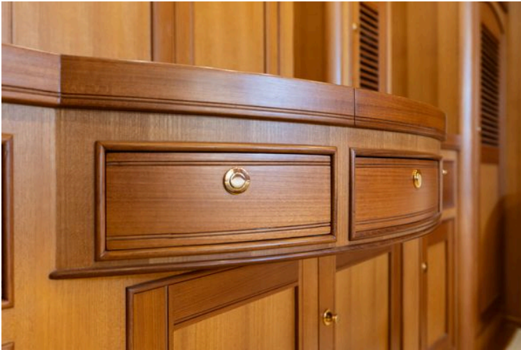
Marlow 72 GRIFFIN - Master Stateroom