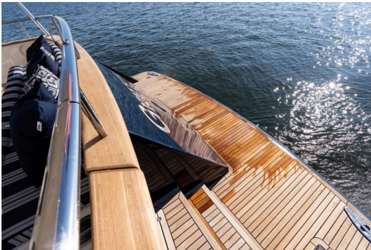
Marlow 72 GRIFFIN - Exterior