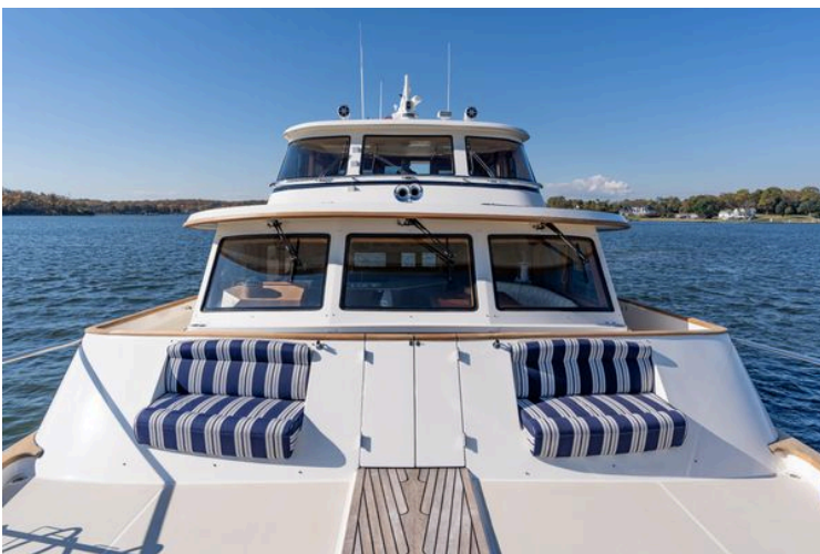
Marlow 72 GRIFFIN - Exterior Forward