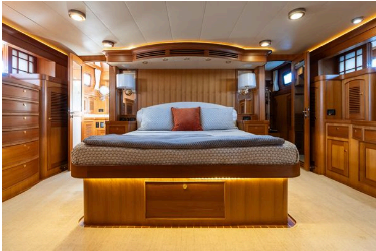
Marlow 72 GRIFFIN - Master Stateroom