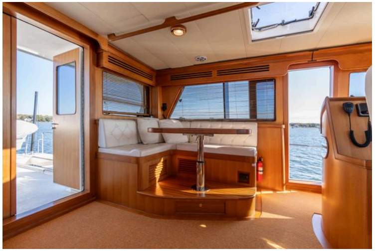
Marlow 72 GRIFFIN - Command Bridge Seating