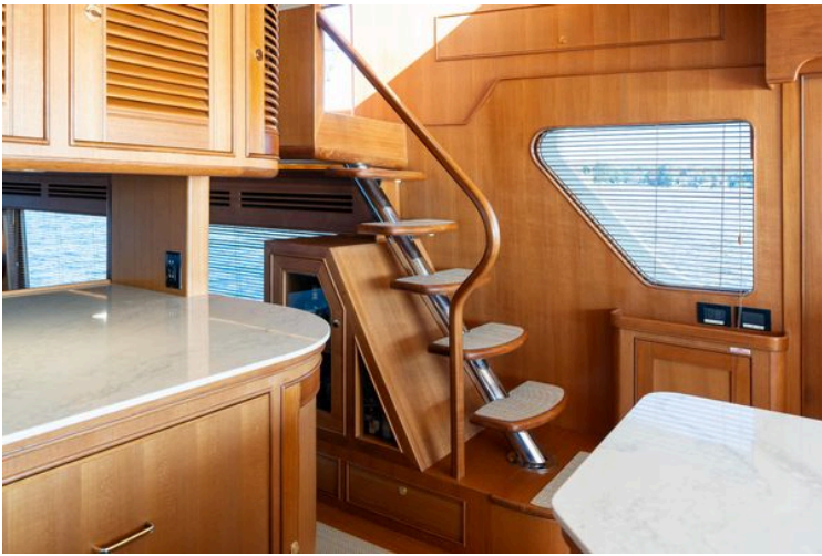
Marlow 72 GRIFFIN - Interior Stairs to Command Bridge