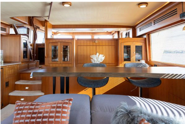
Marlow 72 GRIFFIN - Salon