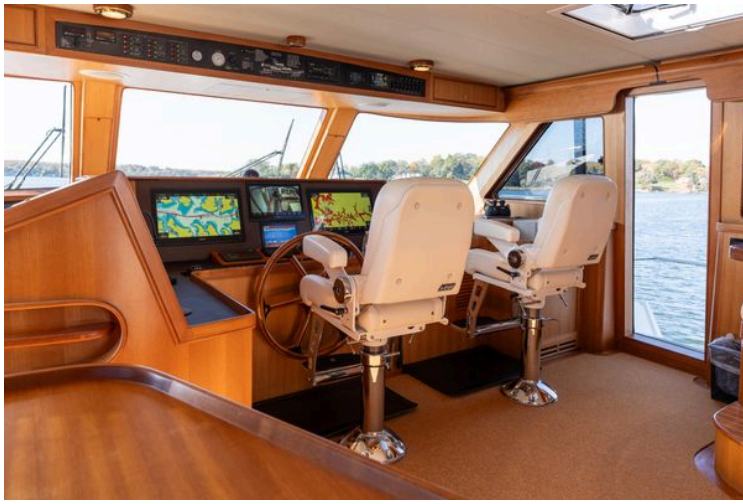
Marlow 72 GRIFFIN - Command Bridge Helm