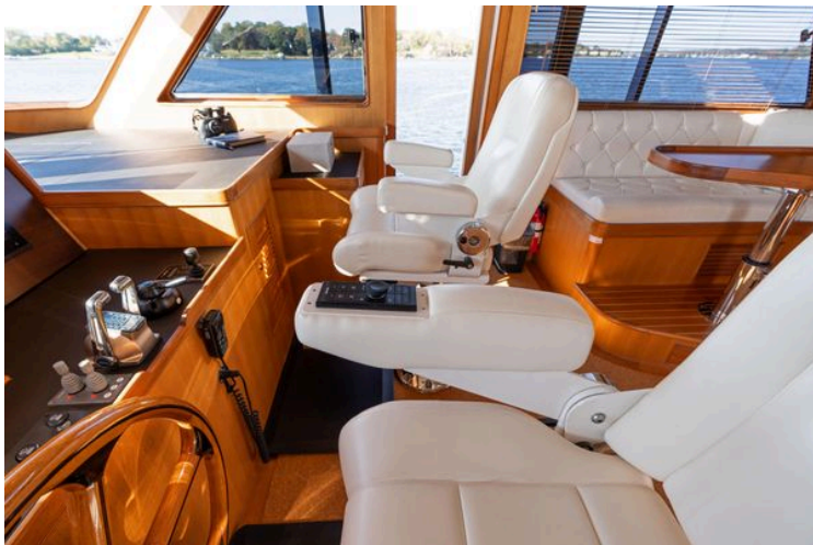
Marlow 72 GRIFFIN - Command Bridge Helm