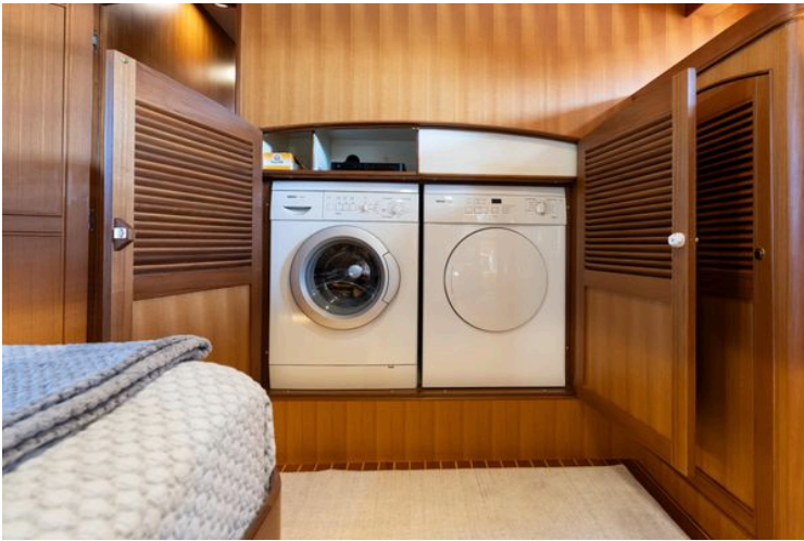
Marlow 72 GRIFFIN - Washer and Dryer