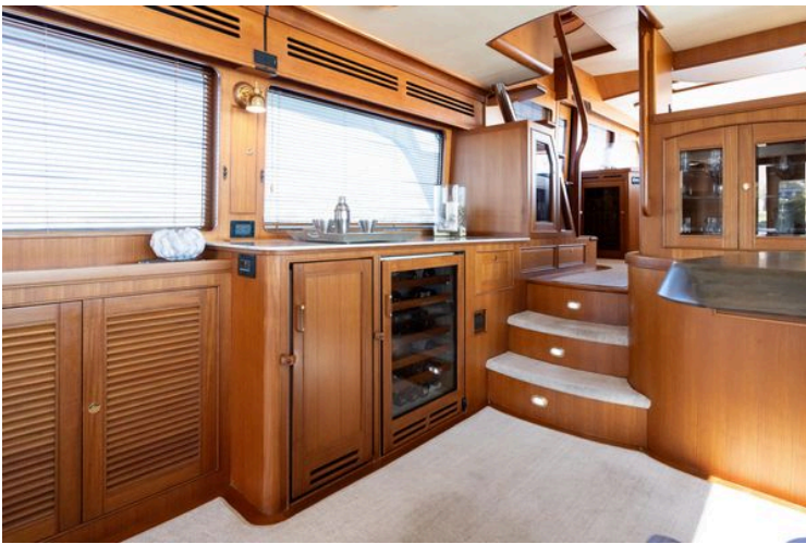
Marlow 72 GRIFFIN - Salon Steps to Elevated Galley and Dining