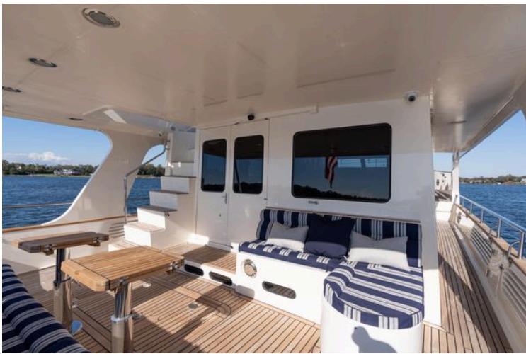
Marlow 72 GRIFFIN - Exterior Aft Deck