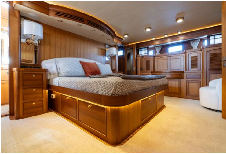
Marlow 72 GRIFFIN - Master Stateroom