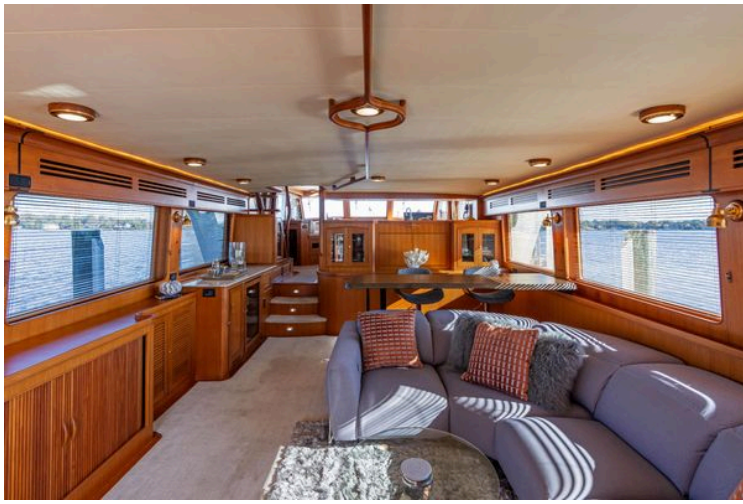
Marlow 72 GRIFFIN - Salon