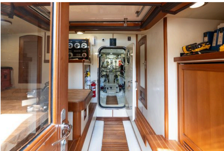
Marlow 72 GRIFFIN - Workshop/Engine Room Entrance