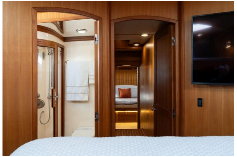
Marlow 72 GRIFFIN - Interior