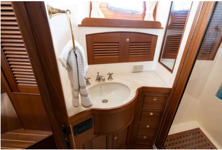
Marlow 72 GRIFFIN - Interior