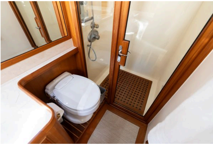
Marlow 72 GRIFFIN - Master Stateroom Ensuite Head