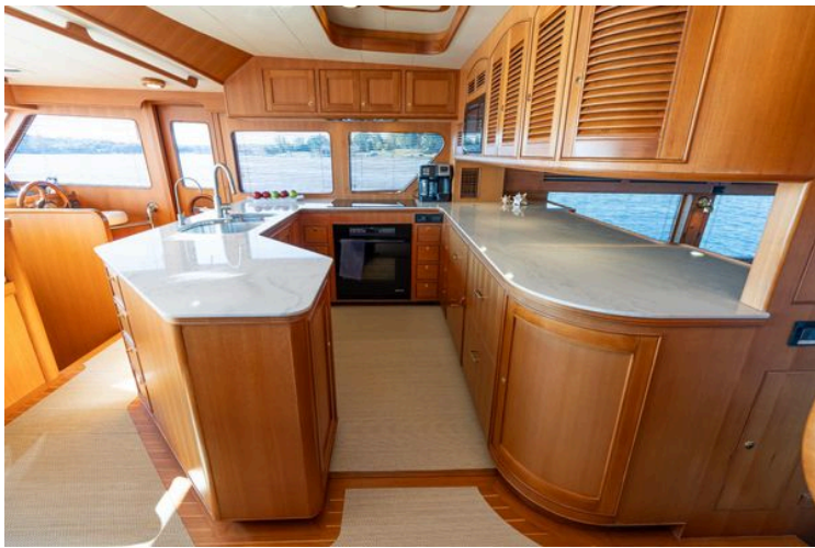
Marlow 72 GRIFFIN - Galley