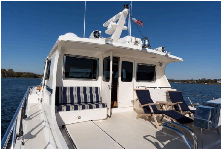
Marlow 72 GRIFFIN - Aft Flybridge