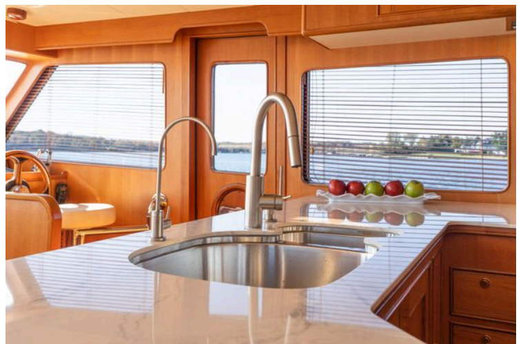
Marlow 72 GRIFFIN - Galley