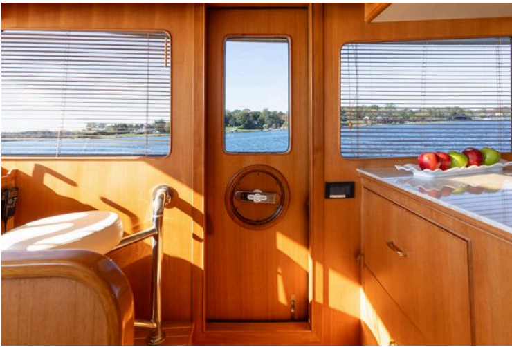
Marlow 72 GRIFFIN - Elevated Galley and Dining Helm Station