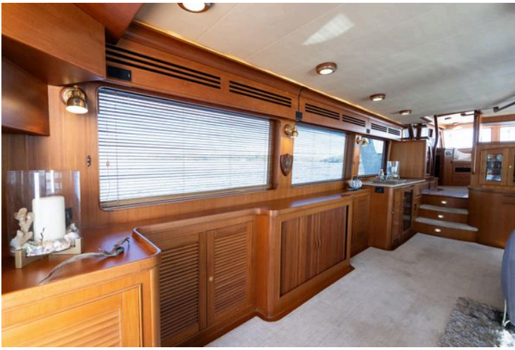
Marlow 72 GRIFFIN - Salon