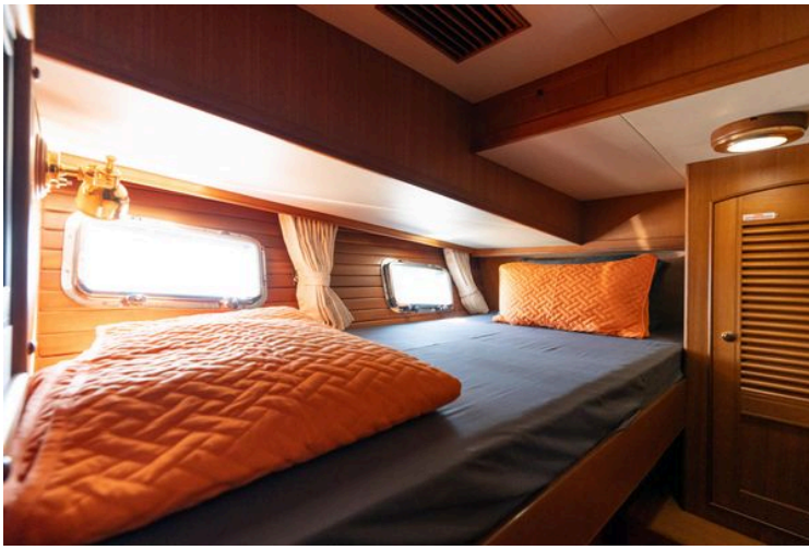
Marlow 72 GRIFFIN - Guest Stateroom Starboard