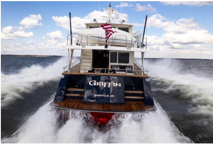
Marlow 72 GRIFFIN - Exterior