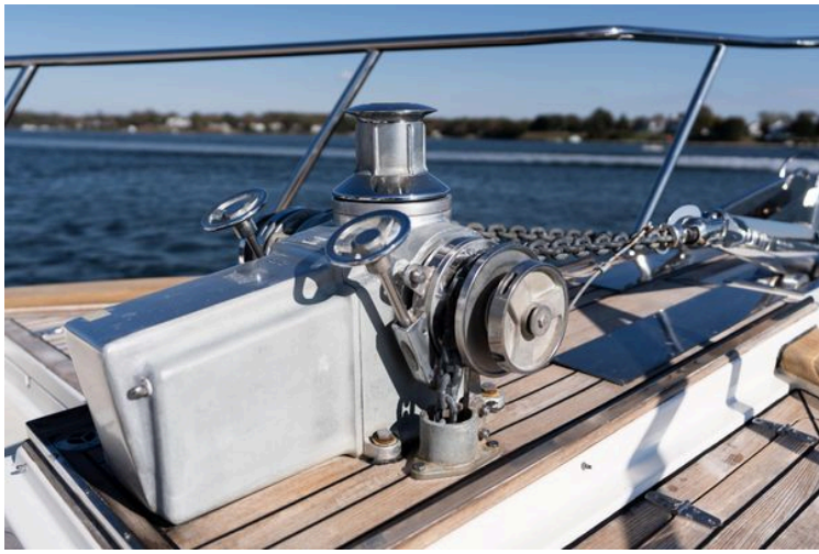
Marlow 72 GRIFFIN - Bow Ground Tackle