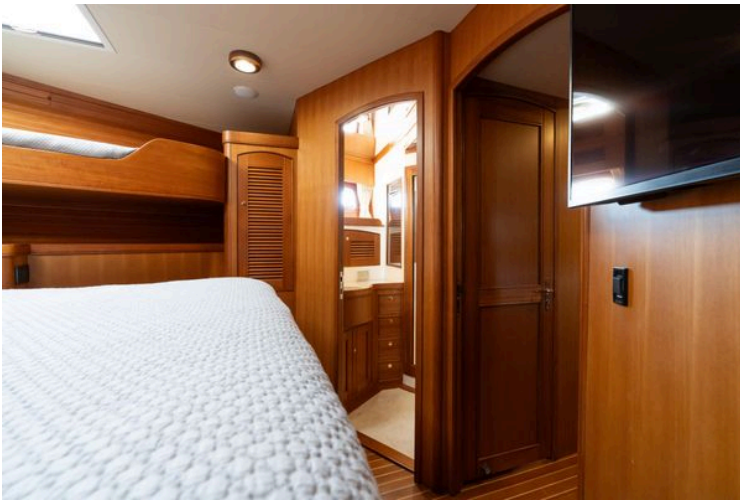
Marlow 72 GRIFFIN - VIP Stateroom Forward