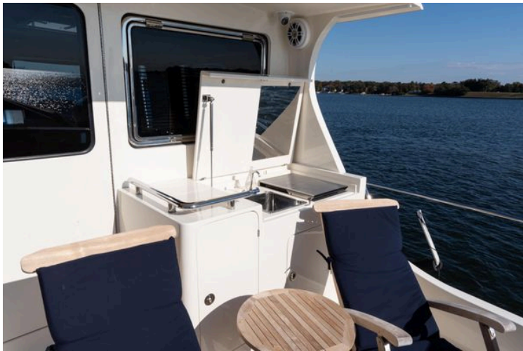
Marlow 72 GRIFFIN - Aft Flybridge