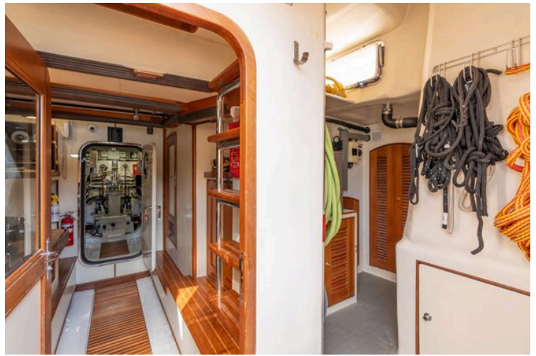
Marlow 72 GRIFFIN - Workshop/Engine Room Entrance