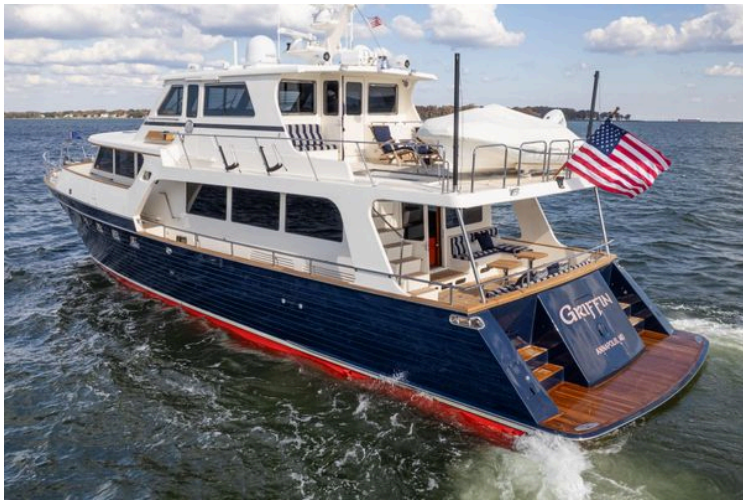
Marlow 72 GRIFFIN - Exterior