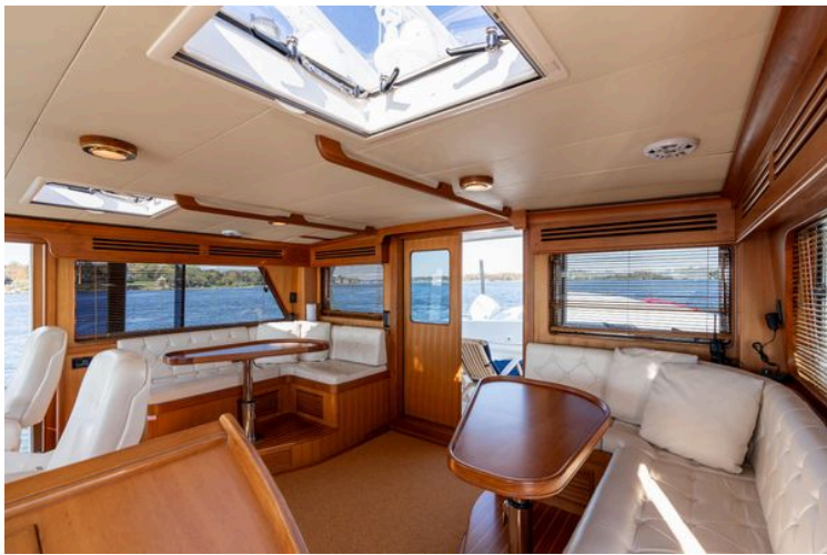
Marlow 72 GRIFFIN - Command Bridge