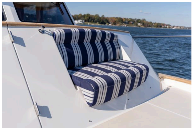
Marlow 72 GRIFFIN - Exterior Forward Seating