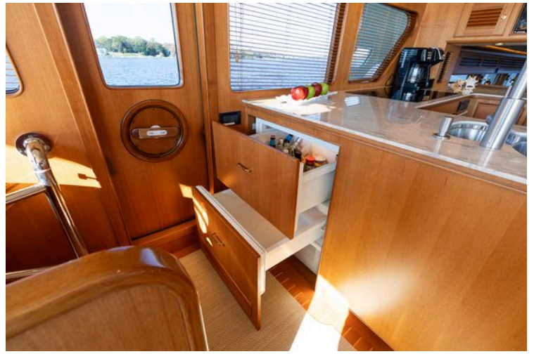
Marlow 72 GRIFFIN - Elevated Galley and Dining Storage