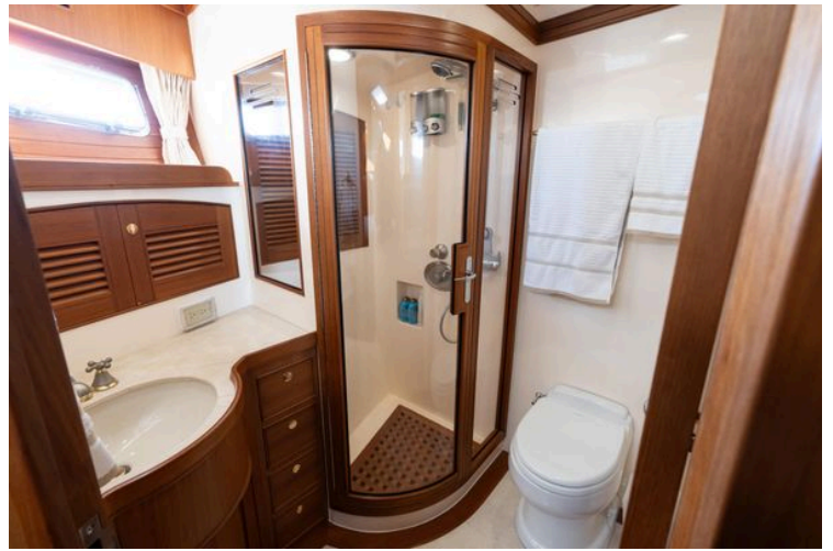
Marlow 72 GRIFFIN - Interior Ensuite Head