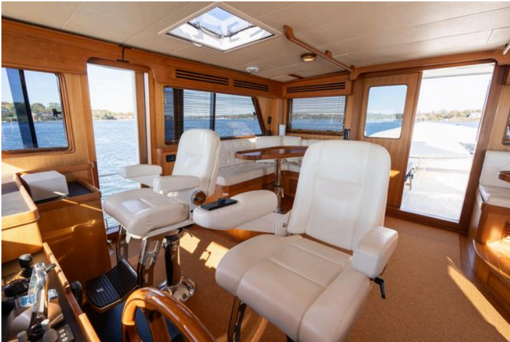
Marlow 72 GRIFFIN - Command Bridge Helm