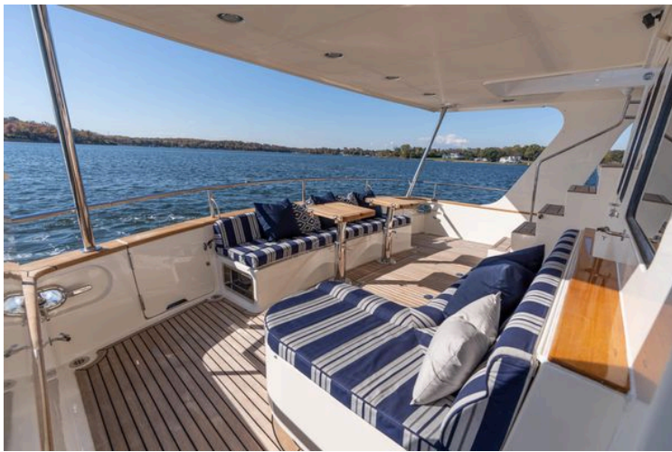
Marlow 72 GRIFFIN - Exterior Aft Deck