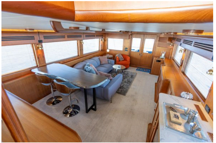
Marlow 72 GRIFFIN - Salon