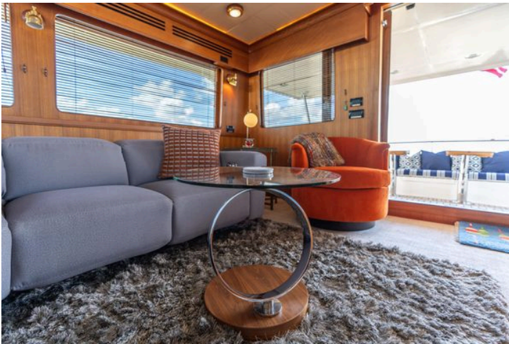
Marlow 72 GRIFFIN - Salon