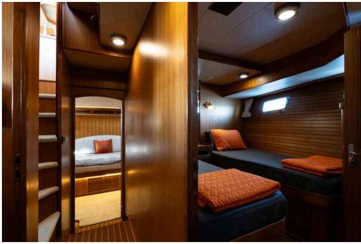
Marlow 72 GRIFFIN - Guest Stateroom Port