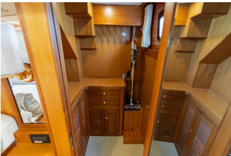
Marlow 72 GRIFFIN - Master Stateroom Walk in Closet