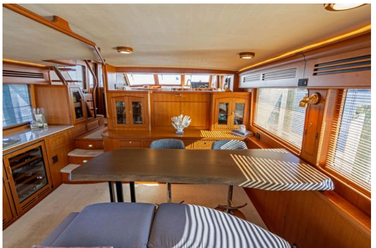
Marlow 72 GRIFFIN - Salon