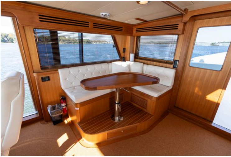
Marlow 72 GRIFFIN - Command Bridge Seating