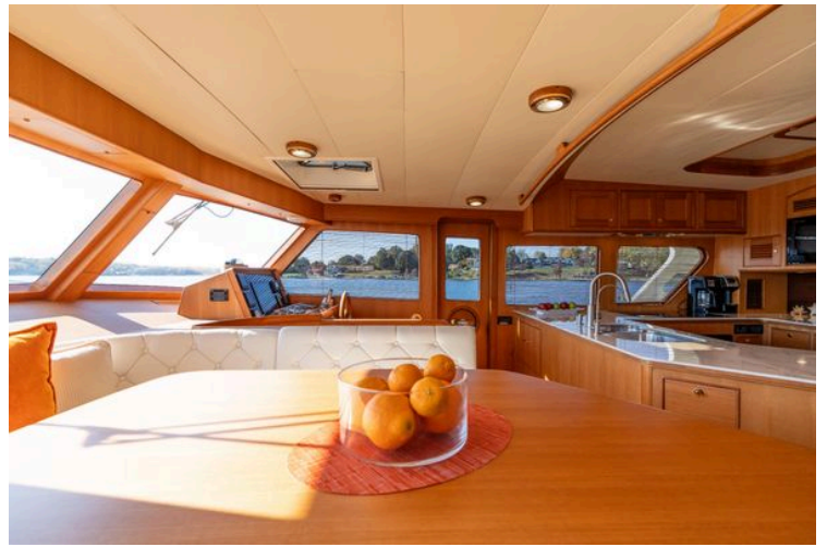
Marlow 72 GRIFFIN - Elevated Galley and Dining Helm Station