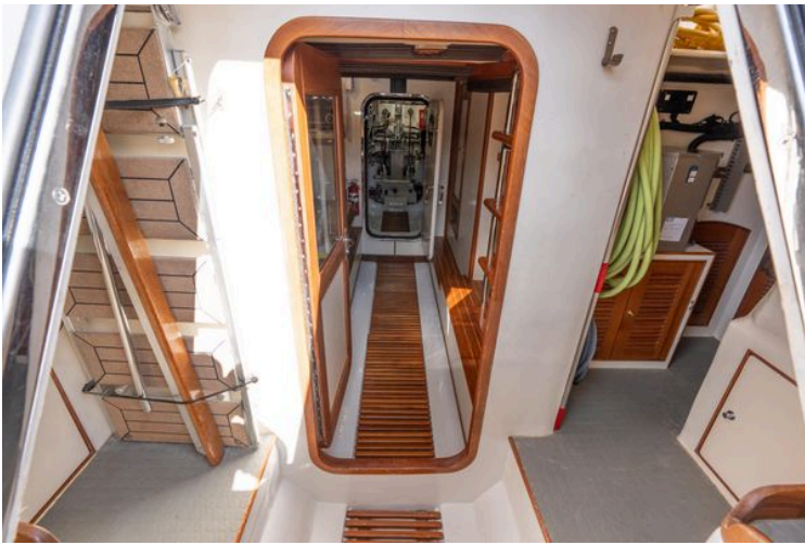
Marlow 72 GRIFFIN - Workshop/Engine Room Entrance