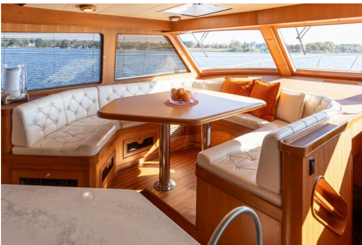
Marlow 72 GRIFFIN - Dining