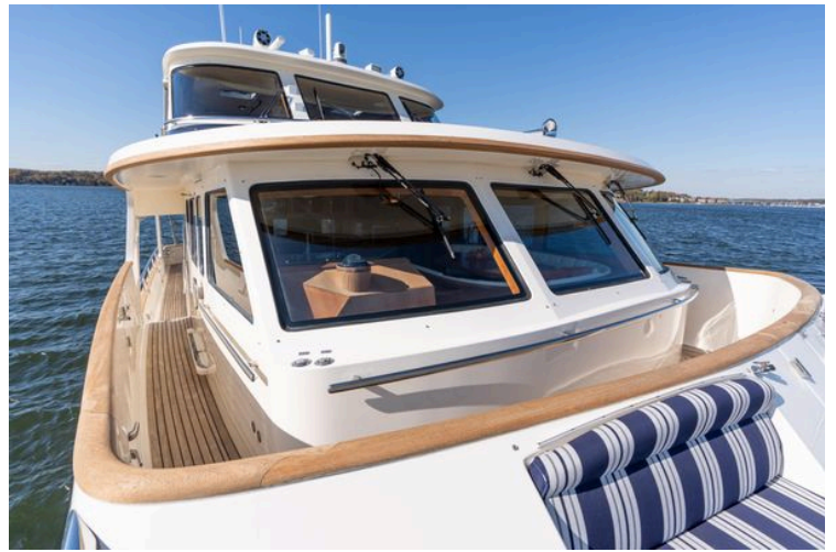
Marlow 72 GRIFFIN - Exterior Forward