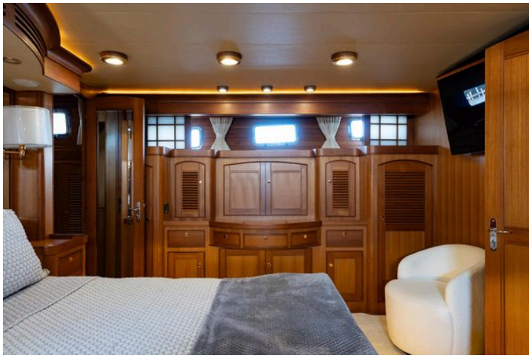
Marlow 72 GRIFFIN - Master Stateroom