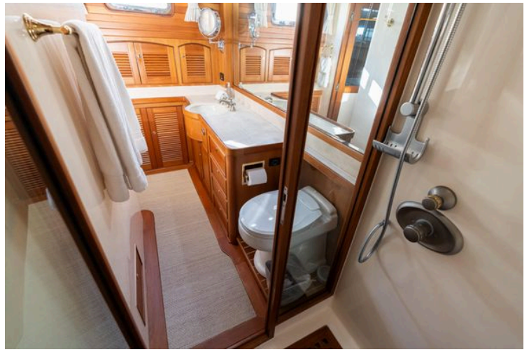
Marlow 72 GRIFFIN - Master Stateroom Ensuite Head