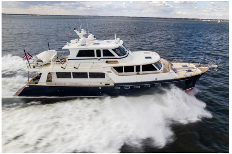
Marlow 72 GRIFFIN - Exterior