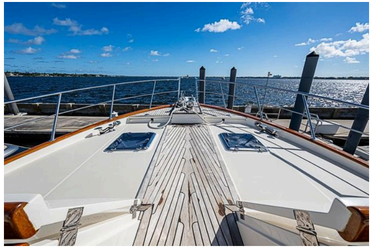
2014 Marlow Explorer 66E yacht deck with ocean view and clear blue sky.