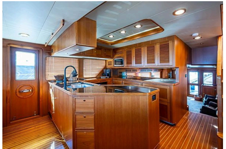
Luxurious wooden interior of 2014 Marlow Explorer 66E yacht kitchen.