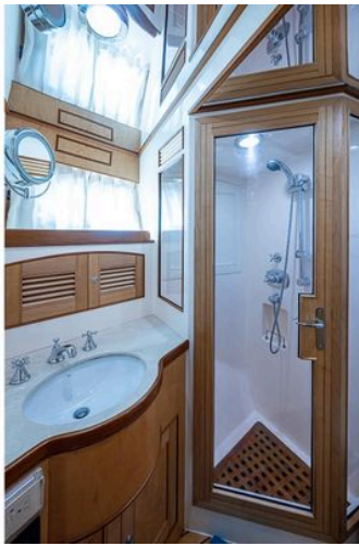
Luxurious bathroom in 2014 Marlow Explorer 66E yacht with wood accents and glass shower.