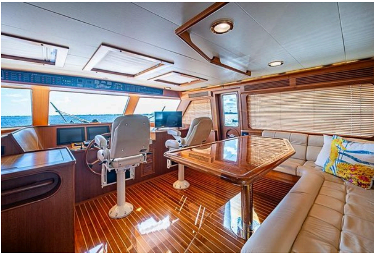
Luxurious interior of 2014 Marlow Explorer 66E yacht with wood finishes and plush seating.