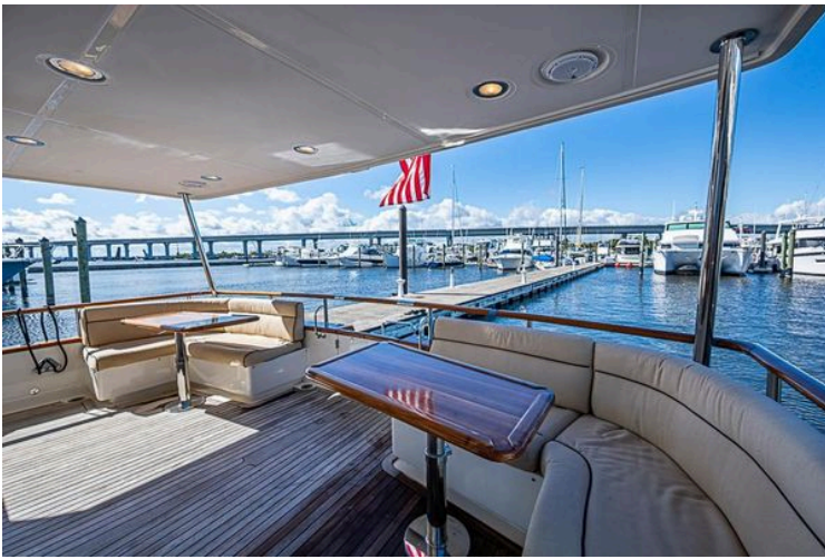
Luxurious 2014 Marlow Explorer 66E yacht deck with seating, docked at marina.