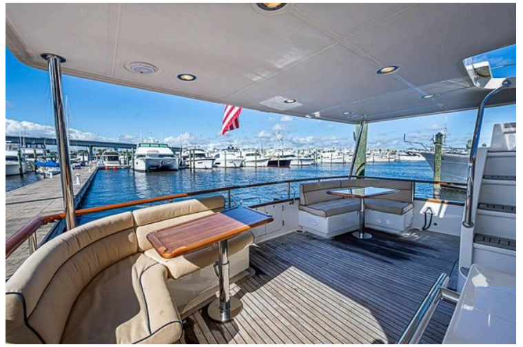
Luxurious 2014 Marlow Explorer 66E yacht deck with seating, docked at marina.