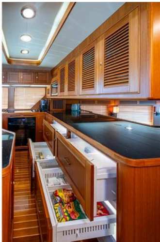
Luxurious 2014 Marlow Explorer 66E yacht kitchen with wooden cabinetry and modern appliances.