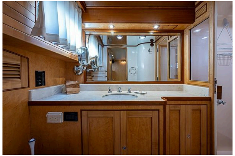
Luxurious bathroom interior of 2014 Marlow Explorer 66E yacht with wooden cabinetry and modern fixtures.