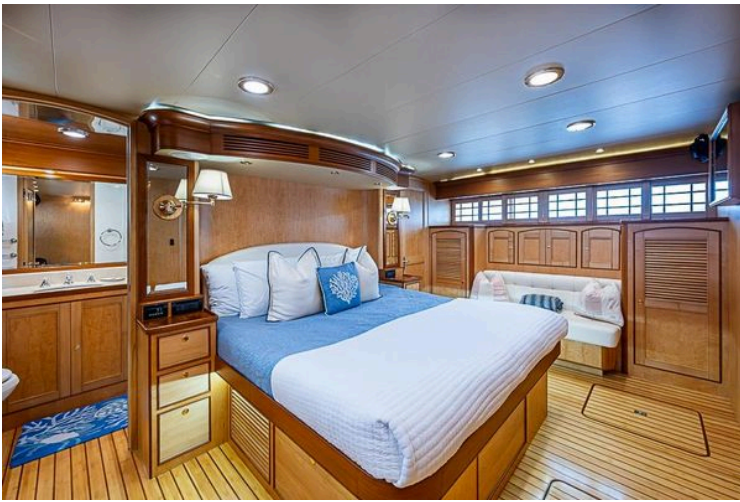
Luxurious cabin interior of 2014 Marlow Explorer 66E yacht with elegant wood finishes.