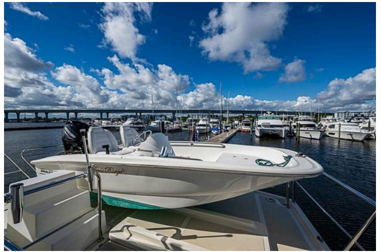
2014 Marlow Explorer 66E yacht docked at marina under blue sky.