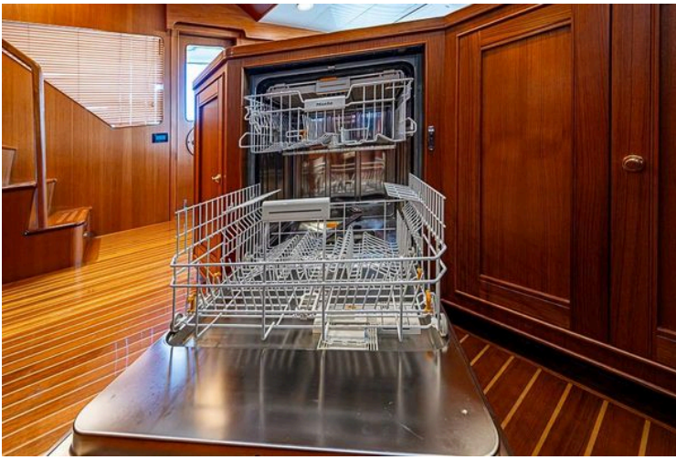
Open dishwasher in the 2014 Marlow Explorer 66E yacht's wooden interior.