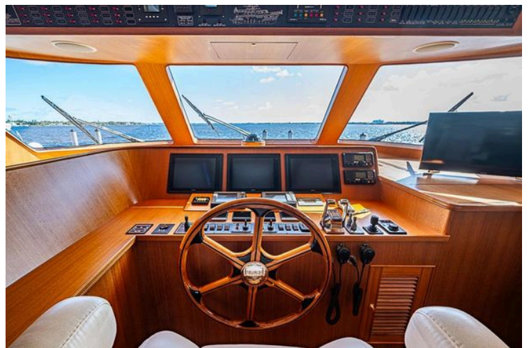
Pilothouse of 2014 Marlow Explorer 66E yacht with wooden steering wheel and navigation screens.