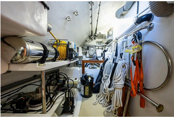
Engine room of 2014 Marlow Explorer 66E yacht with equipment and ropes.