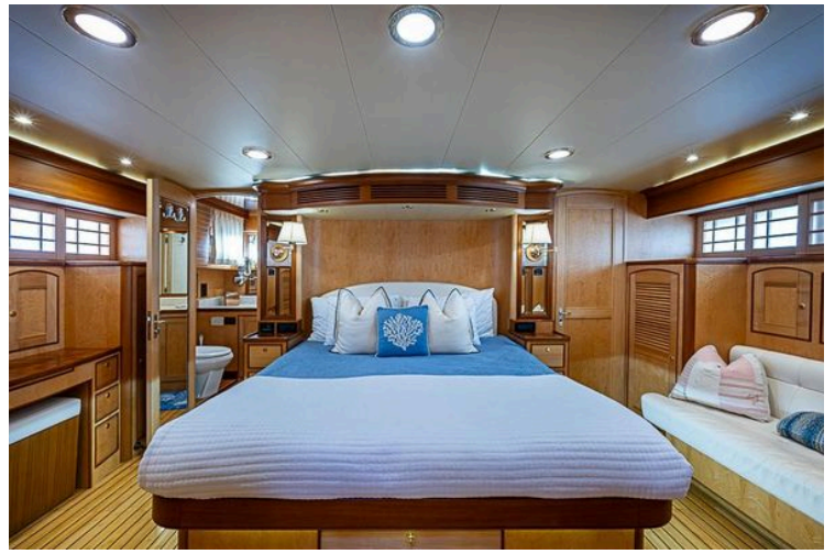
Luxurious cabin interior of 2014 Marlow Explorer 66E yacht with elegant wood finish.