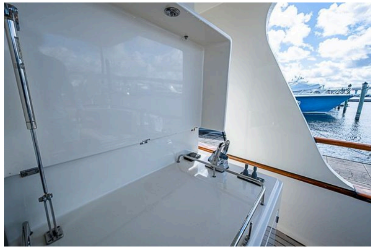
Outdoor sink on 2014 Marlow Explorer 66E yacht, docked with ocean view.