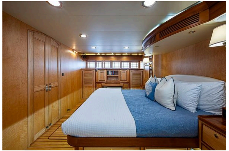
Luxurious cabin interior of 2014 Marlow Explorer 66E yacht with elegant wood finish.