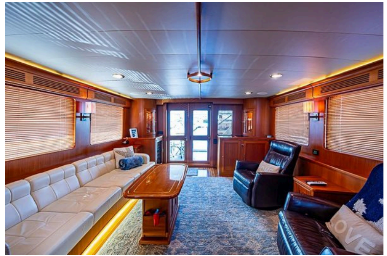
Luxurious interior of 2014 Marlow Explorer 66E yacht with elegant seating and wooden accents.