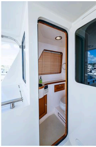
2014 Marlow Explorer 66E yacht bathroom interior with wooden accents and window blinds.