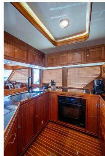
Luxurious kitchen interior of 2014 Marlow Explorer 66E yacht with wooden cabinetry and modern appliances.