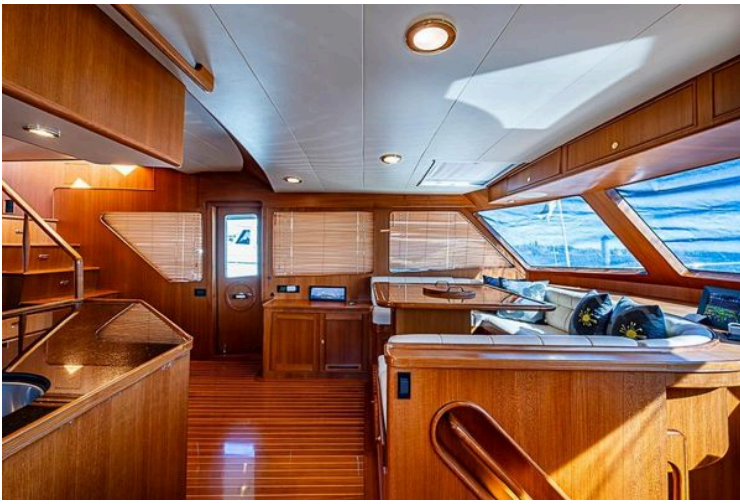
Luxurious interior of 2014 Marlow Explorer 66E yacht with wood finishes and plush seating.