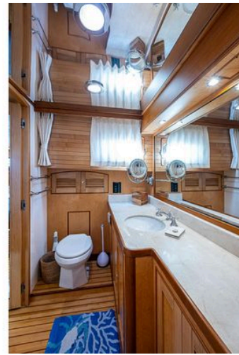
Luxurious bathroom in 2014 Marlow Explorer 66E yacht with wooden accents and modern fixtures.