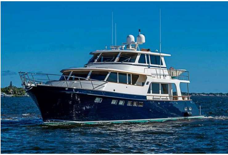
2014 Marlow Explorer 66E yacht cruising on open water under clear blue skies.