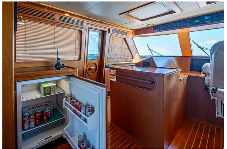
Interior of 2014 Marlow Explorer 66E yacht with open fridge and wooden finishes.