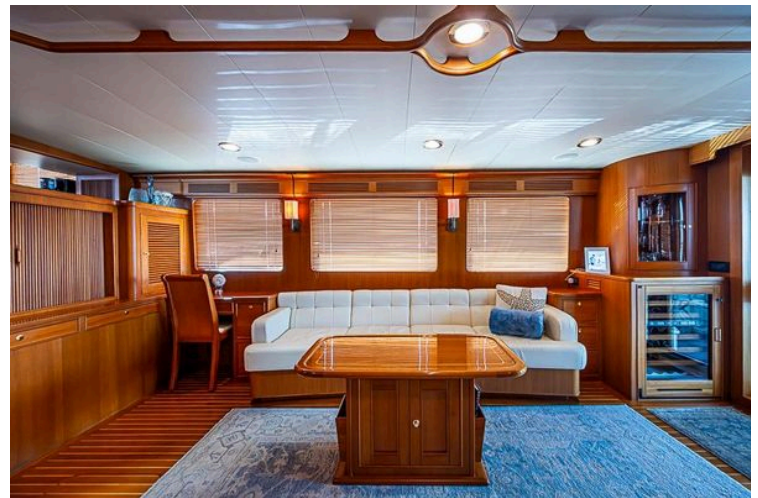
Luxurious interior of 2014 Marlow Explorer 66E yacht with elegant wood finishes.