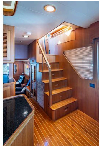
Luxurious wooden interior of 2014 Marlow Explorer 66E yacht with elegant staircase.