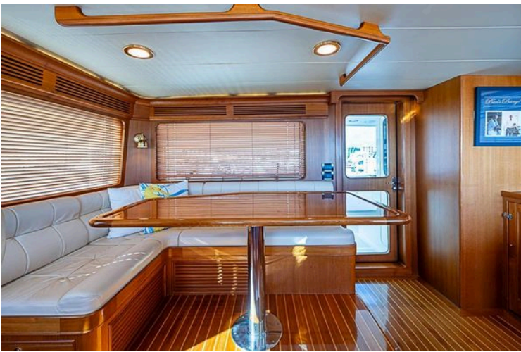
Luxurious interior of 2014 Marlow Explorer 66E yacht with elegant wood finishes and seating.