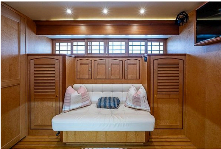
Luxurious interior of 2014 Marlow Explorer 66E yacht with cozy seating and wooden cabinetry.