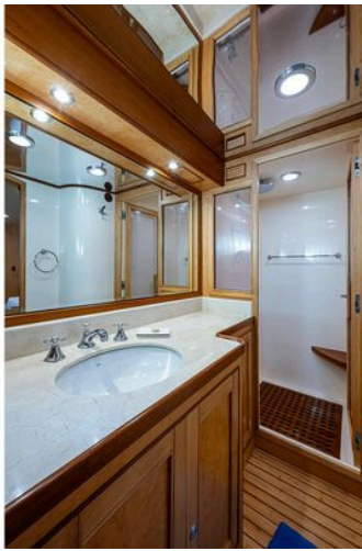
Luxurious bathroom in 2014 Marlow Explorer 66E yacht with wooden cabinetry and modern fixtures.