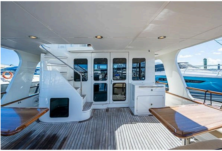
Luxurious 2014 Marlow Explorer 66E yacht deck with elegant wood finish and modern amenities.