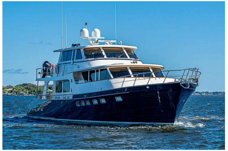
2014 Marlow Explorer 66E yacht cruising on open water under clear blue skies.