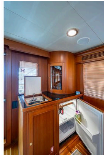
Luxurious galley area in 2014 Marlow Explorer 66E yacht with open fridge and sink.