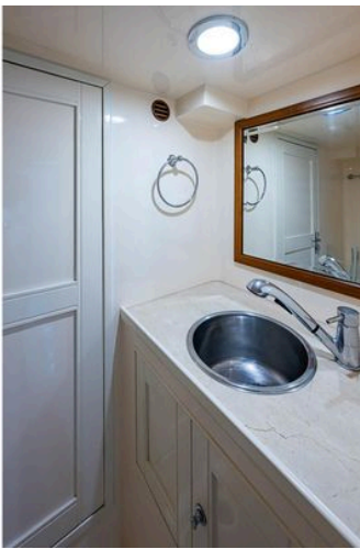
Bathroom interior of 2014 Marlow Explorer 66E yacht with sink and mirror.