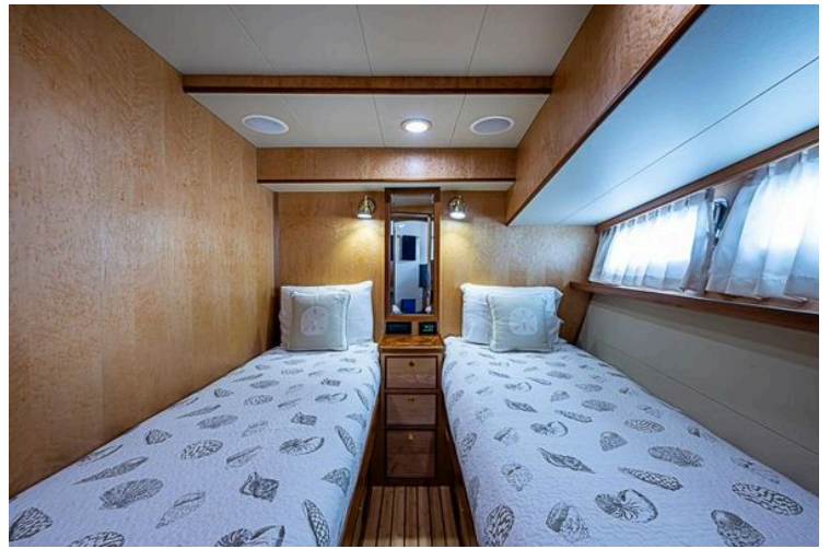
Cozy twin cabin in 2014 Marlow Explorer 66E yacht with wood paneling and nautical decor.