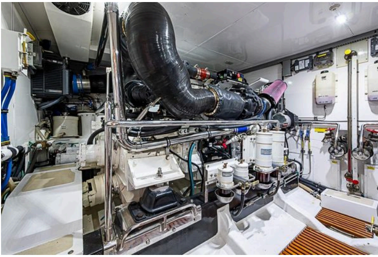
Engine room of 2014 Marlow Explorer 66E yacht, showcasing complex machinery and systems.