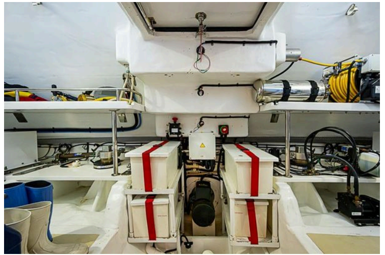
Engine room of 2014 Marlow Explorer 66E yacht, featuring equipment and storage.