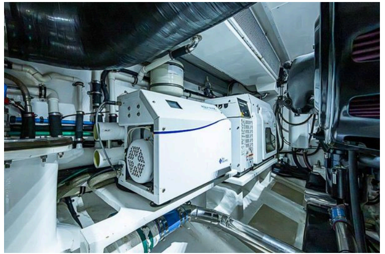
Engine room of 2014 Marlow Explorer 66E yacht, showcasing advanced machinery and equipment.