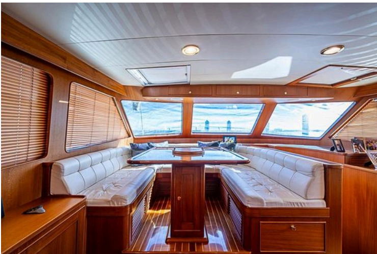
Luxurious interior of 2014 Marlow Explorer 66E yacht with elegant wood and leather seating.