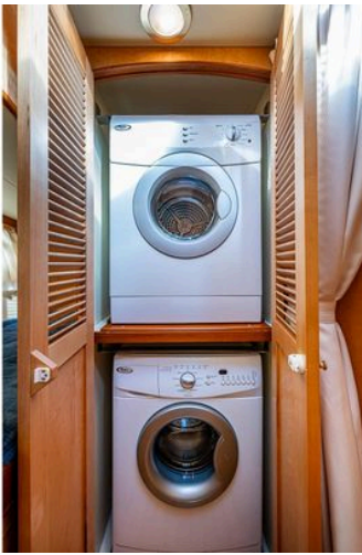
Stacked washer and dryer in 2014 Marlow Explorer 66E yacht laundry area.