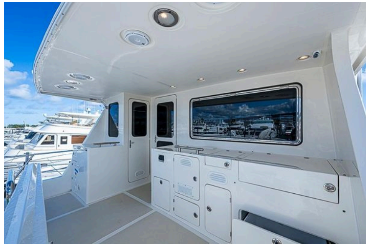
2014 Marlow Explorer 66E yacht deck with sleek design and modern amenities.