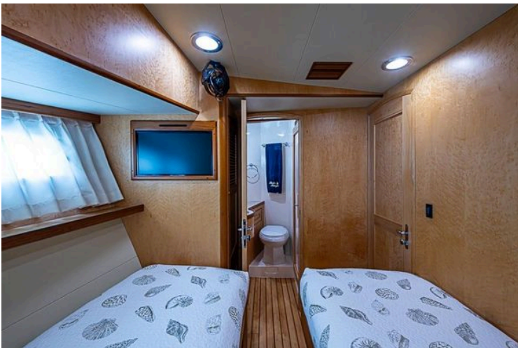
Luxurious cabin interior of 2014 Marlow Explorer 66E yacht with twin beds and ensuite bathroom.