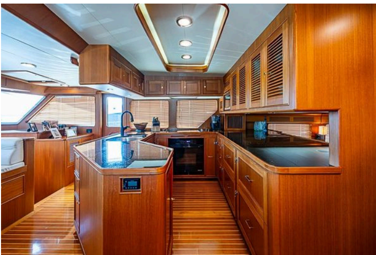
Luxurious wooden kitchen interior of 2014 Marlow Explorer 66E yacht.