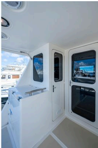
2014 Marlow Explorer 66E yacht deck with sleek white design and modern windows.