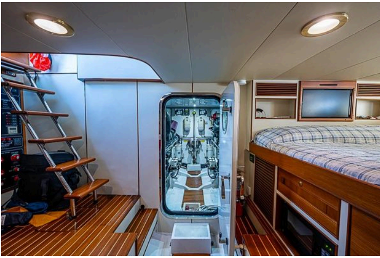
Interior of 2014 Marlow Explorer 66E yacht, featuring a cozy cabin and engine room access.