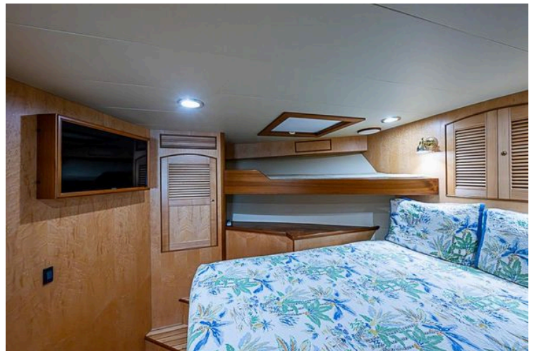
Luxurious cabin interior of 2014 Marlow Explorer 66E yacht with floral bedding.