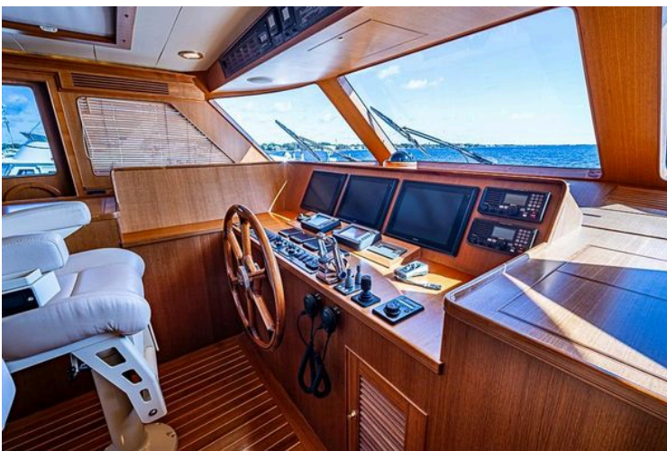
Luxurious 2014 Marlow Explorer 66E yacht helm with wooden finish and advanced navigation systems.