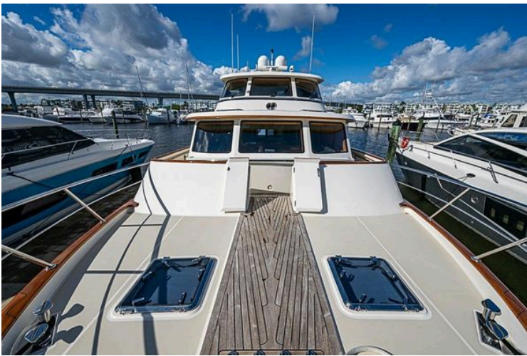
2014 Marlow Explorer 66E yacht docked at marina under blue sky.