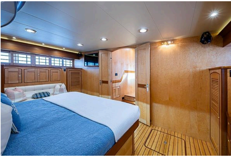
Luxurious cabin interior of 2014 Marlow Explorer 66E yacht with wood paneling and cozy bedding.