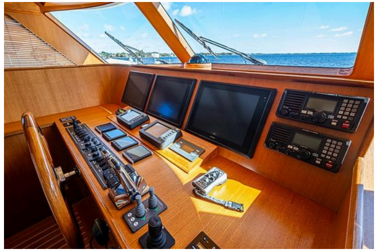
Control panel of 2014 Marlow Explorer 66E yacht with navigation screens and equipment.