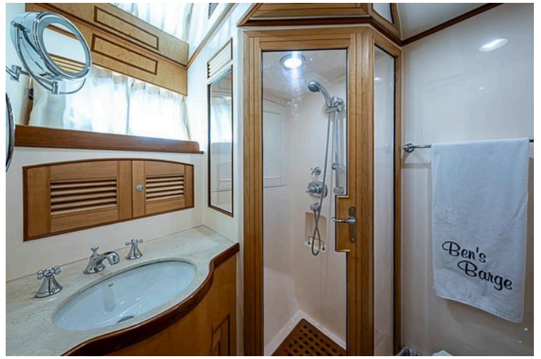
Luxurious bathroom in 2014 Marlow Explorer 66E yacht with shower and elegant fixtures.