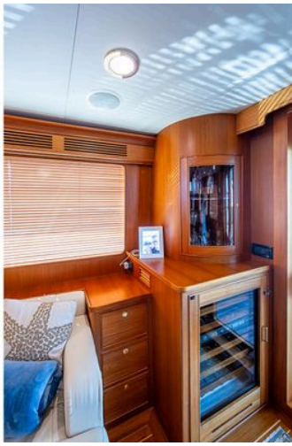
Luxurious interior of 2014 Marlow Explorer 66E yacht with wooden cabinetry and wine cooler.