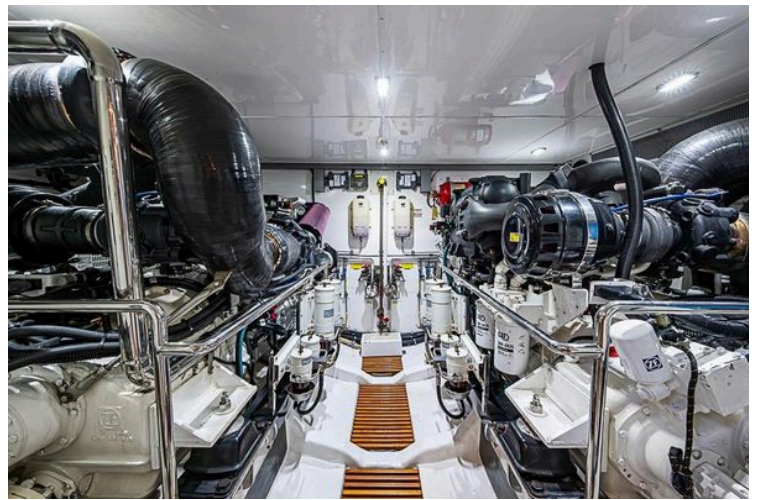
Engine room of 2014 Marlow Explorer 66E yacht, showcasing advanced machinery and equipment.