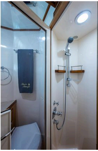
Shower area in 2014 Marlow Explorer 66E yacht with modern fixtures.