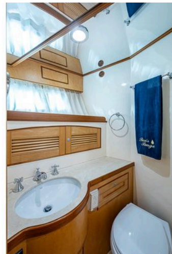
Luxurious bathroom in 2014 Marlow Explorer 66E yacht with elegant wood cabinetry.