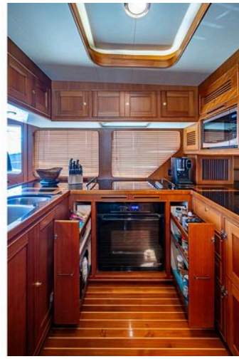
Luxurious kitchen interior of 2014 Marlow Explorer 66E yacht with wooden cabinetry and modern appliances.