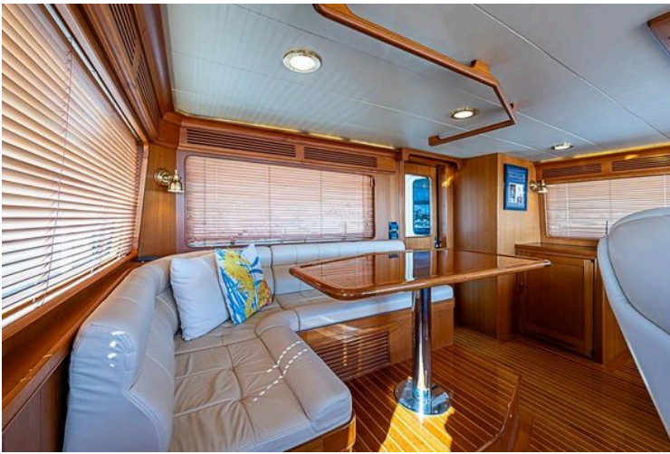
Luxurious interior of 2014 Marlow Explorer 66E yacht with elegant wood finishes and plush seating.