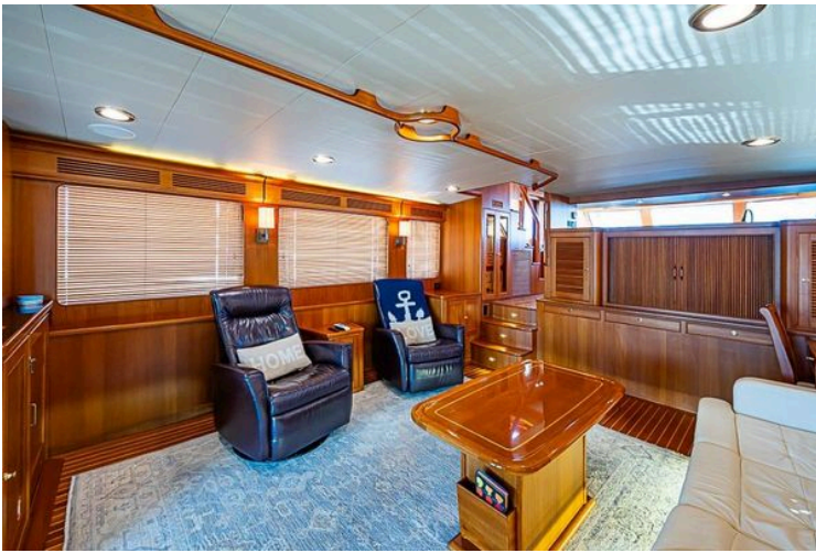
Luxurious interior of 2014 Marlow Explorer 66E yacht with elegant wood finishes.