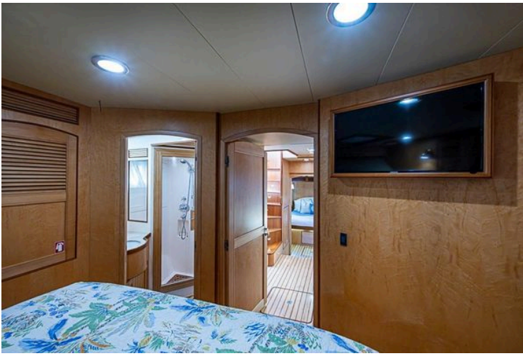
Luxurious cabin interior of 2014 Marlow Explorer 66E yacht with TV and ensuite bathroom.