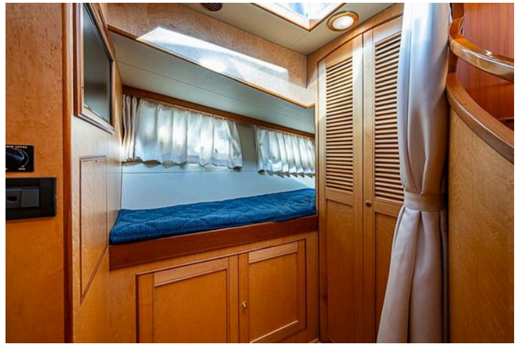
Interior cabin of 2014 Marlow Explorer 66E yacht with cozy bed and wooden finishes.