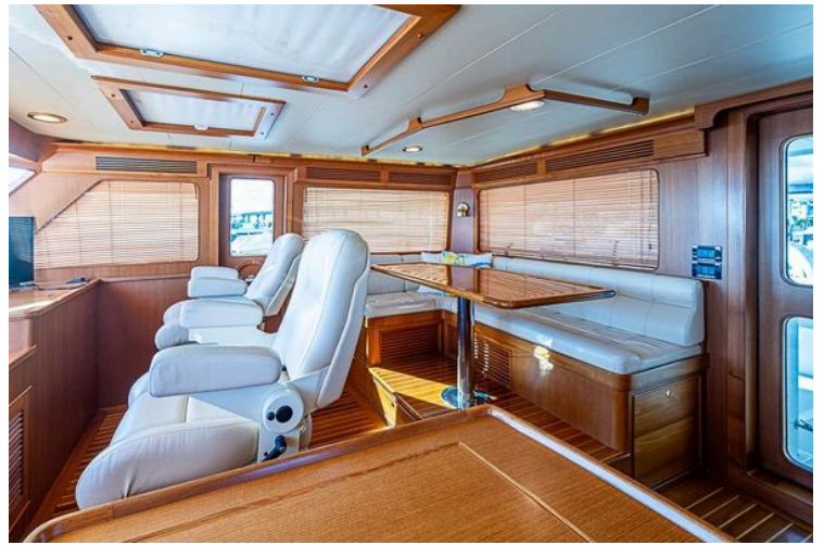
Luxurious interior of 2014 Marlow Explorer 66E yacht with plush seating and wooden accents.