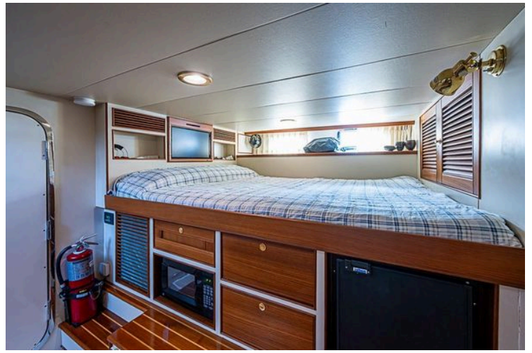
Cozy cabin interior of 2014 Marlow Explorer 66E yacht with bed and storage.