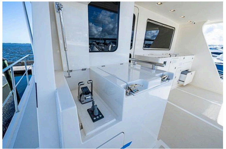
2014 Marlow Explorer 66E yacht deck with control panel and ocean view.