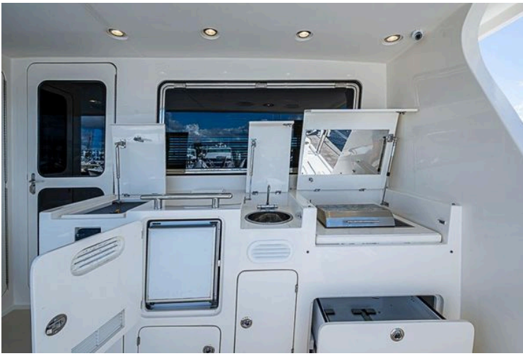
Outdoor kitchen on 2014 Marlow Explorer 66E yacht with grill and sink.