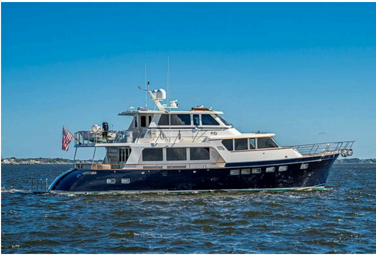
2014 Marlow Explorer 66E yacht cruising on open water under clear blue skies.