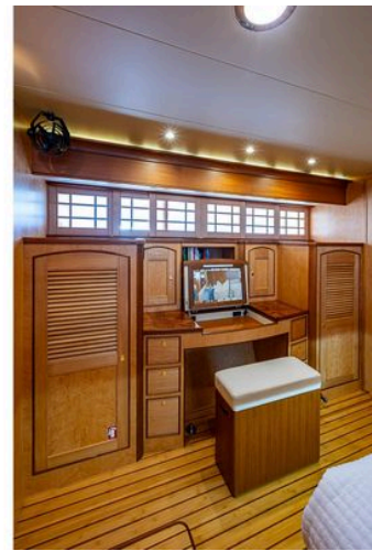
Luxurious wooden interior of 2014 Marlow Explorer 66E yacht with desk and seating.