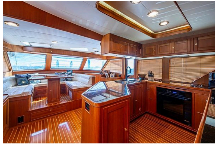
Luxurious interior of 2014 Marlow Explorer 66E yacht with wood finishes and modern amenities.