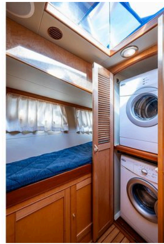
Laundry area and cozy cabin in 2014 Marlow Explorer 66E yacht.