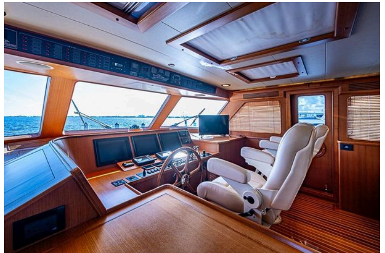
Luxurious interior of 2014 Marlow Explorer 66E yacht with modern navigation equipment.