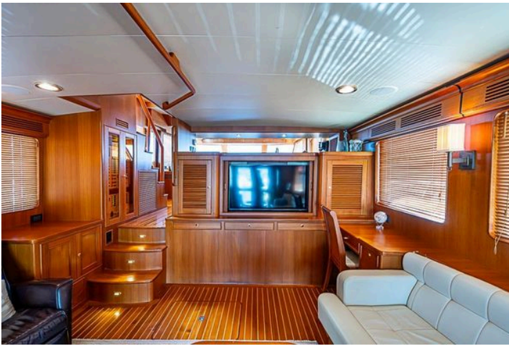
Luxurious interior of 2014 Marlow Explorer 66E yacht with wood paneling and modern furnishings.