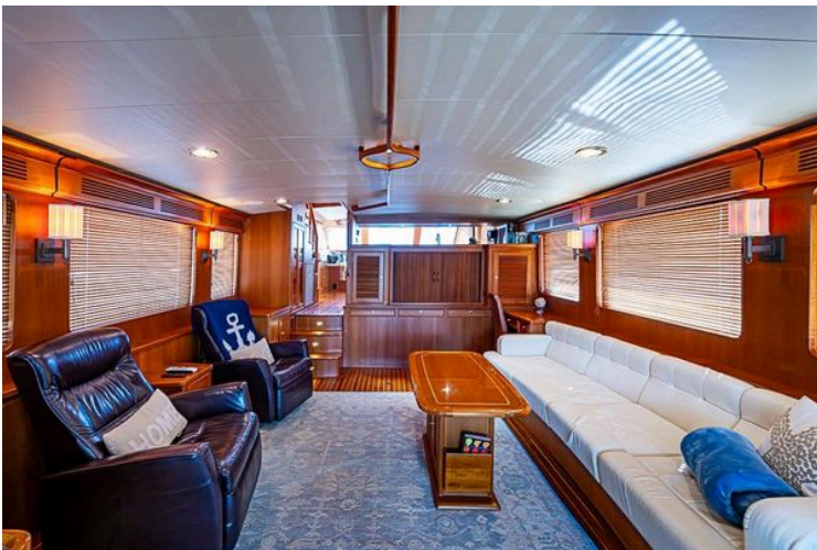
Luxurious interior of 2014 Marlow Explorer 66E yacht with leather seating and wooden accents.