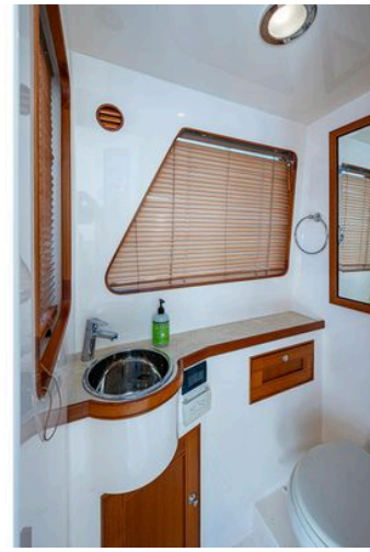
Luxurious bathroom in 2014 Marlow Explorer 66E yacht with wooden accents and modern fixtures.