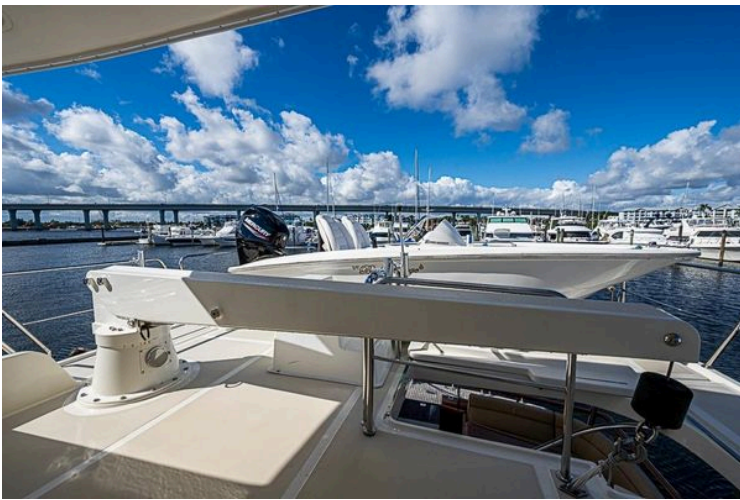
2014 Marlow Explorer 66E yacht docked at marina under blue sky.