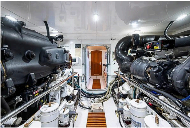
Engine room of 2014 Marlow Explorer 66E yacht, showcasing machinery and equipment.