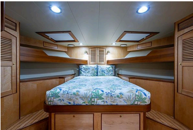
Luxurious cabin interior of 2014 Marlow Explorer 66E yacht with cozy bed and wooden accents.