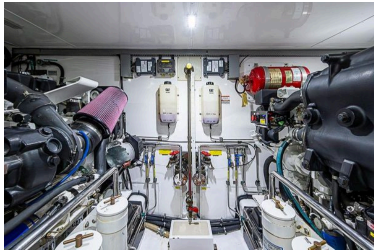
Engine room of 2014 Marlow Explorer 66E yacht, featuring advanced mechanical systems.