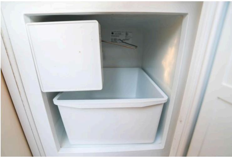
Ice maker compartment with open bin inside a 2007 Astondoa 53 Open Cruiser yacht.