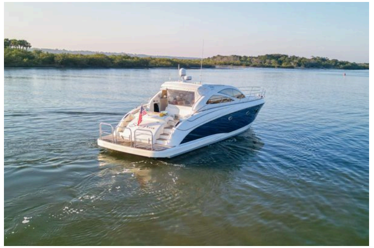
2007 Astondoa 53 Open Cruiser yacht on calm water, scenic background.