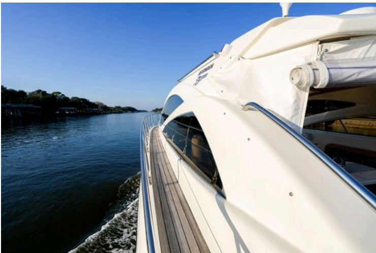
2007 Astondoa 53 Open Cruiser yacht cruising on a serene waterway.