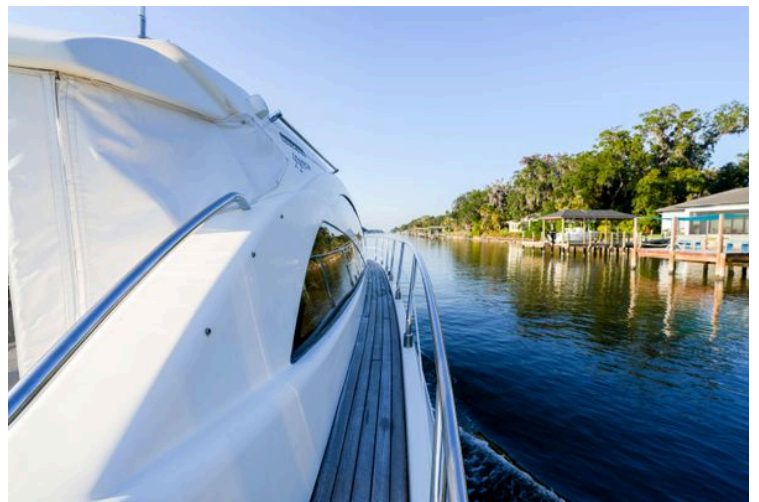
2007 Astondoa 53 Open Cruiser yacht cruising along a scenic waterfront.