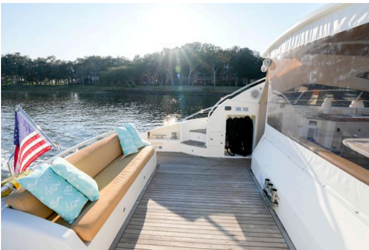
Astondoa 53 Open Cruiser 2007 yacht deck with seating, American flag, and scenic water view.