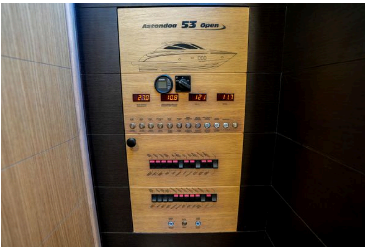
Control panel of a 2007 Astondoa 53 Open Cruiser yacht with digital displays and switches.