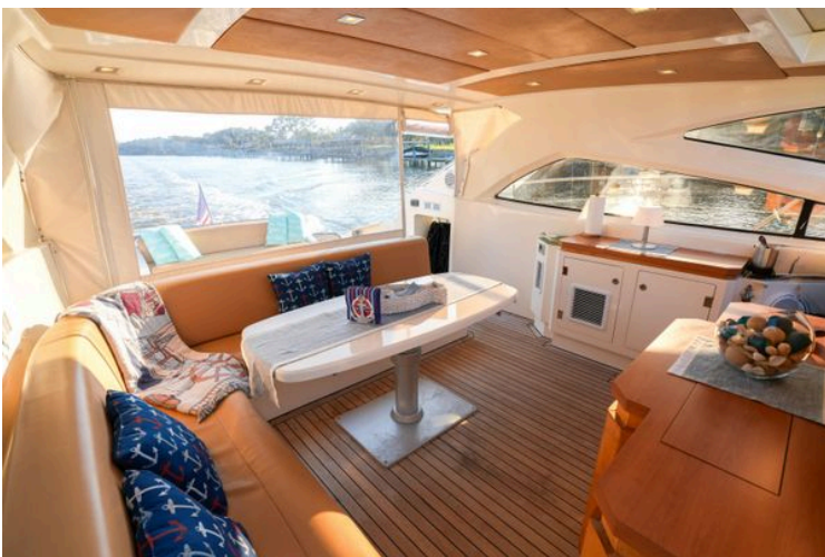
Luxurious interior of 2007 Astondoa 53 Open Cruiser with elegant seating and scenic water view.