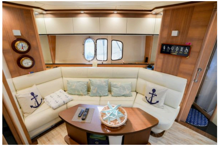
Luxurious interior of 2007 Astondoa 53 Open Cruiser with nautical-themed decor.