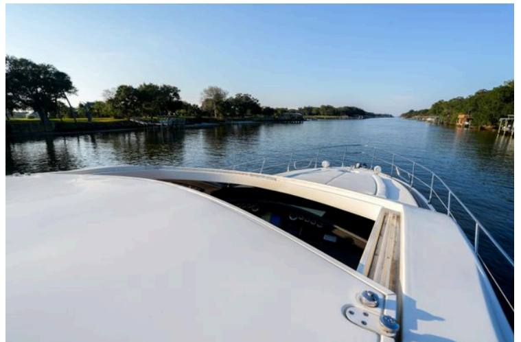
2007 Astondoa 53 Open Cruiser navigating a serene river with lush greenery.