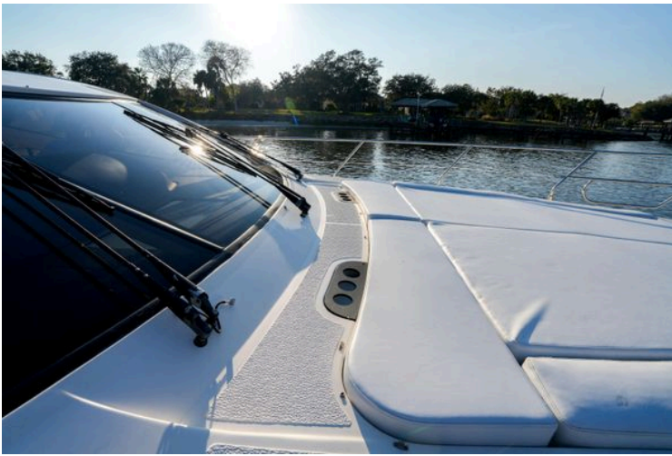
2007 Astondoa 53 Open Cruiser yacht deck with sunpad, docked by a scenic waterfront.