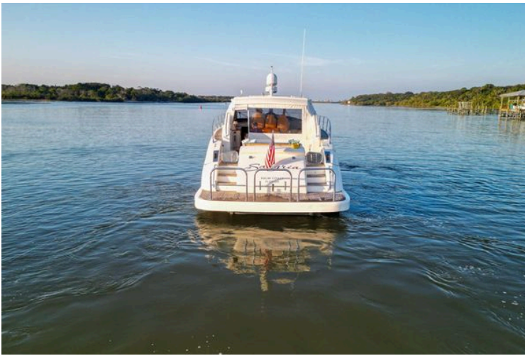
Astondoa 53 Open Cruiser 2007 on serene waterway, rear view with clear sky.