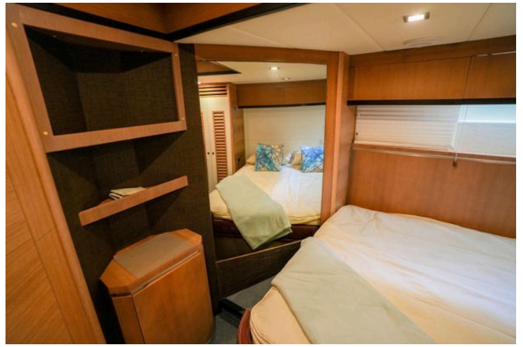
Luxurious cabin interior of 2007 Astondoa 53 Open Cruiser yacht with cozy bedding.