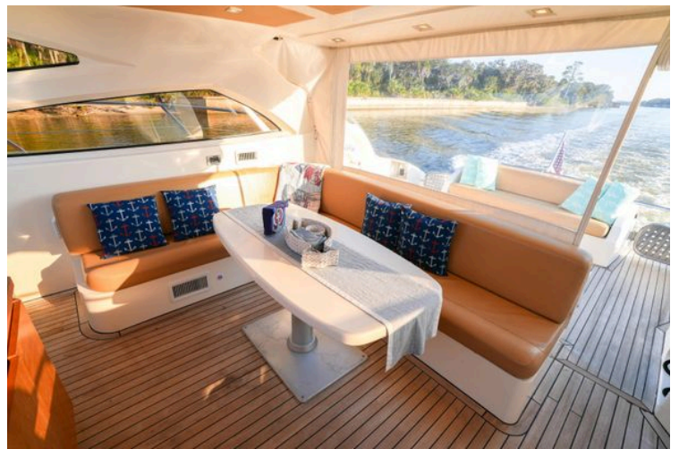
Luxurious 2007 Astondoa 53 Open Cruiser interior with elegant seating and scenic water view.