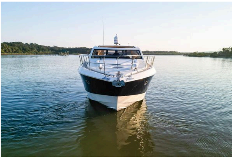
2007 Astondoa 53 Open Cruiser yacht on calm water, front view.