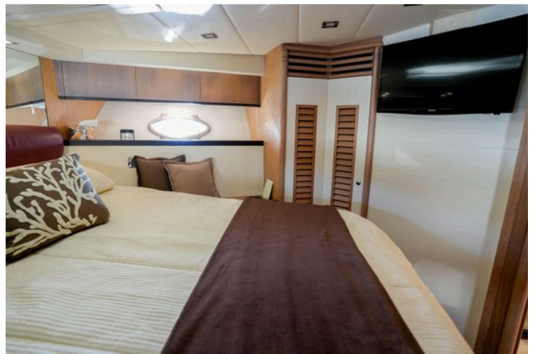
Luxurious cabin interior of 2007 Astondoa 53 Open Cruiser with elegant bedding and modern amenities.