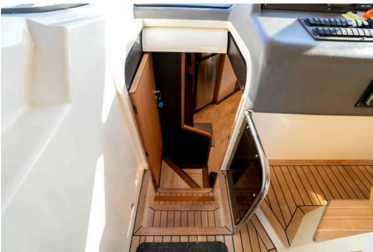
Interior view of 2007 Astondoa 53 Open Cruiser, featuring wooden steps and cabin entrance.