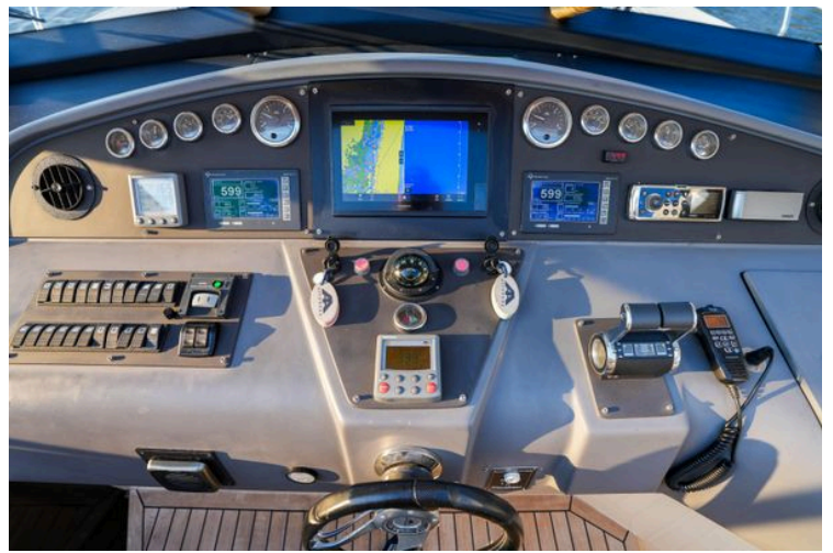
Control panel of a 2007 Astondoa 53 Open Cruiser with navigation and communication equipment.