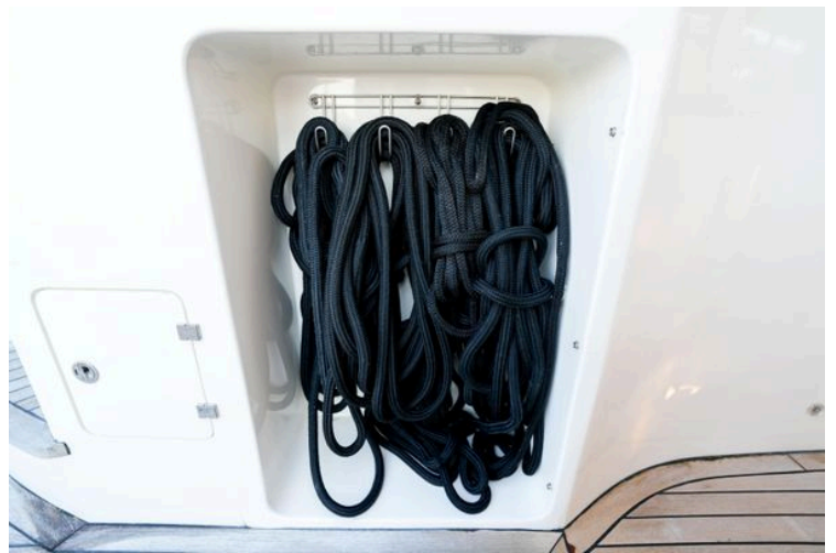
Storage compartment with coiled black ropes on a 2007 Astondoa 53 Open Cruiser yacht.