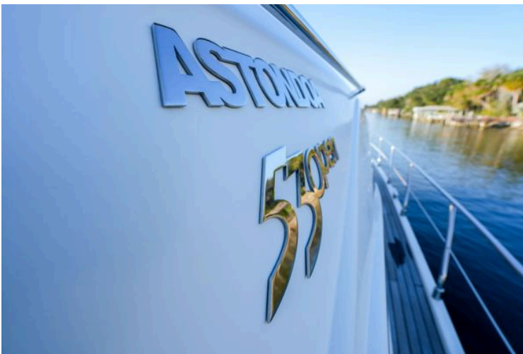
Astondoa 53 Open Cruiser yacht, 2007 model, docked by a scenic waterfront.