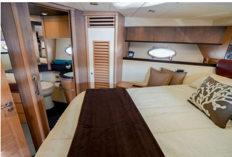
Luxurious cabin interior of 2007 Astondoa 53 Open Cruiser yacht, featuring elegant wood finishes.