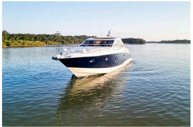
2007 Astondoa 53 Open Cruiser yacht on calm water, surrounded by lush greenery.