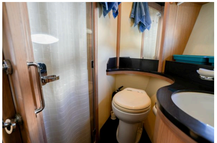
Bathroom interior of 2007 Astondoa 53 Open Cruiser yacht, featuring toilet and shower.