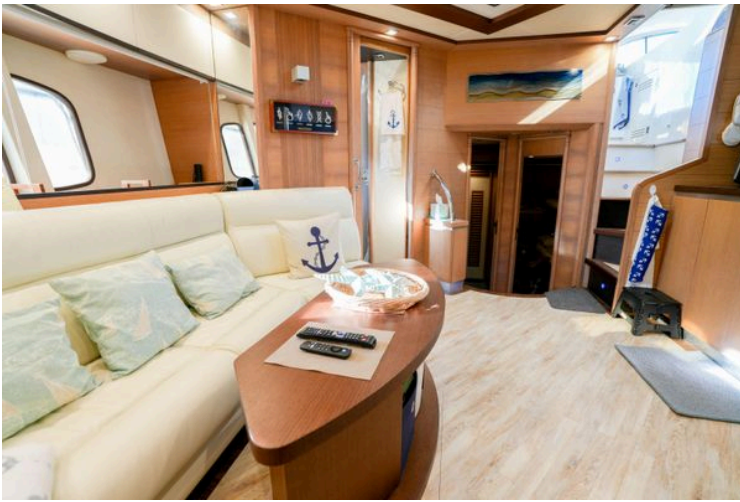
Luxurious interior of 2007 Astondoa 53 Open Cruiser yacht with elegant seating and nautical decor.