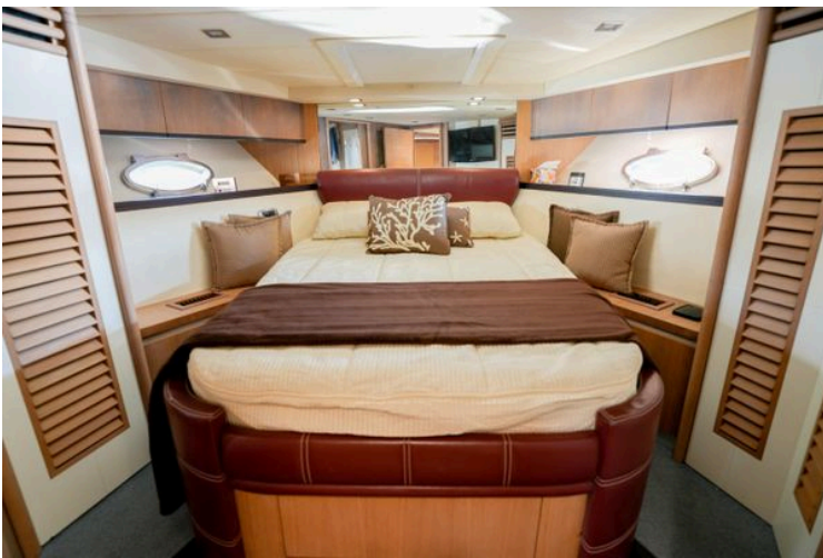
Luxurious cabin interior of 2007 Astondoa 53 Open Cruiser yacht with elegant bedding.