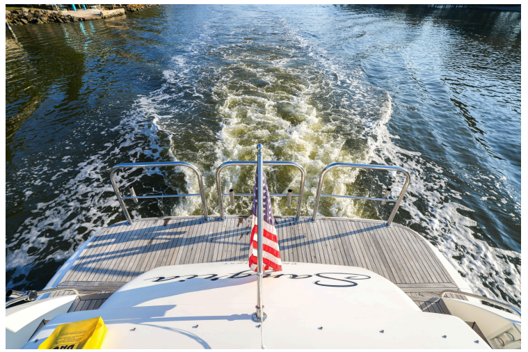
Astondoa 53 Open Cruiser 2007, rear view with American flag on water.