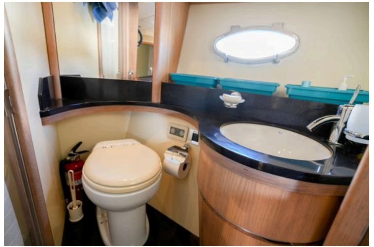
Bathroom interior of 2007 Astondoa 53 Open Cruiser yacht with sink and toilet.