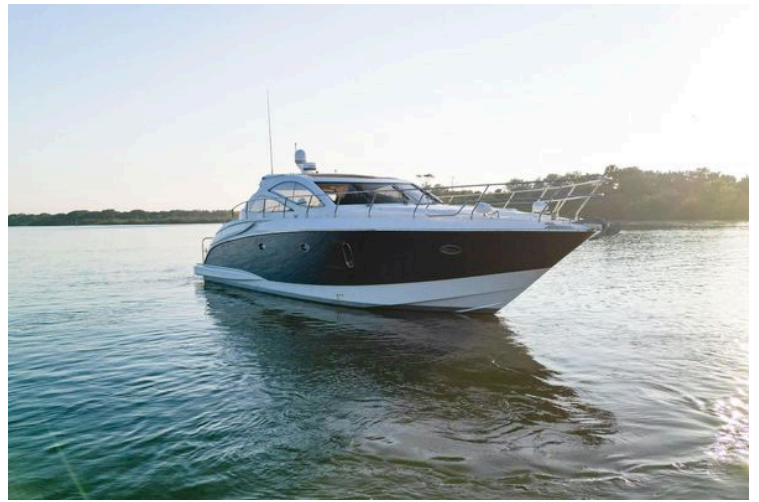
2007 Astondoa 53 Open Cruiser yacht on calm water at sunset.