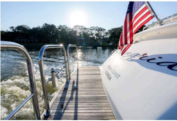
Astondoa 53 Open Cruiser 2007 yacht cruising with American flag, sunny waterside view.