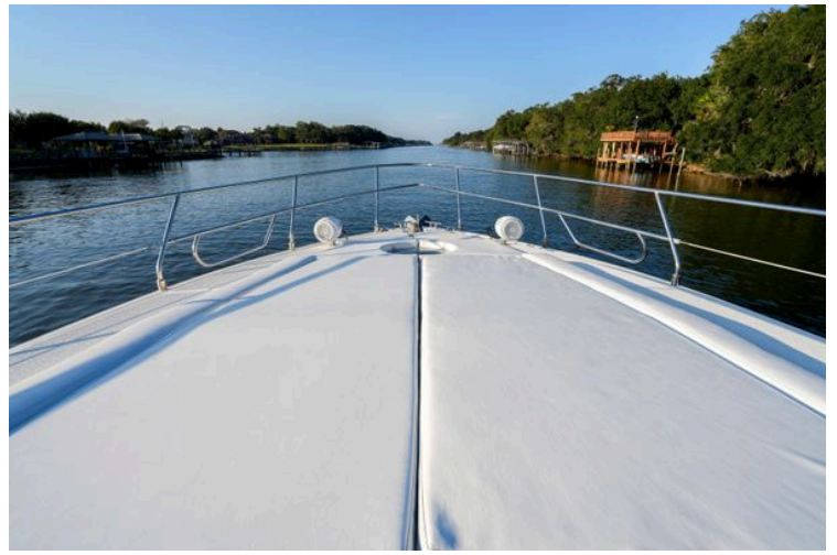
Bow view of 2007 Astondoa 53 Open Cruiser on a serene river.