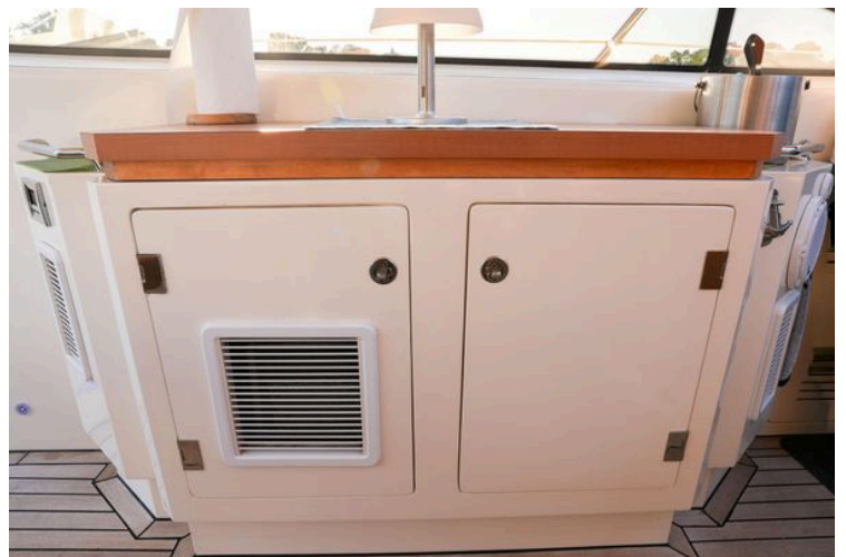
2007 Astondoa 53 Open Cruiser interior with wooden countertop and storage cabinets.