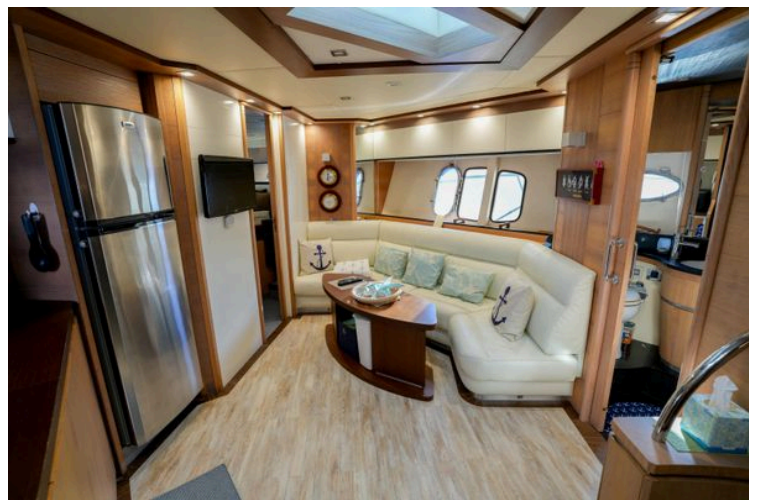
Luxurious interior of 2007 Astondoa 53 Open Cruiser yacht with modern amenities and elegant design.