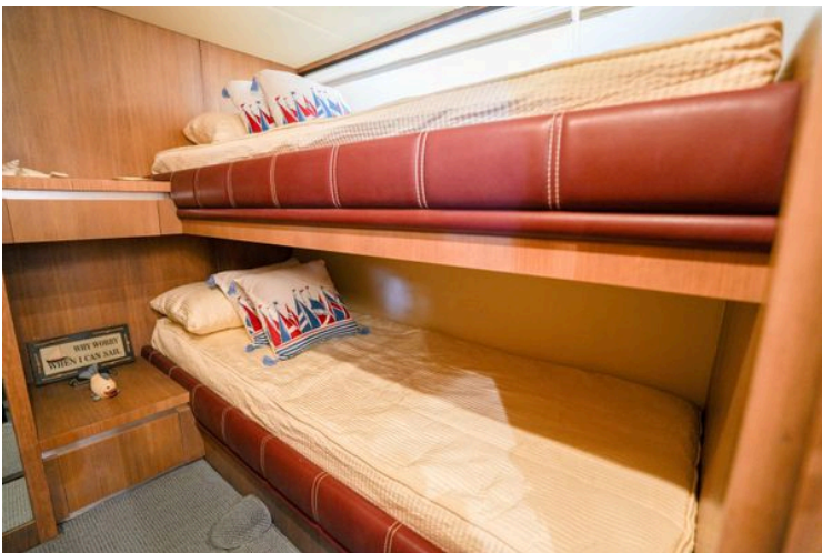
Bunk beds in 2007 Astondoa 53 Open Cruiser cabin with nautical-themed pillows.