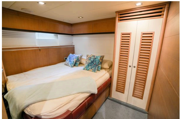
Luxurious bedroom interior of 2007 Astondoa 53 Open Cruiser yacht with cozy bedding.