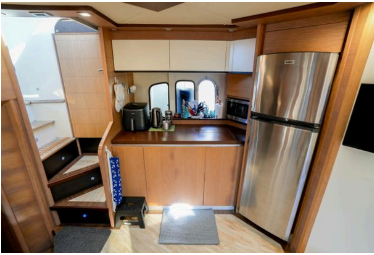
Interior of 2007 Astondoa 53 Open Cruiser with modern kitchen and stainless steel appliances.