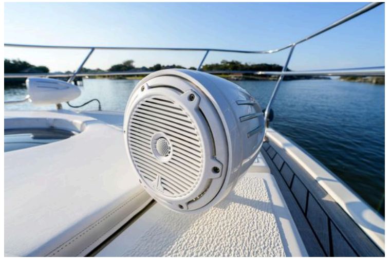
Close-up of a speaker on a 2007 Astondoa 53 Open Cruiser yacht deck.