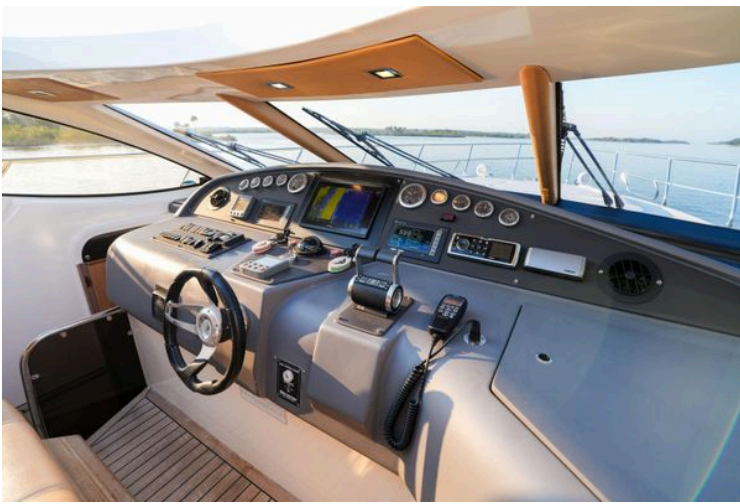
Cockpit of 2007 Astondoa 53 Open Cruiser yacht with navigation instruments and steering wheel.