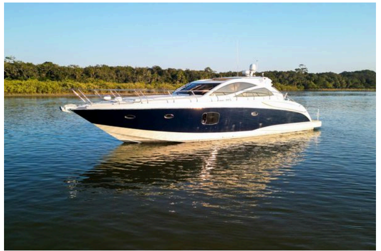
2007 Astondoa 53 Open Cruiser yacht on calm water, surrounded by lush greenery.