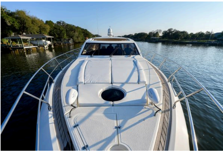
2007 Astondoa 53 Open Cruiser yacht on a serene river, surrounded by lush greenery.