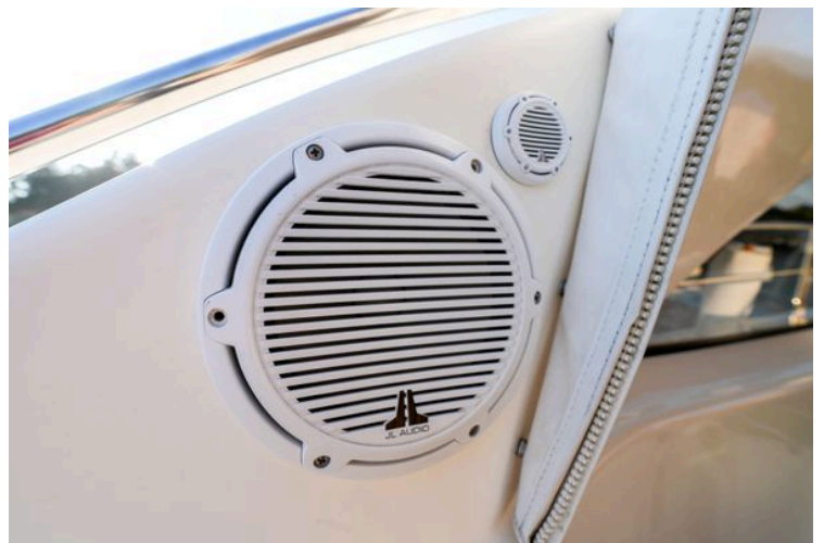
White JL Audio speakers on 2007 Astondoa 53 Open Cruiser yacht interior.