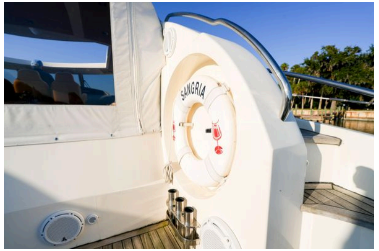
2007 Astondoa 53 Open Cruiser deck with lifebuoy labeled "Sangria."