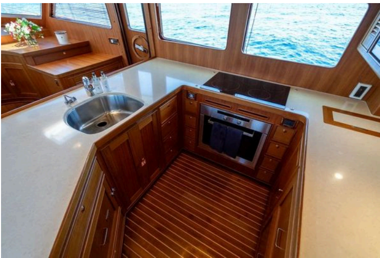
2011 Marlow Explorer - Image 38