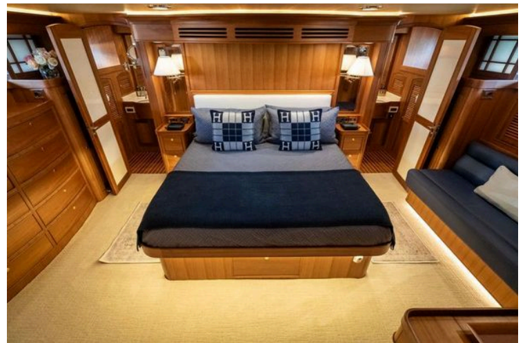
2011 Marlow Explorer - Image 47