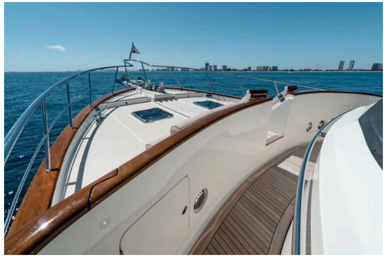
2011 Marlow Explorer - Image 93