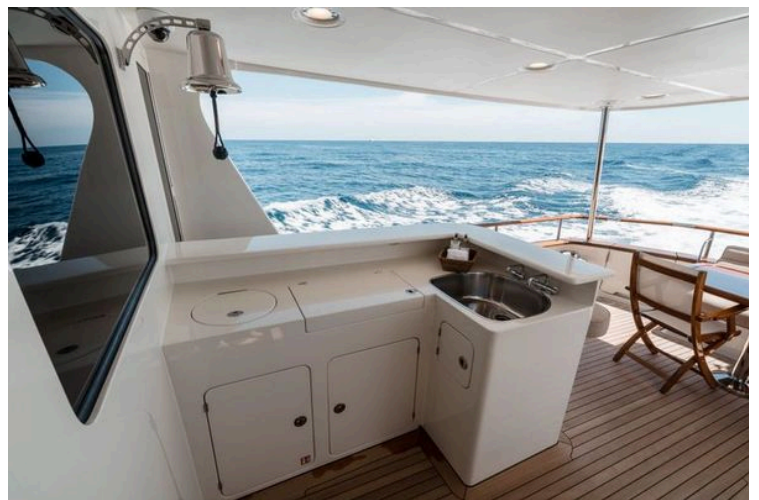
2011 Marlow Explorer - Image 17