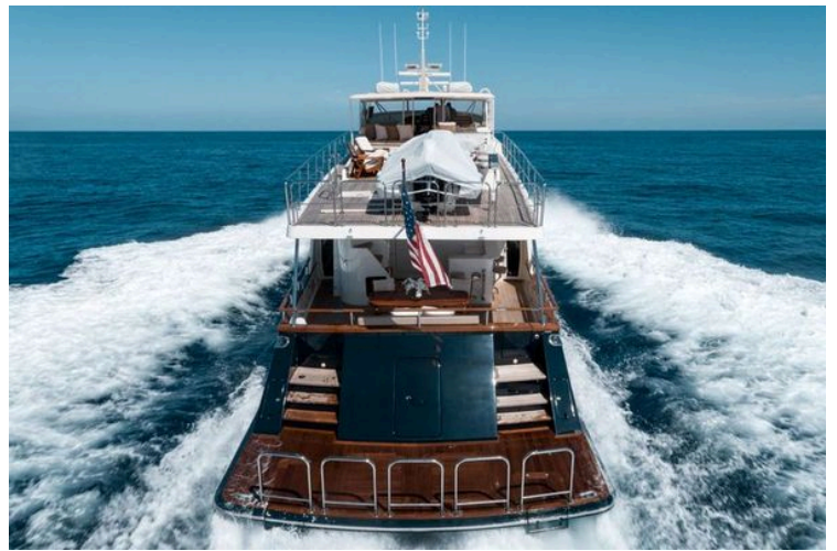
2011 Marlow Explorer - Image 11