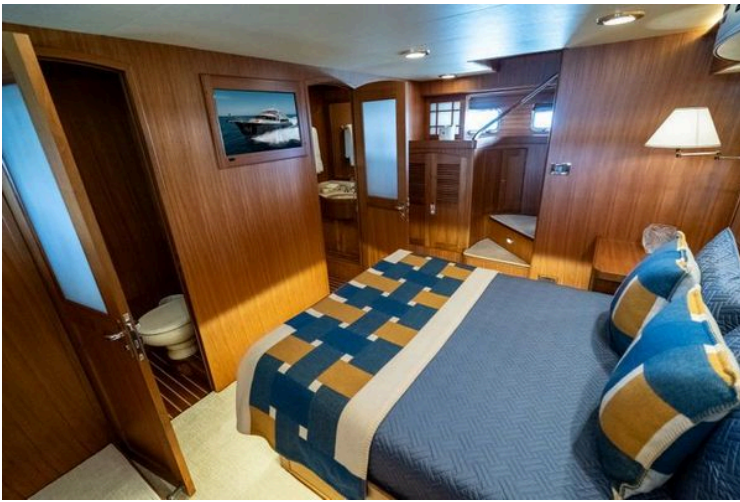
2011 Marlow Explorer - Image 32