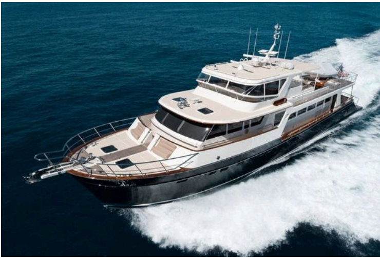
2011 Marlow Explorer - Image 92