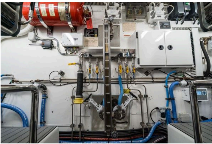
2011 Marlow Explorer - Image 110