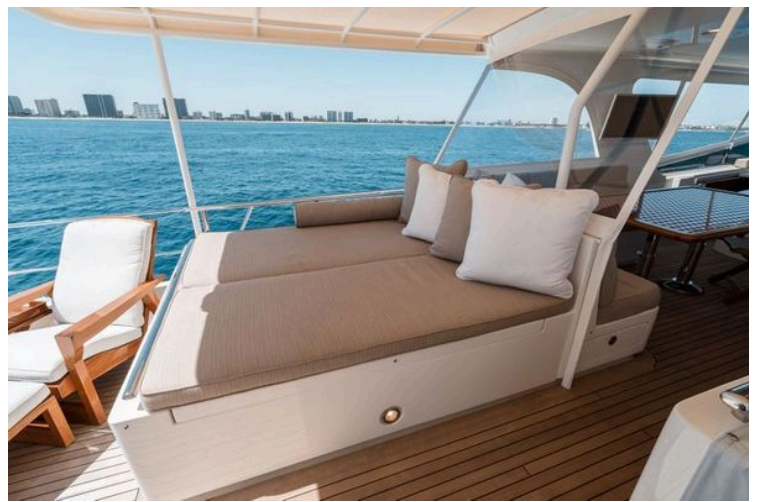
2011 Marlow Explorer - Image 77