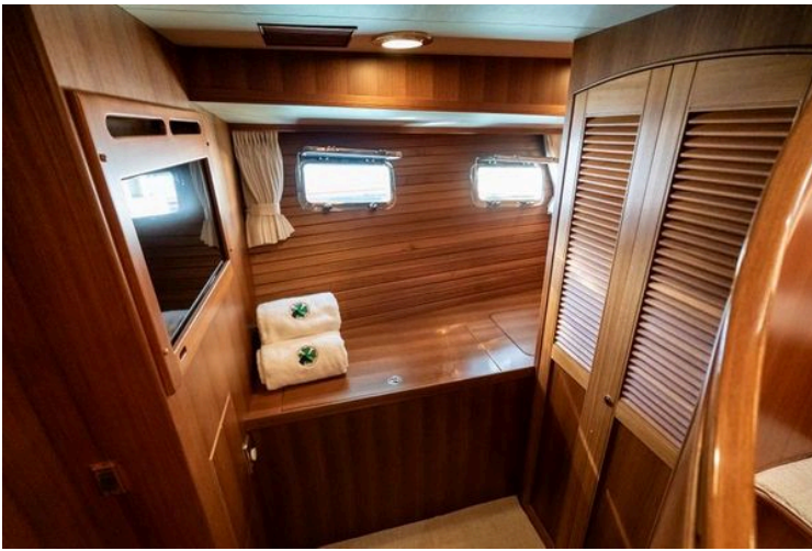
2011 Marlow Explorer - Image 44