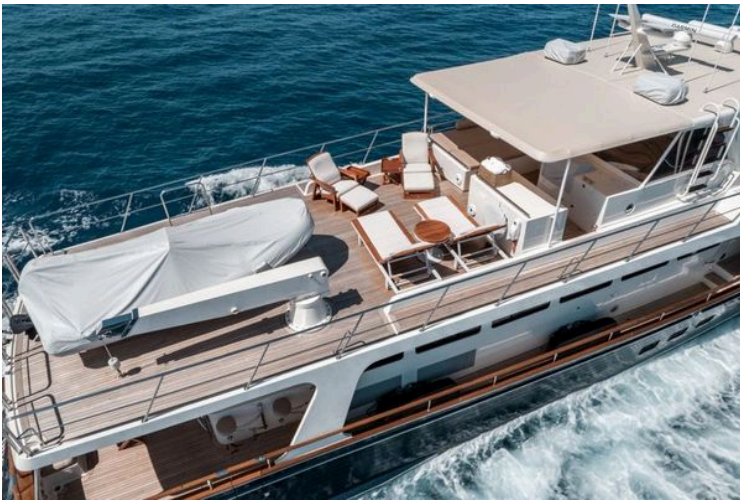
2011 Marlow Explorer - Image 80