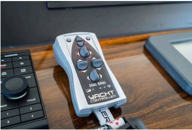
2011 Marlow Explorer - Image 68