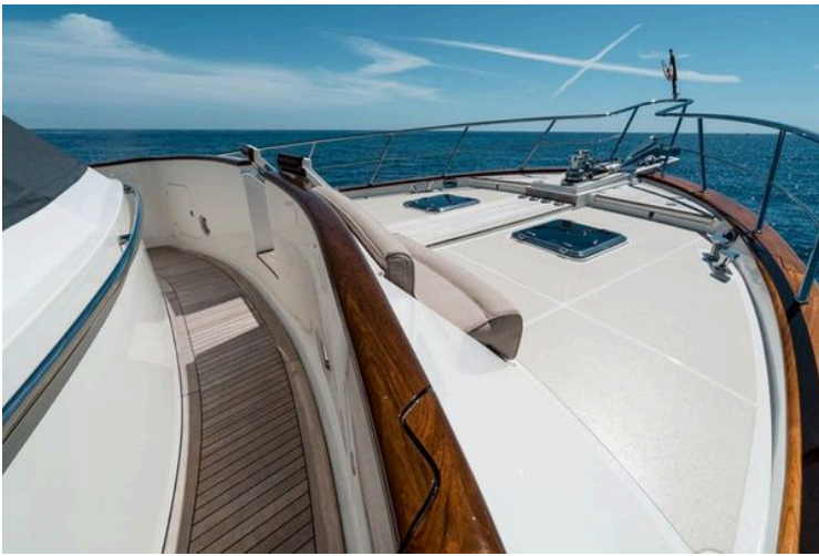
2011 Marlow Explorer - Image 98