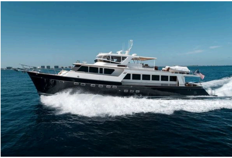
2011 Marlow Explorer - Image 6