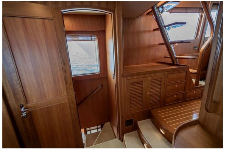
2011 Marlow Explorer - Image 27