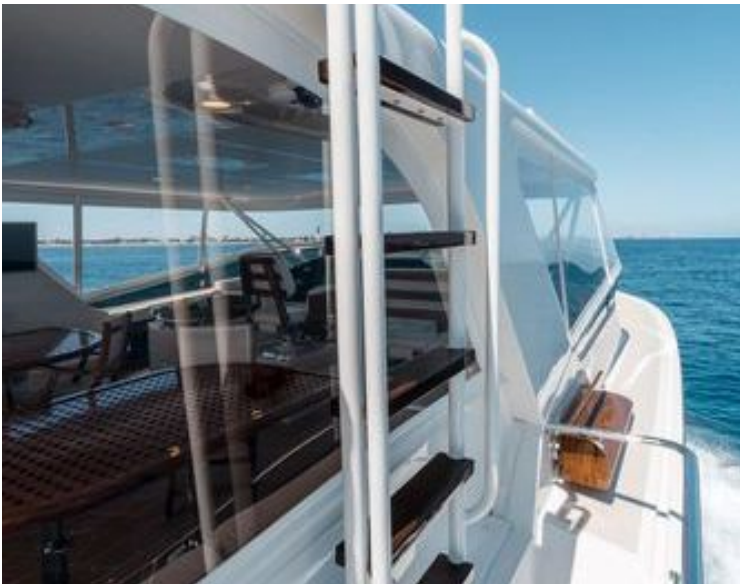
2011 Marlow Explorer - Image 79