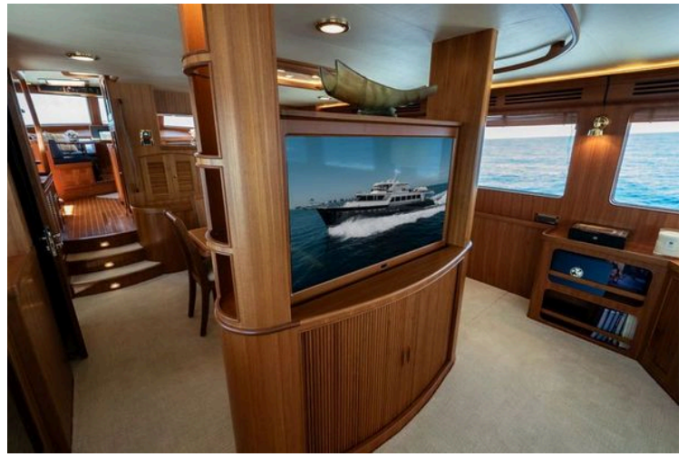
2011 Marlow Explorer - Image 25