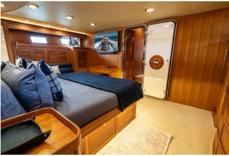
2011 Marlow Explorer - Image 48