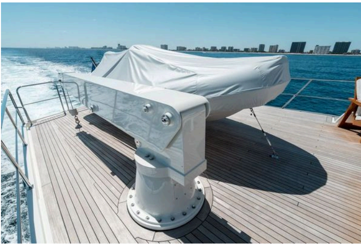
2011 Marlow Explorer - Image 82