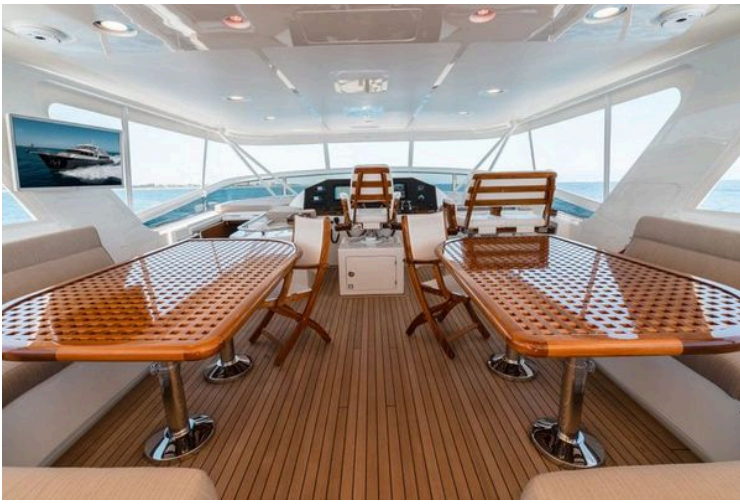
2011 Marlow Explorer - Image 72