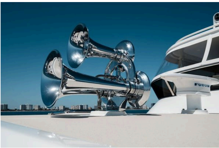
2011 Marlow Explorer - Image 100