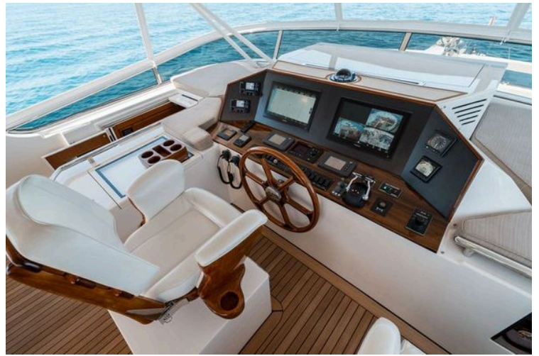
2011 Marlow Explorer - Image 69