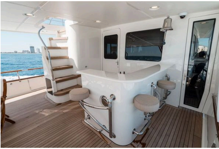
2011 Marlow Explorer - Image 18