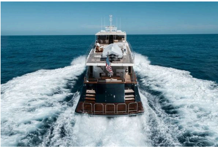
2011 Marlow Explorer - Image 10