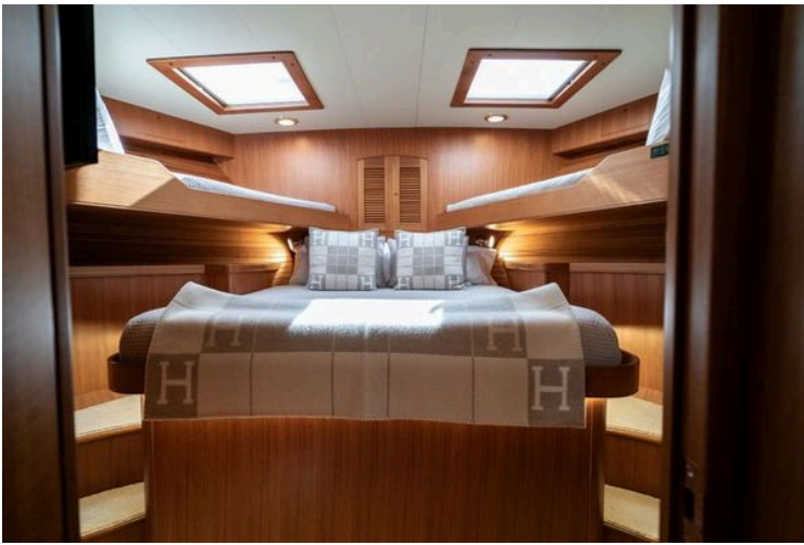
2011 Marlow Explorer - Image 56