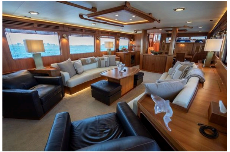
2011 Marlow Explorer - Image 21