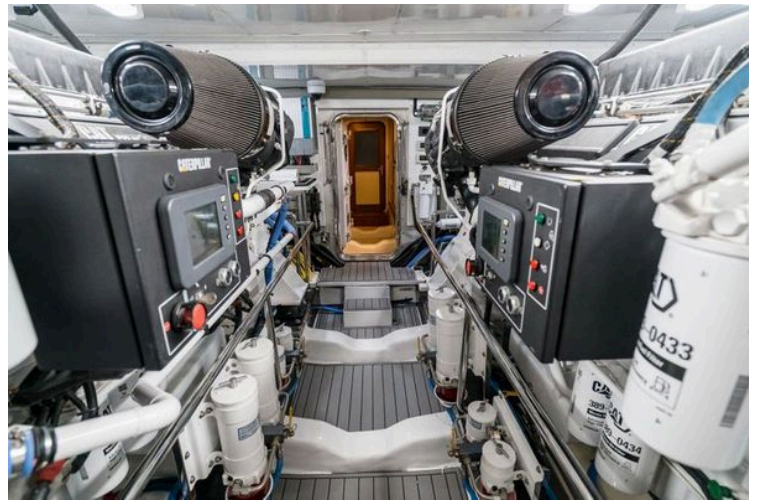
2011 Marlow Explorer - Image 109