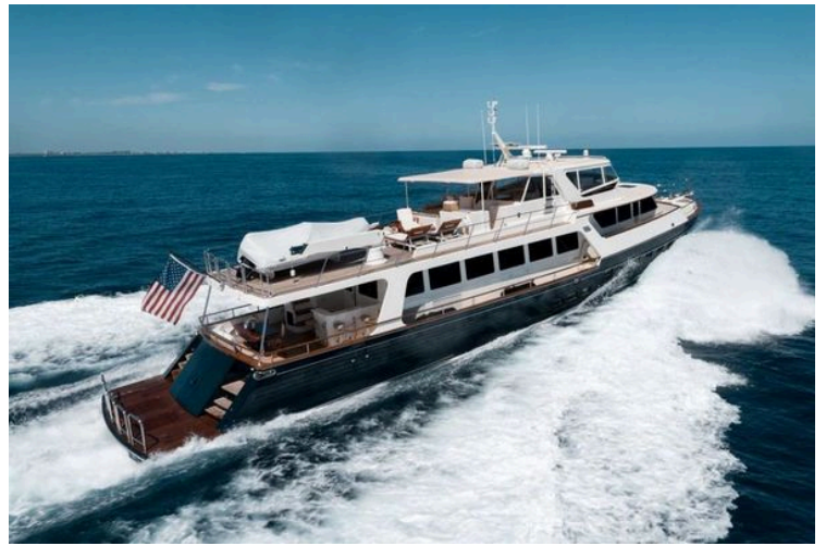
2011 Marlow Explorer - Image 9