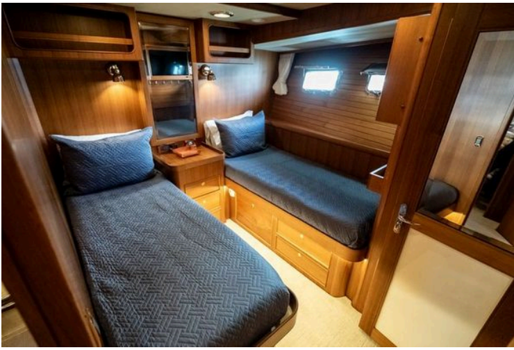
2011 Marlow Explorer - Image 60