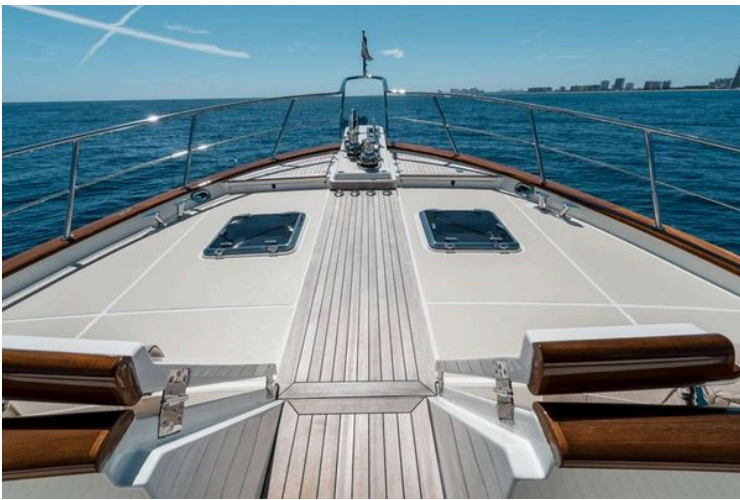
2011 Marlow Explorer - Image 94