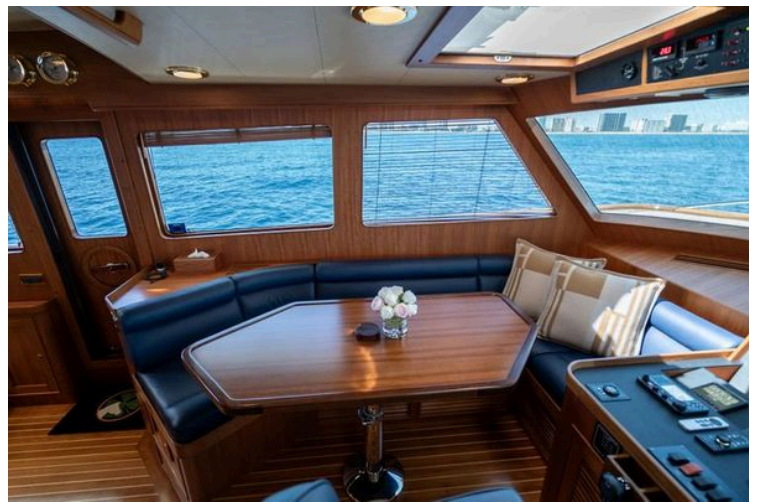
2011 Marlow Explorer - Image 39