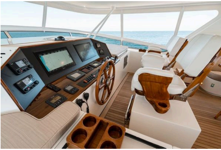
2011 Marlow Explorer - Image 66