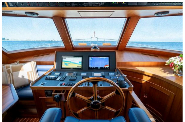
2011 Marlow Explorer - Image 41