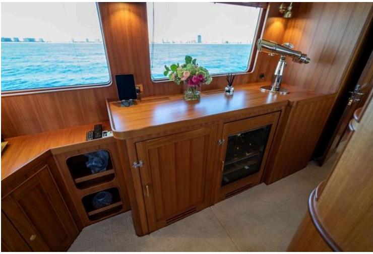
2011 Marlow Explorer - Image 24