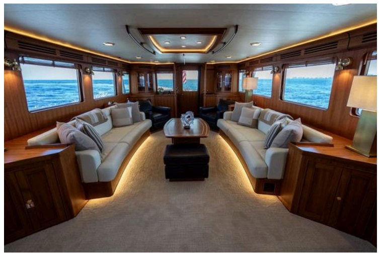
2011 Marlow Explorer - Image 23