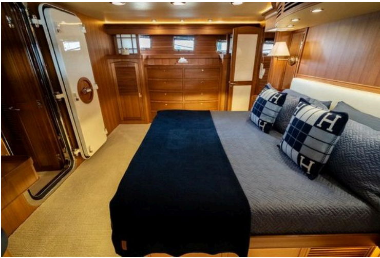
2011 Marlow Explorer - Image 50