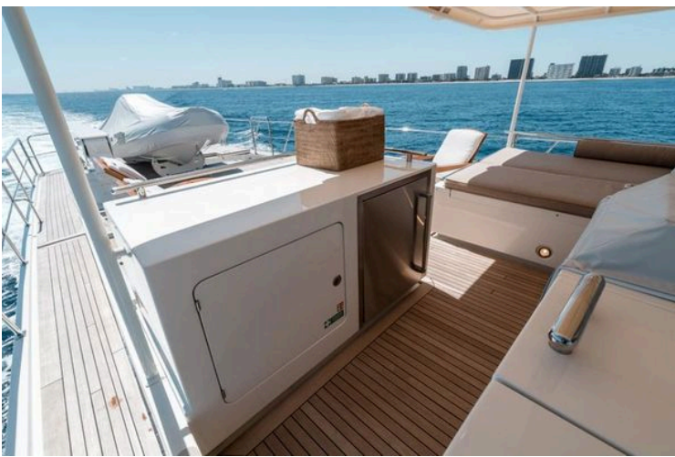
2011 Marlow Explorer - Image 76