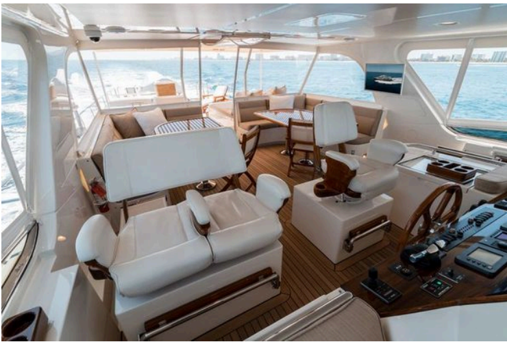
2011 Marlow Explorer - Image 70