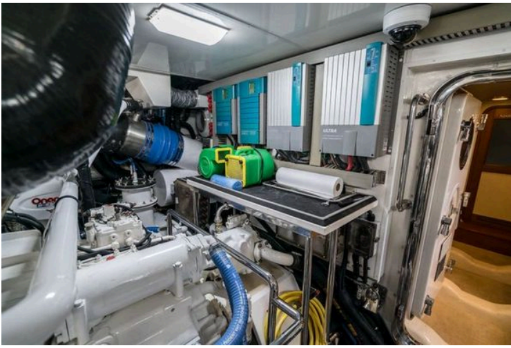
2011 Marlow Explorer - Image 108