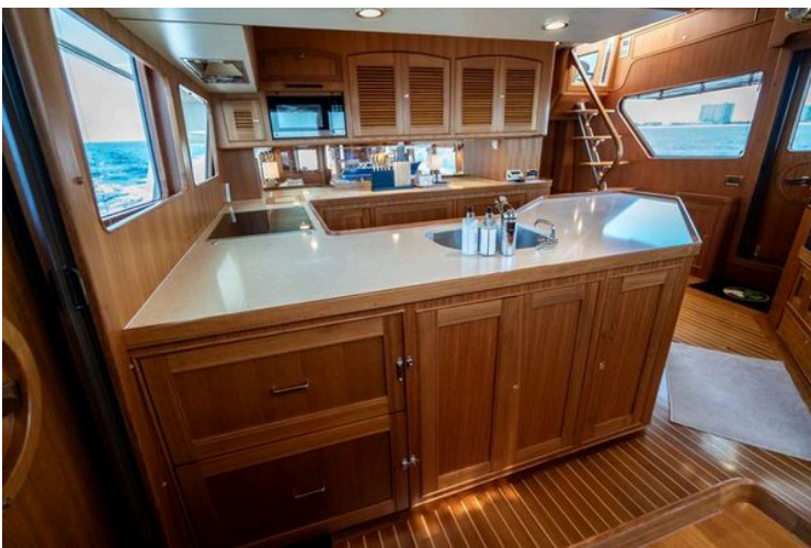
2011 Marlow Explorer - Image 40