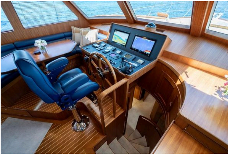
2011 Marlow Explorer - Image 42