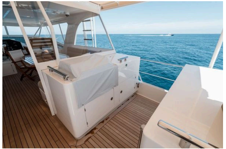
2011 Marlow Explorer - Image 75