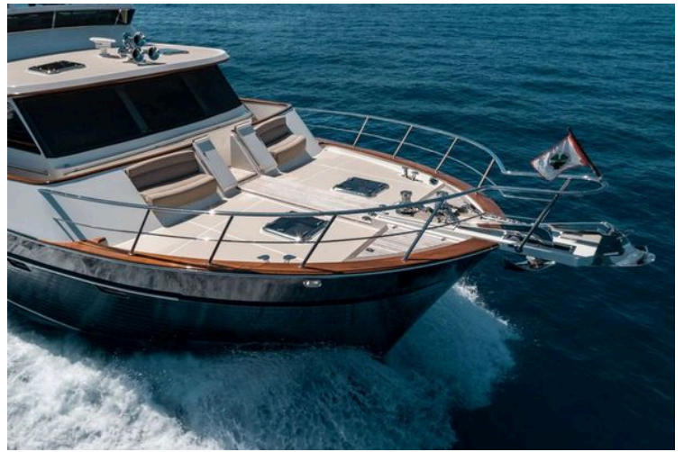
2011 Marlow Explorer - Image 99