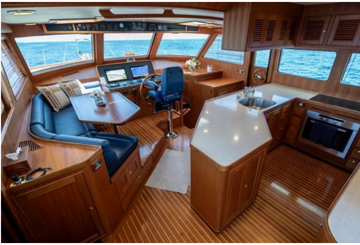
2011 Marlow Explorer - Image 36