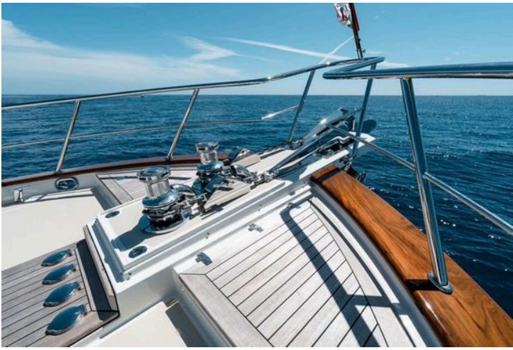
2011 Marlow Explorer - Image 96