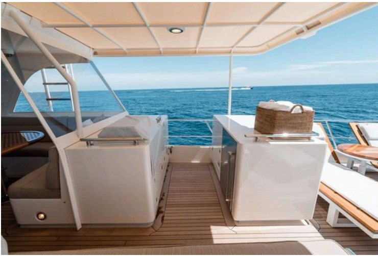
2011 Marlow Explorer - Image 74