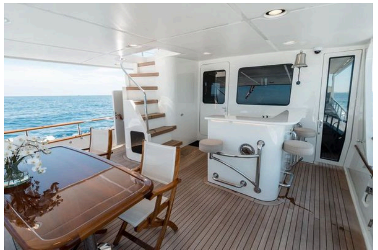
2011 Marlow Explorer - Image 15