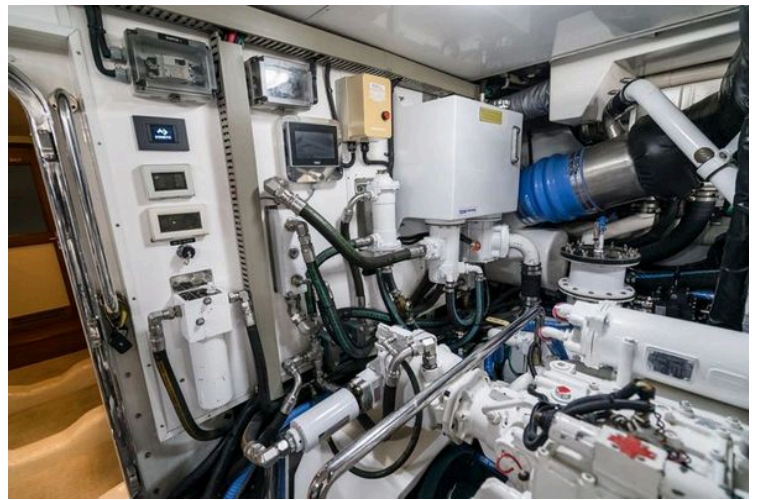
2011 Marlow Explorer - Image 107