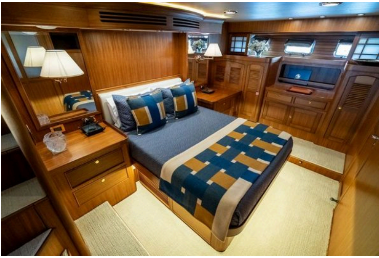
2011 Marlow Explorer - Image 30