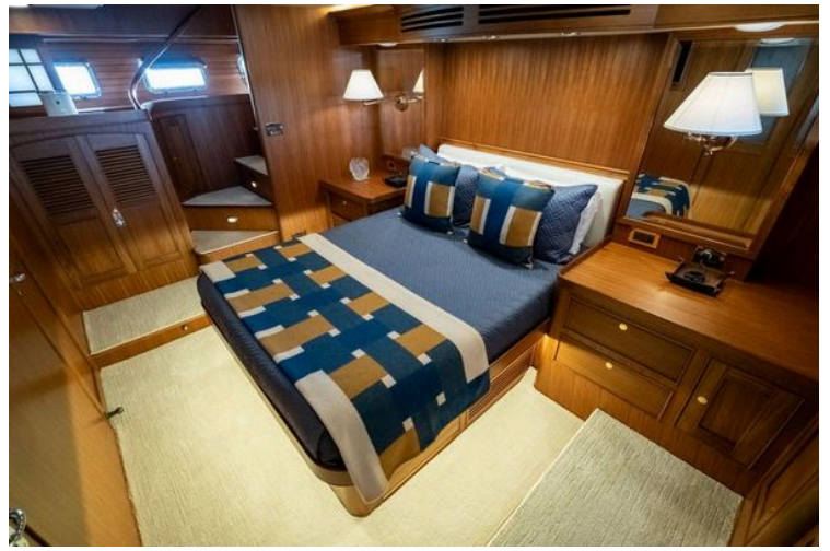
2011 Marlow Explorer - Image 31