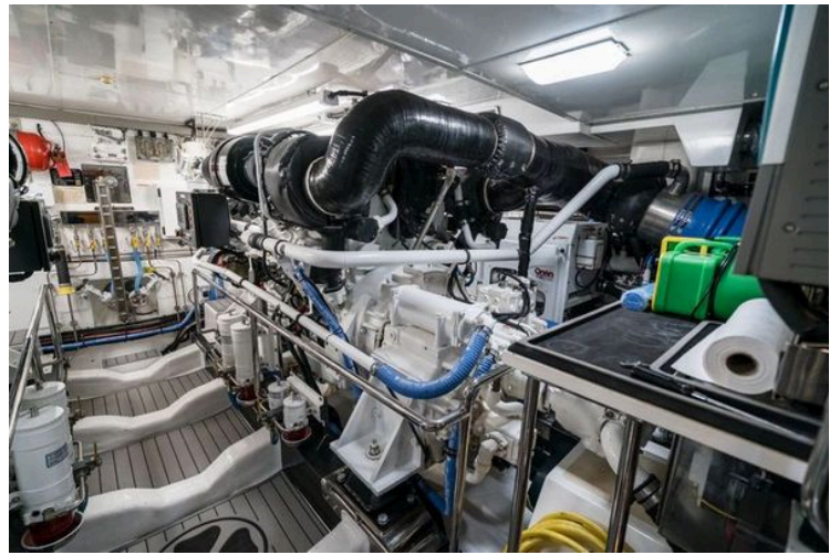
2011 Marlow Explorer - Image 105