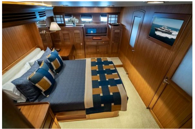
2011 Marlow Explorer - Image 29