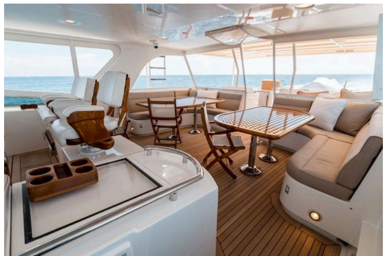
2011 Marlow Explorer - Image 65