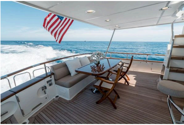
2011 Marlow Explorer - Image 12