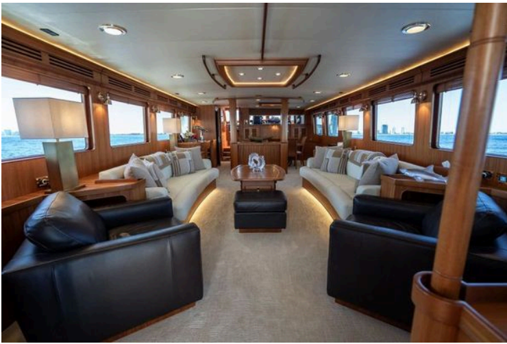
2011 Marlow Explorer - Image 20