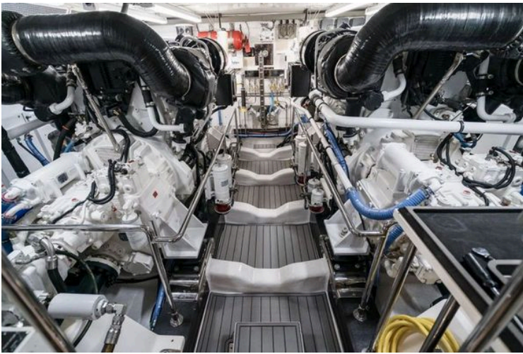
2011 Marlow Explorer - Image 104