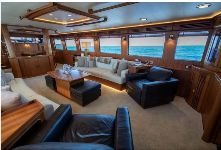
2011 Marlow Explorer - Image 22