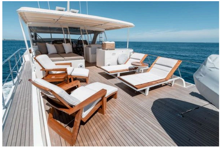
2011 Marlow Explorer - Image 81