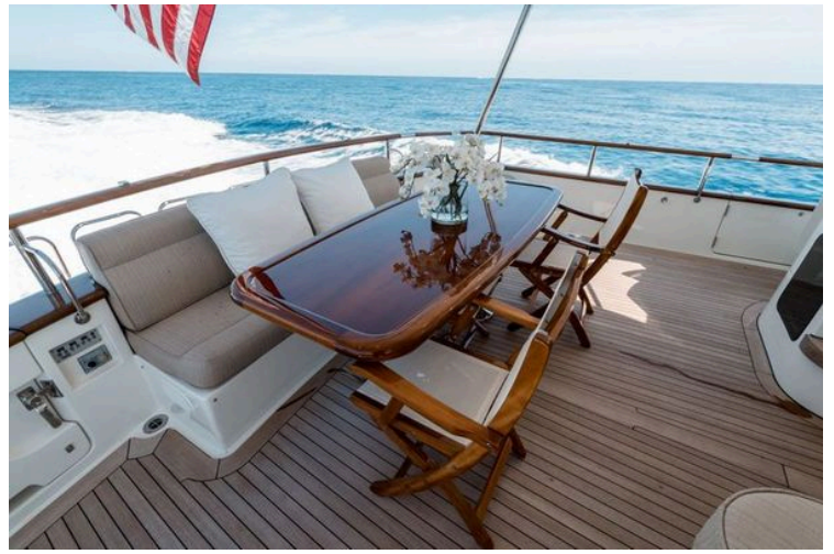
2011 Marlow Explorer - Image 13