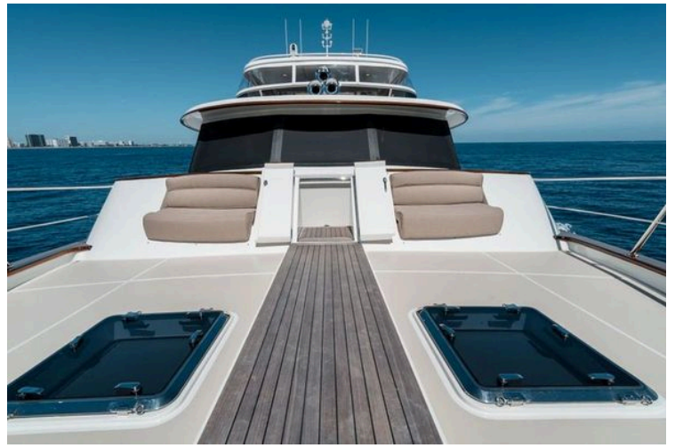
2011 Marlow Explorer - Image 97