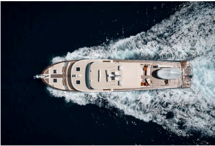
2011 Marlow Explorer - Image 8