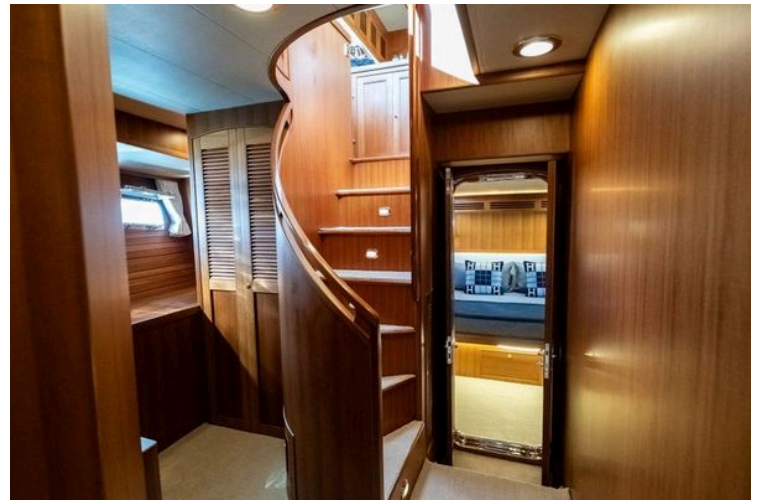
2011 Marlow Explorer - Image 43