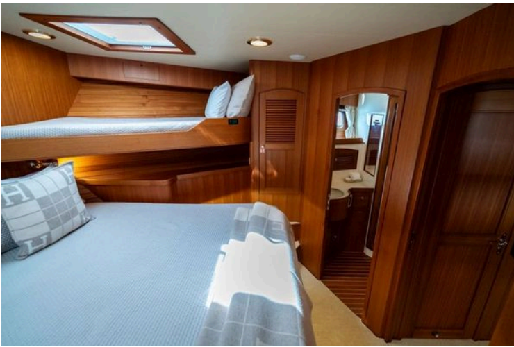
2011 Marlow Explorer - Image 58