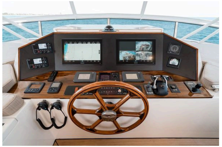
2011 Marlow Explorer - Image 67