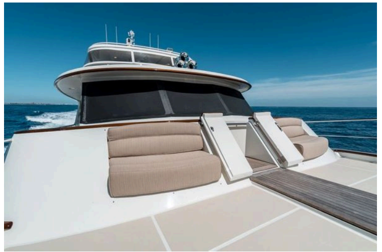
2011 Marlow Explorer - Image 95