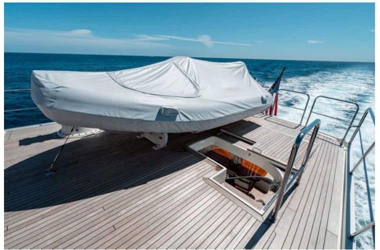
2011 Marlow Explorer - Image 83