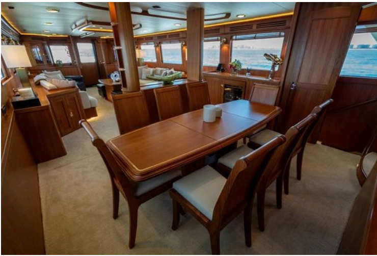
2011 Marlow Explorer - Image 26