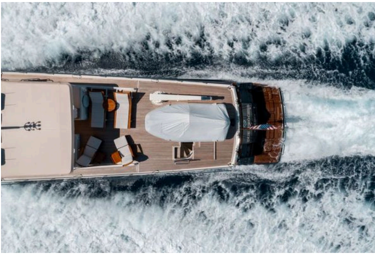
2011 Marlow Explorer - Image 84