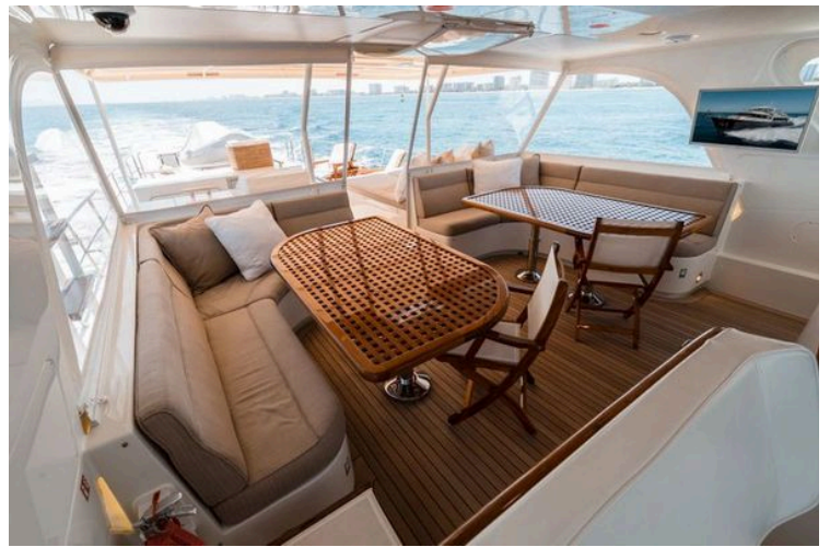
2011 Marlow Explorer - Image 71