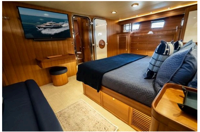
2011 Marlow Explorer - Image 51