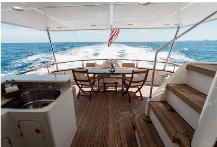
2011 Marlow Explorer - Image 16