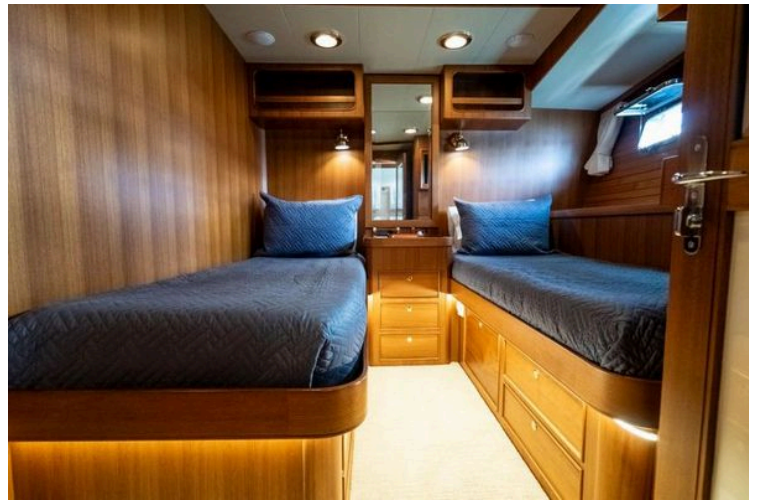
2011 Marlow Explorer - Image 61