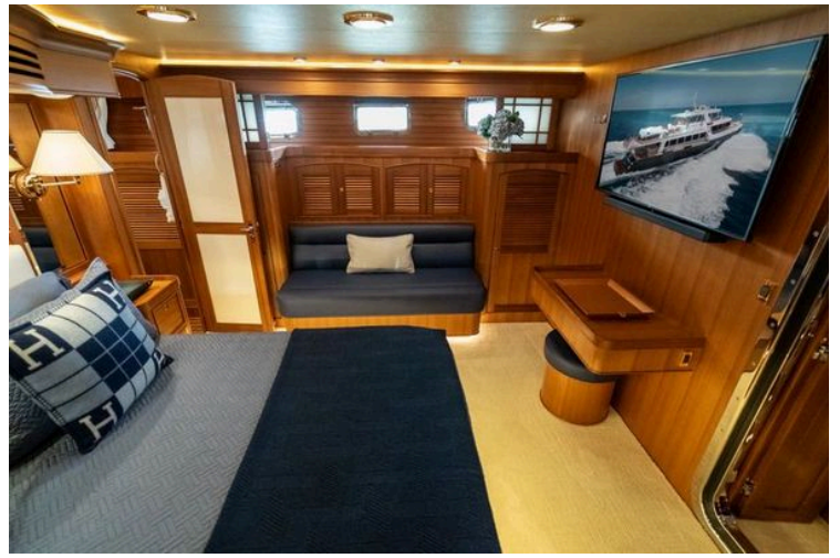
2011 Marlow Explorer - Image 49