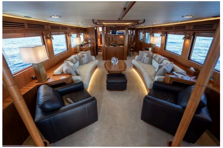
2011 Marlow Explorer - Image 19