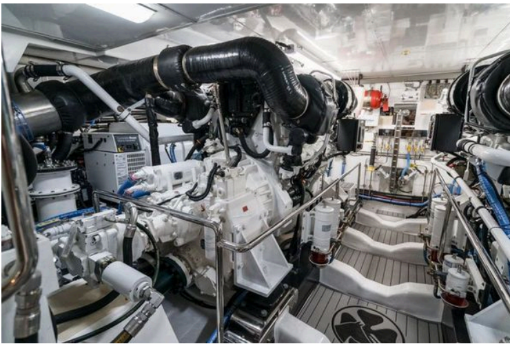
2011 Marlow Explorer - Image 106