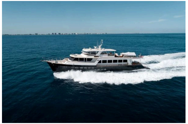
2011 Marlow Explorer - Image 7