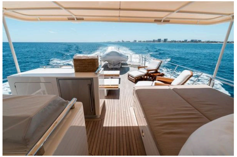
2011 Marlow Explorer - Image 73