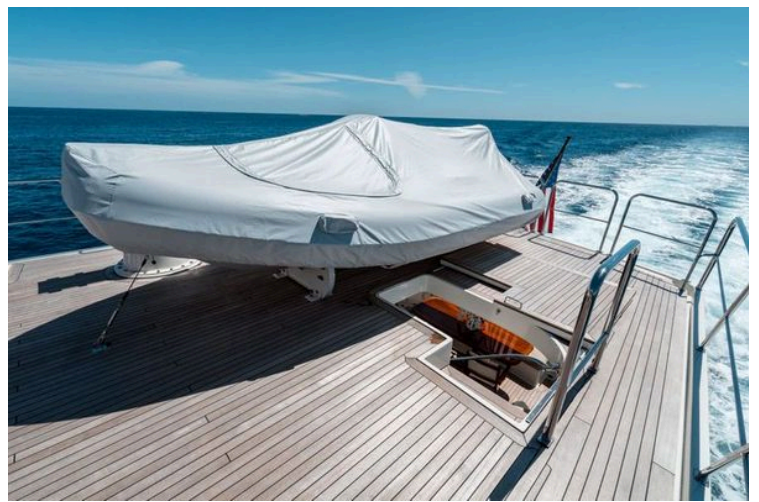
2011 Marlow Explorer - Image 83