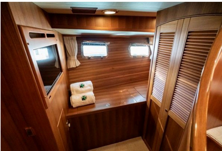
2011 Marlow Explorer - Image 44