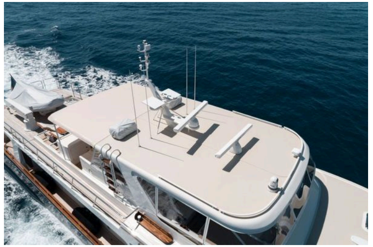
2011 Marlow Explorer - Image 79