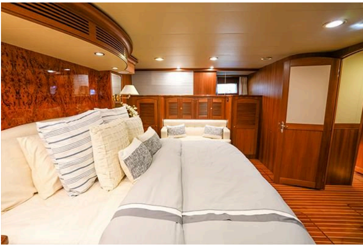
Luxurious cabin interior of 2015 Marlow 80E-CB yacht with elegant wood finishes and cozy bedding.