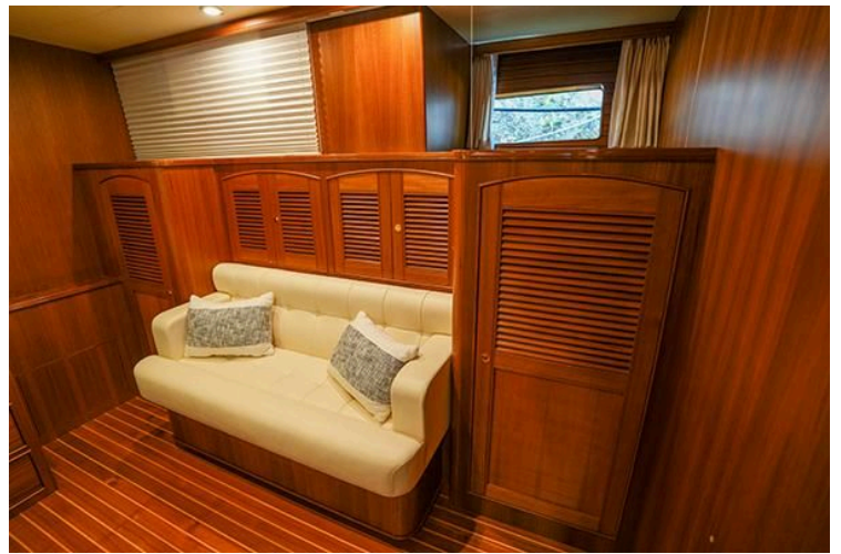
Luxurious Marlow 80E-CB 2015 yacht interior with wooden paneling and cozy seating.