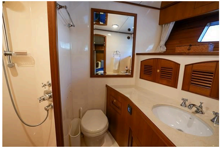
Luxurious Marlow 80E-CB 2015 yacht bathroom with wooden cabinetry and modern fixtures.