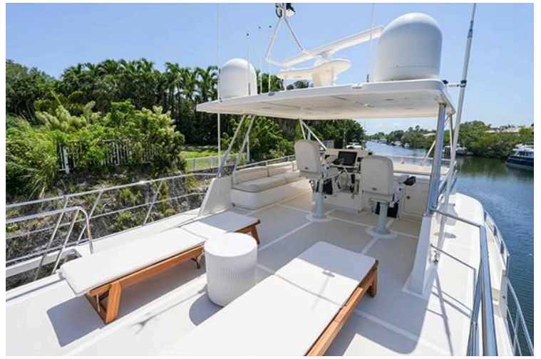
Luxury Marlow 80E-CB yacht deck with seating, 2015 model, surrounded by lush greenery.