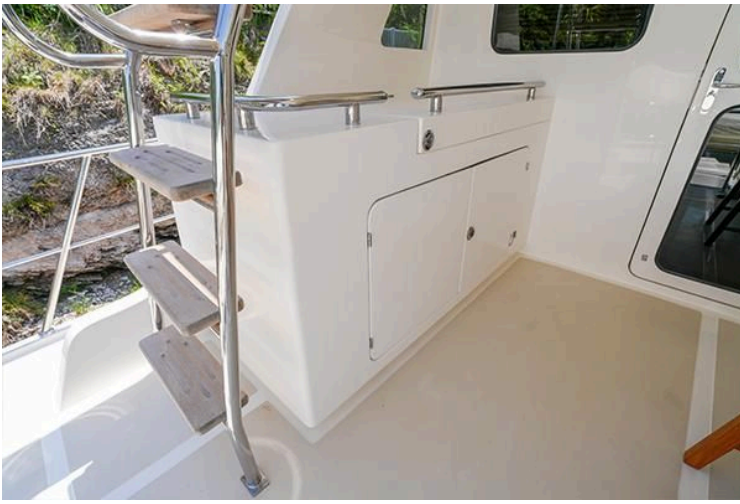
Staircase and storage area on 2015 Marlow 80E-CB yacht deck.