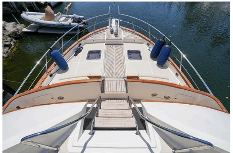
Luxury Marlow 80E-CB yacht deck, 2015 model, with wooden walkway and blue fenders.