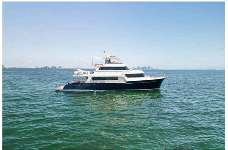
Luxury yacht Marlow 80E-CB 2015 cruising on open water under clear skies.