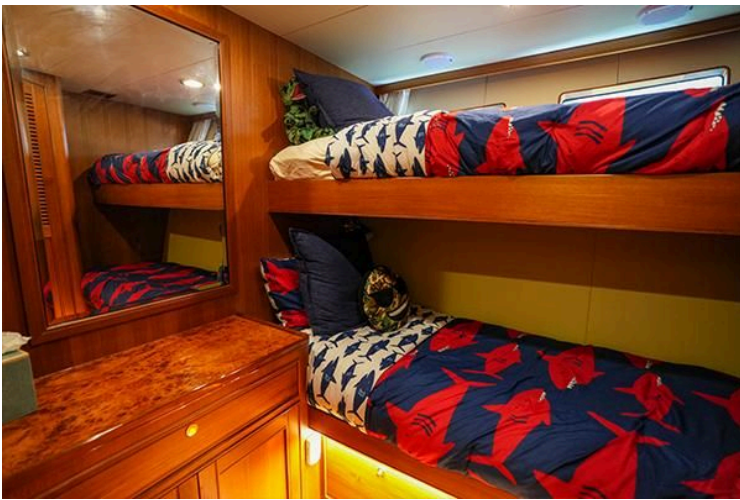
Bunk beds with colorful bedding in a 2015 Marlow 80E-CB yacht cabin.