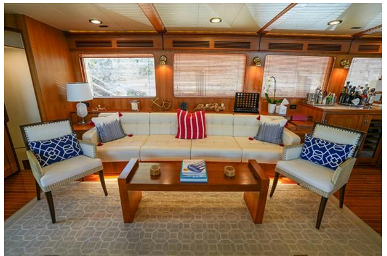
Luxurious Marlow 80E-CB yacht interior with elegant seating and decor, 2015 model.