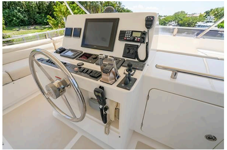
Helm station of 2015 Marlow 80E-CB yacht with navigation controls and steering wheel.