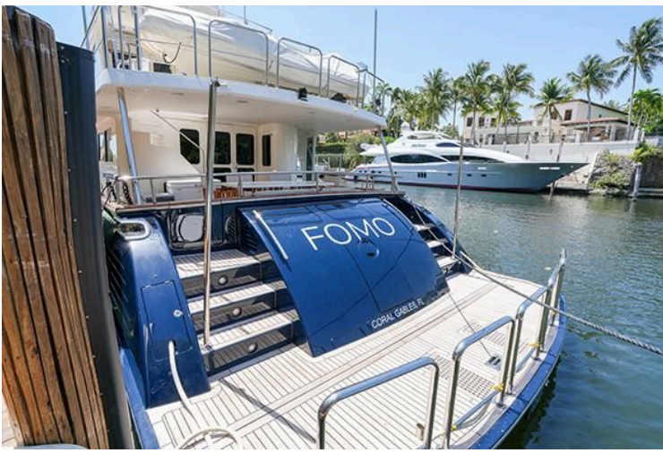
Luxury yacht Marlow 80E-CB, 2015 model, docked in a sunny marina setting.