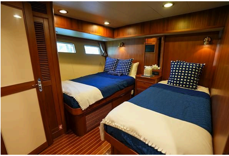
Luxurious twin cabin on 2015 Marlow 80E-CB yacht with blue bedding and wood paneling.