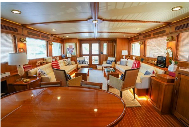
Luxurious interior of 2015 Marlow 80E-CB yacht with elegant seating and wooden finishes.