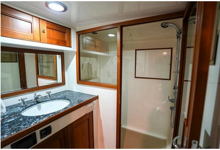
Luxurious Marlow 80E-CB 2015 yacht bathroom with wood accents and modern fixtures.