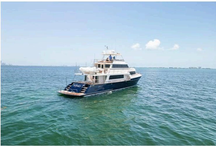
Luxurious 2015 Marlow 80E-CB yacht cruising on open sea under clear blue sky.