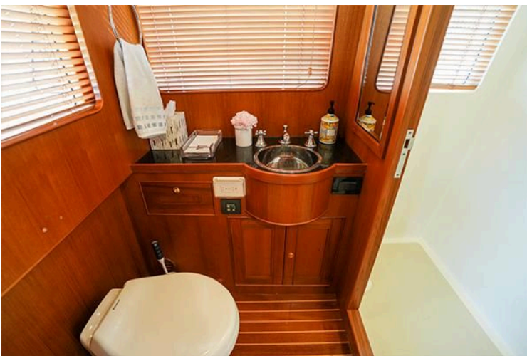
Luxurious Marlow 80E-CB 2015 yacht bathroom with wooden cabinetry and modern fixtures.