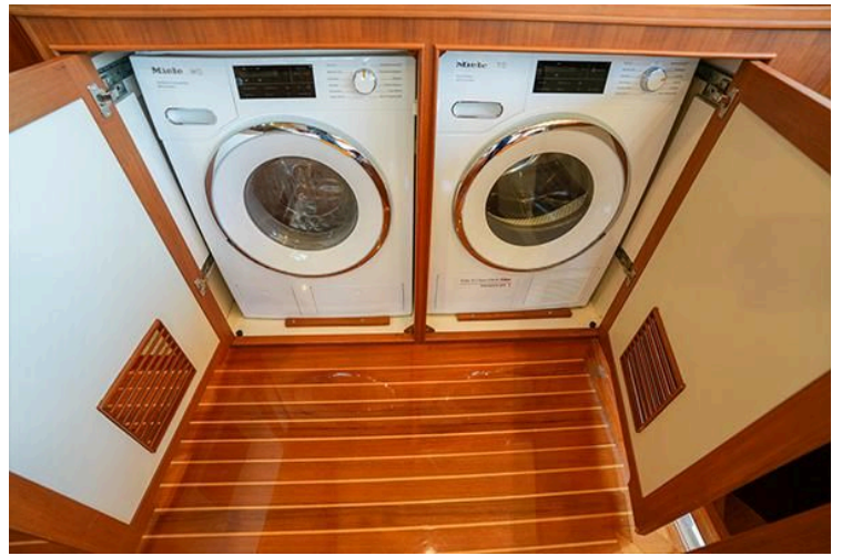
Built-in washer and dryer on Marlow 80E-CB yacht, 2015 model, with wooden cabinetry.