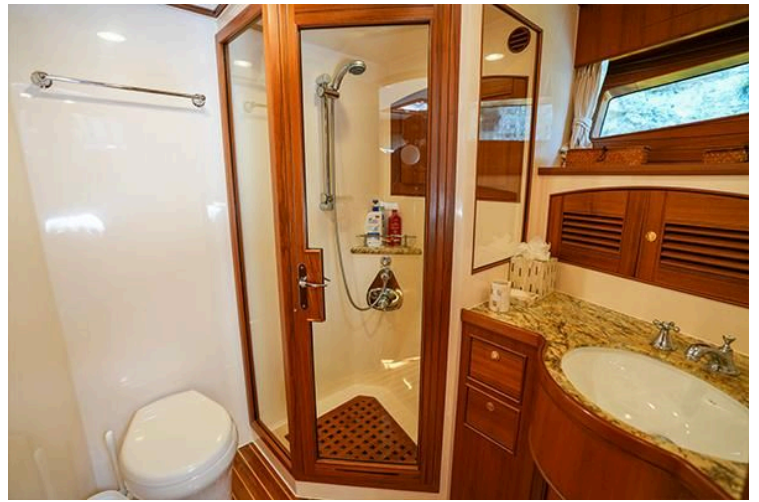
Luxurious Marlow 80E-CB 2015 yacht bathroom with wood accents and modern amenities.