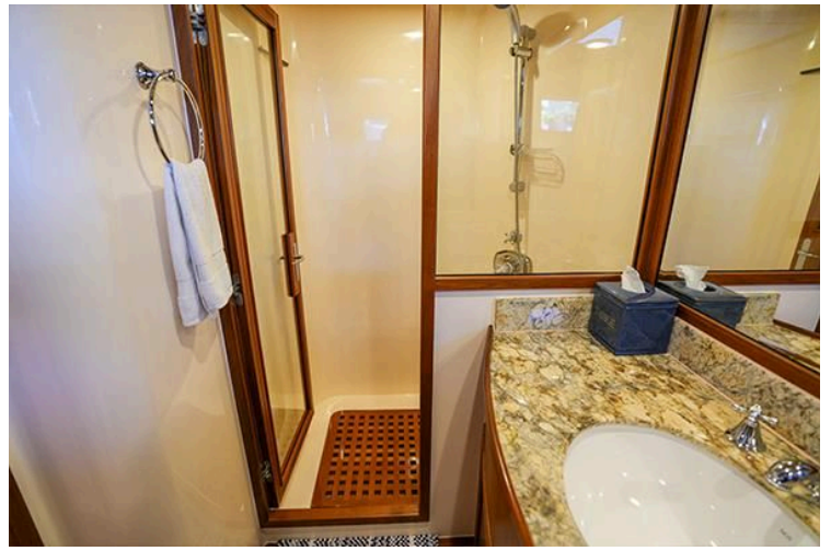
Luxurious bathroom in 2015 Marlow 80E-CB yacht with granite countertop and glass shower.