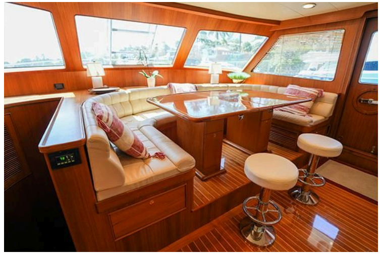
Luxurious interior of 2015 Marlow 80E-CB yacht with elegant seating and wooden finishes.