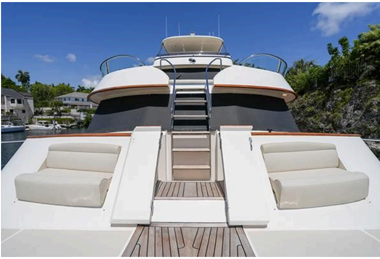
Luxury Marlow 80E-CB yacht, 2015 model, featuring elegant deck seating and sleek design.