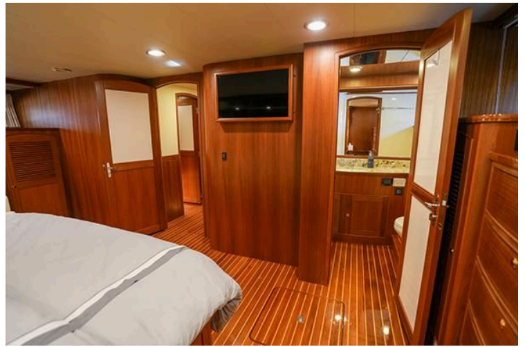
Luxurious cabin interior of 2015 Marlow 80E-CB yacht with wood paneling and modern amenities.