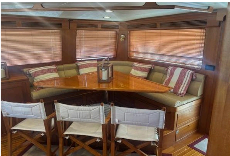
Luxurious Marlow 80E-CB 2015 yacht interior with wooden dining area and cushioned seating.