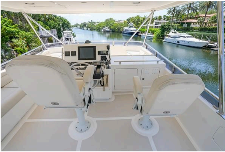
Flybridge of 2015 Marlow 80E-CB yacht with dual helm seats and scenic waterway view.