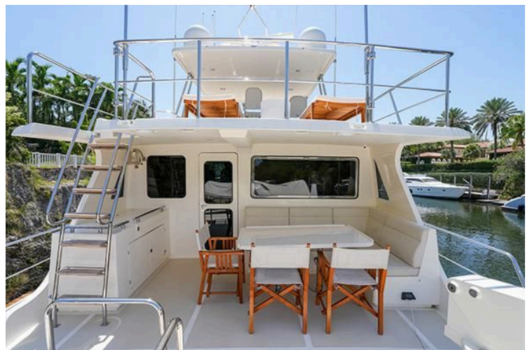
Luxury Marlow 80E-CB yacht deck with seating, table, and ladder, docked by palm trees.