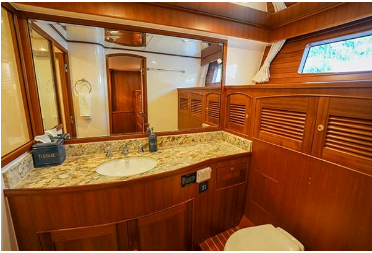
Luxurious Marlow 80E-CB 2015 yacht bathroom with wooden cabinetry and granite countertop.