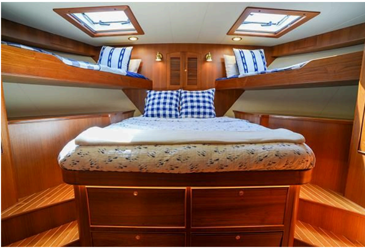
Luxurious cabin interior of 2015 Marlow 80E-CB yacht with wooden finish and cozy bedding.