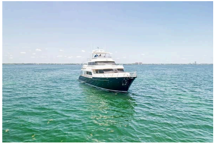
Luxurious 2015 Marlow 80E-CB yacht cruising on clear blue waters.