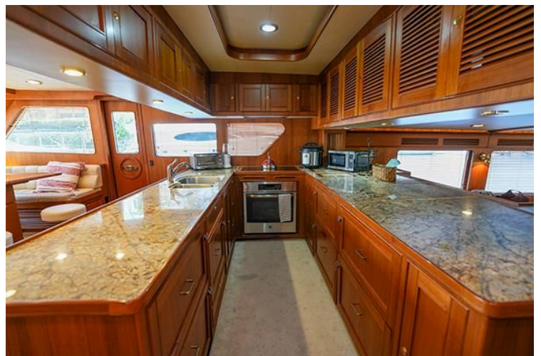
Luxurious Marlow 80E-CB 2015 yacht kitchen with granite countertops and wooden cabinetry.