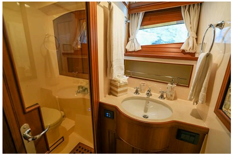
Luxurious Marlow 80E-CB 2015 yacht bathroom with wooden accents and modern fixtures.