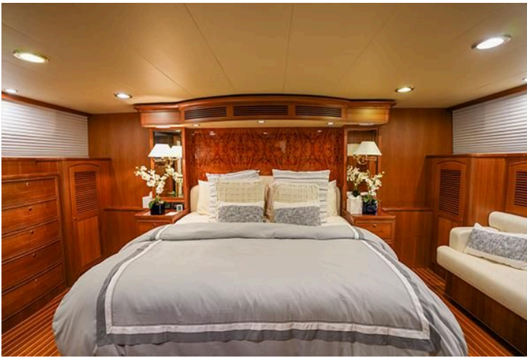
Luxurious bedroom interior on 2015 Marlow 80E-CB yacht with elegant wood paneling.