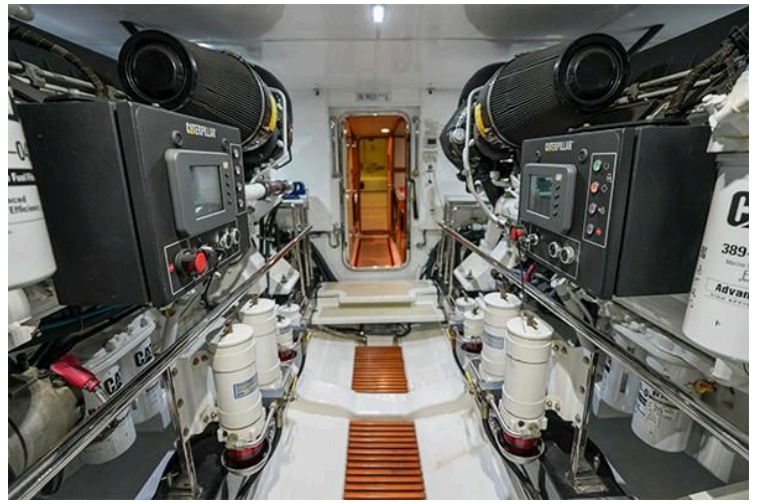
Engine room of 2015 Marlow 80E-CB yacht, featuring advanced Caterpillar machinery and equipment.