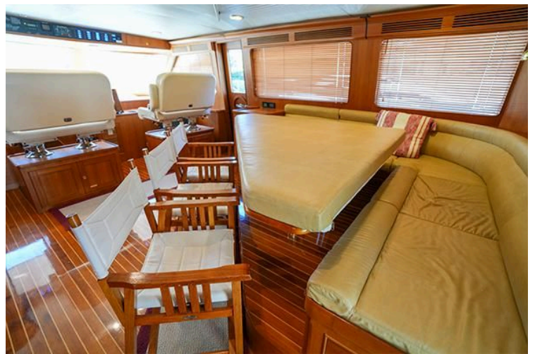
Luxurious interior of 2015 Marlow 80E-CB yacht with elegant seating and wooden flooring.