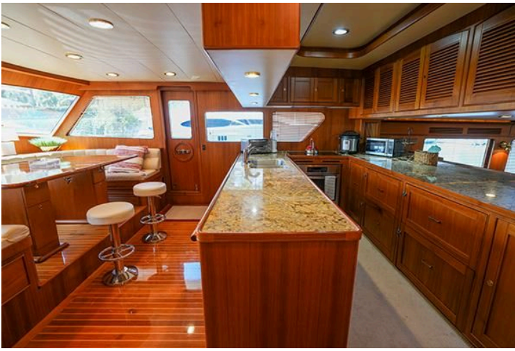
Luxurious Marlow 80E-CB yacht interior with elegant wood finishes and modern kitchen, 2015 model.