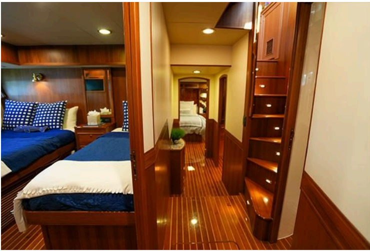
Luxurious Marlow 80E-CB 2015 yacht interior with wooden finishes and cozy bedrooms.