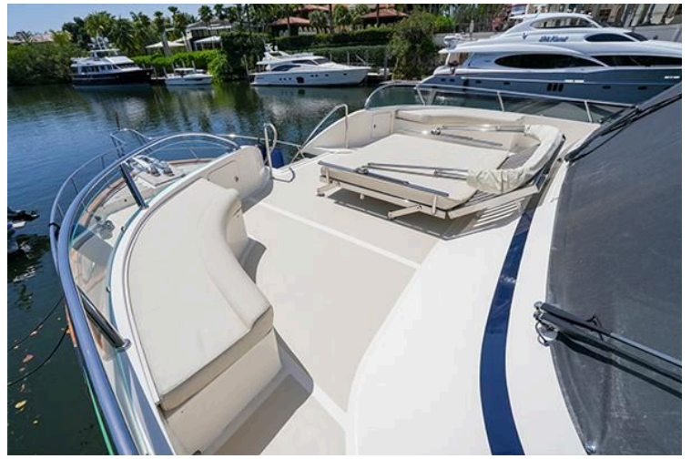
Luxurious 2015 Marlow 80E-CB yacht deck with spacious seating and scenic marina view.