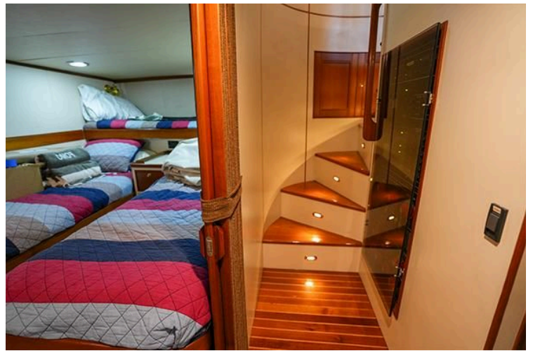
Cabin interior of 2015 Marlow 80E-CB yacht with bunk beds and wooden stairs.