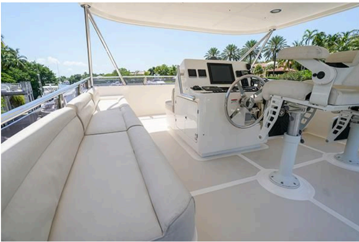
Flybridge of 2015 Marlow 80E-CB yacht with helm station and seating area.