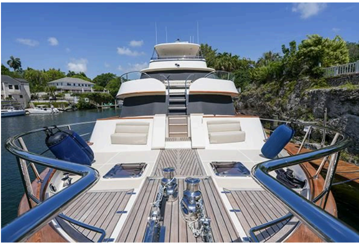
Luxurious 2015 Marlow 80E-CB yacht with spacious deck and elegant seating.