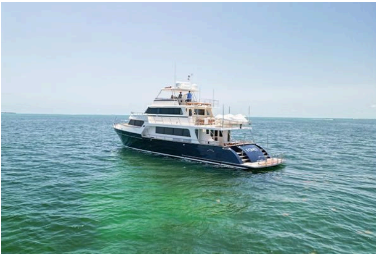
Luxury Marlow 80E-CB yacht cruising on open sea, 2015 model.