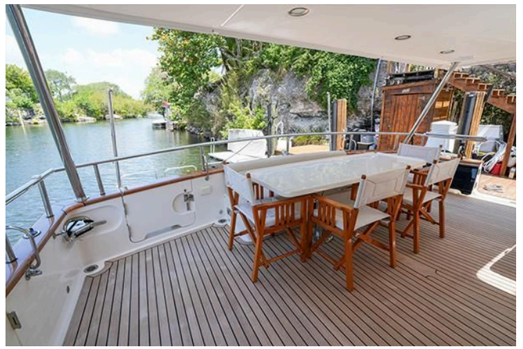
Spacious deck of 2015 Marlow 80E-CB yacht with outdoor dining area.