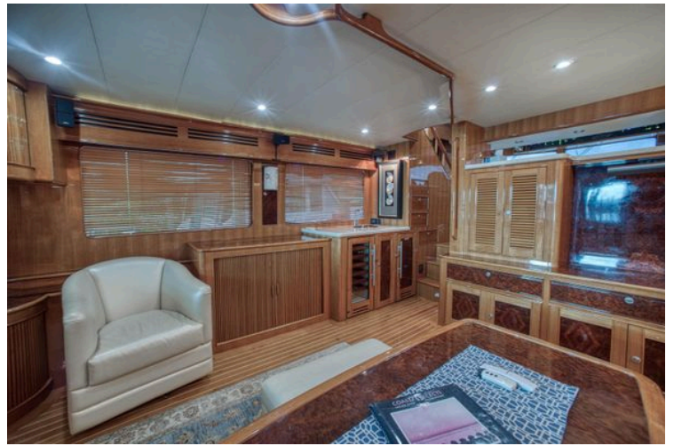
Luxurious interior of 2009 Marlow 57E yacht with elegant wood finishes and comfortable seating.