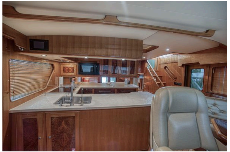
Luxurious interior of 2009 Marlow 57E yacht with modern kitchen and seating area.