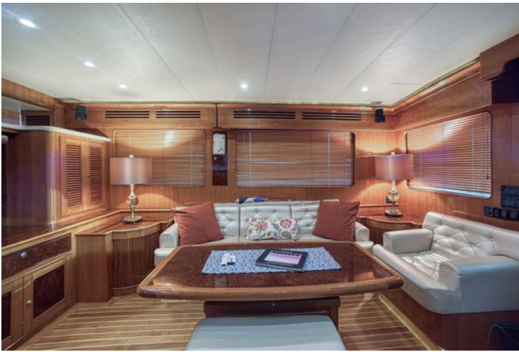
Luxurious interior of 2009 Marlow 57E yacht with elegant wood finishes and plush seating.