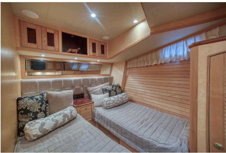
Luxurious cabin interior of 2009 Marlow 57E yacht with twin beds and elegant wood finish.