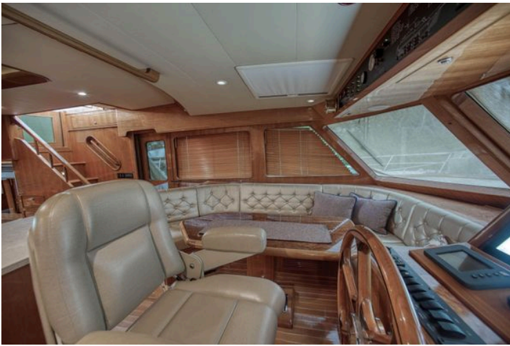
Luxurious interior of 2009 Marlow 57E yacht with leather seating and wooden accents.