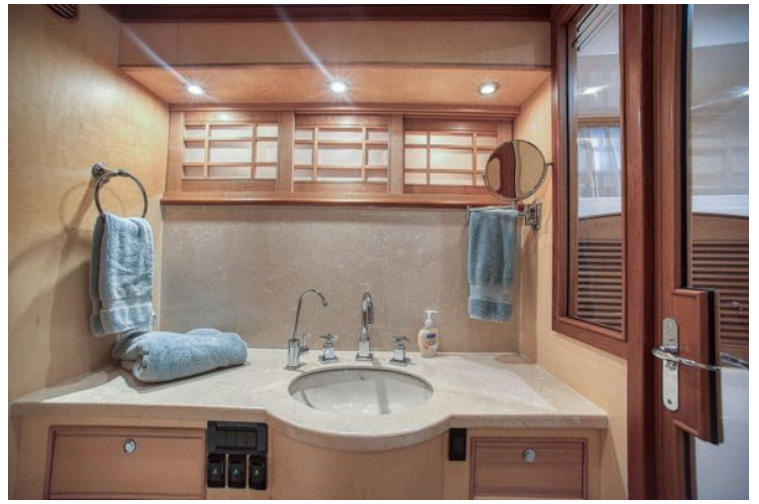
Luxurious bathroom interior of 2009 Marlow 57E yacht with elegant fixtures and soft lighting.