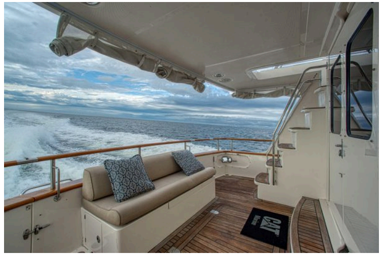
Luxurious 2009 Marlow 57E yacht deck with seating, ocean view, and elegant wood flooring.