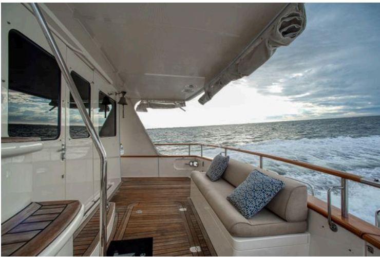
Luxurious 2009 Marlow 57E yacht deck with ocean view and comfortable seating.