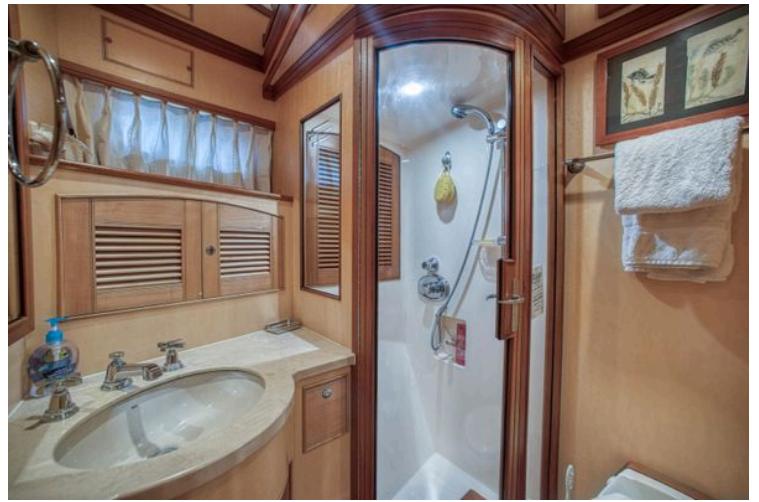
Luxurious Marlow 57E 2009 yacht bathroom with shower, sink, and elegant wood finishes.