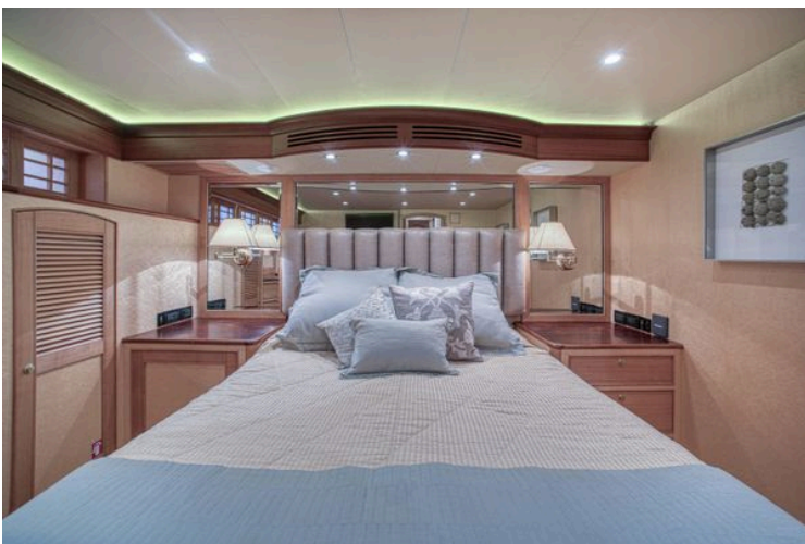
Luxurious bedroom interior on 2009 Marlow 57E yacht with elegant bedding and ambient lighting.