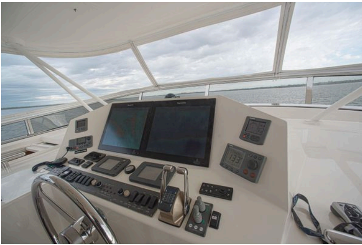
Helm of 2009 Marlow 57E yacht with navigation controls and dual screens.