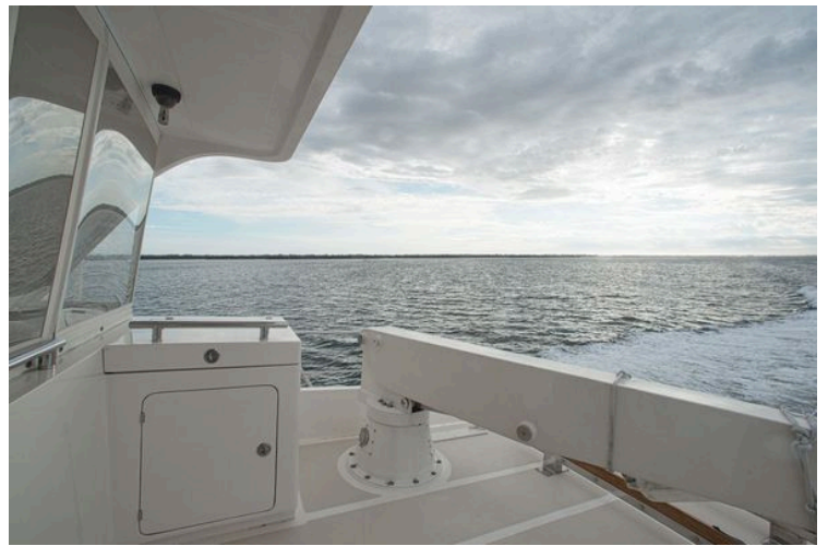
Marlow 57E yacht deck view, 2009 model, overlooking calm ocean waters under a cloudy sky.