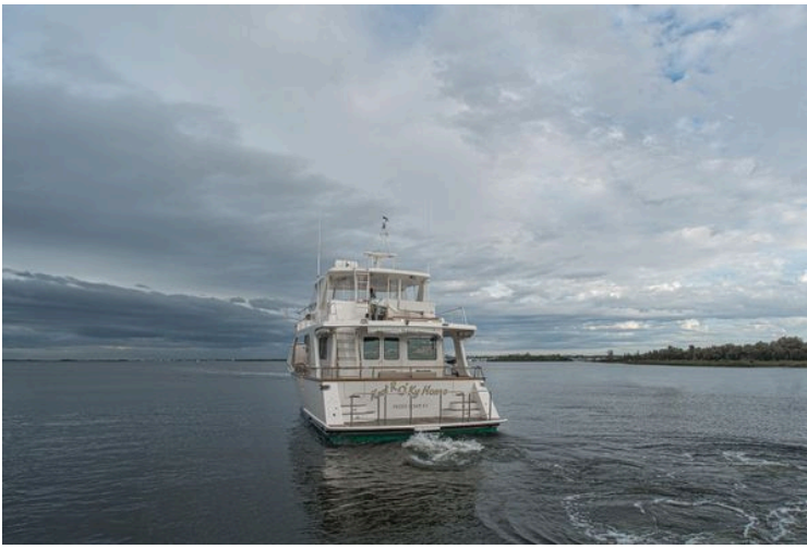
Marlow 57E yacht cruising on a cloudy day, 2009 model.