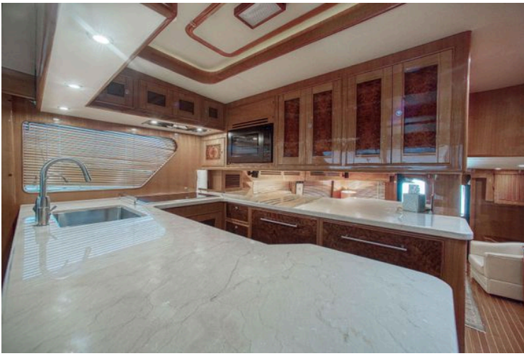
Luxurious kitchen interior of 2009 Marlow 57E yacht with marble countertops and wooden cabinetry.