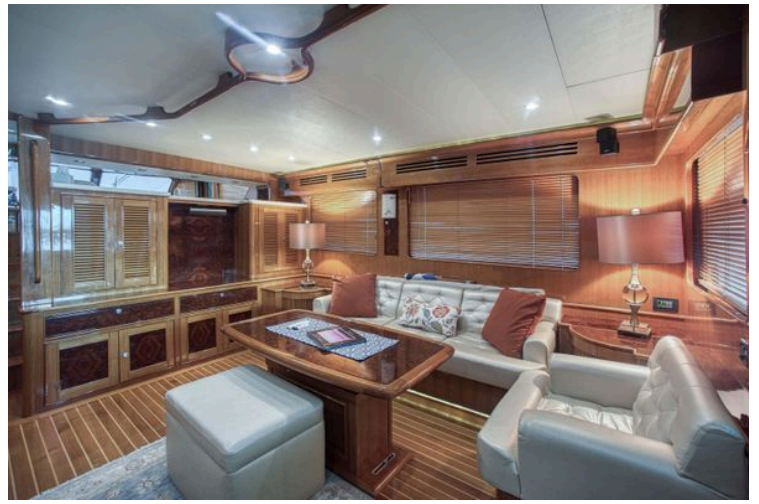
Luxurious interior of a 2009 Marlow 57E yacht with elegant wood finishes and plush seating.