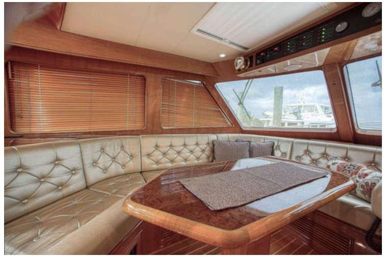
Luxurious interior of 2009 Marlow 57E yacht with elegant seating and wooden table.