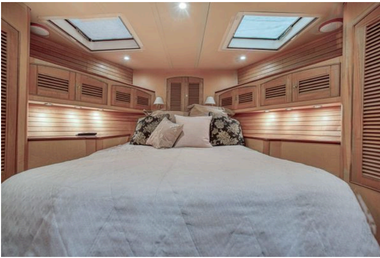
Luxurious cabin interior of 2009 Marlow 57E yacht with skylights and cozy bedding.