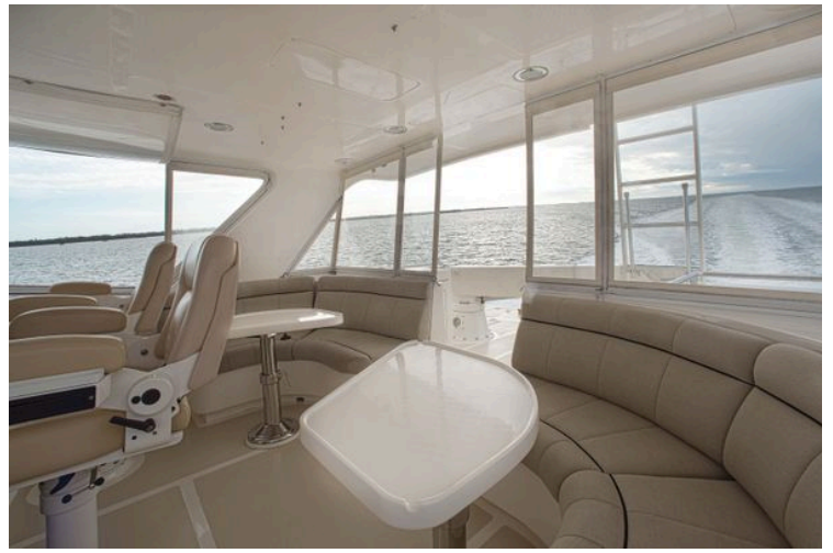
Luxurious interior of 2009 Marlow 57E yacht with panoramic ocean views.