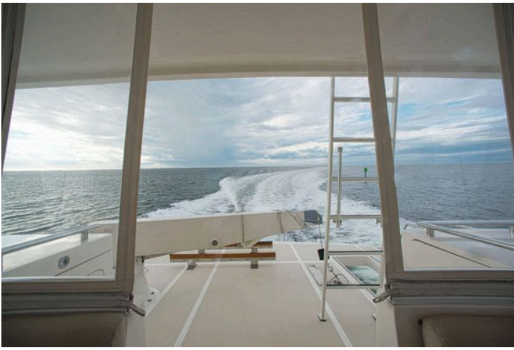
View from 2009 Marlow 57E yacht, showing ocean and wake under cloudy sky.