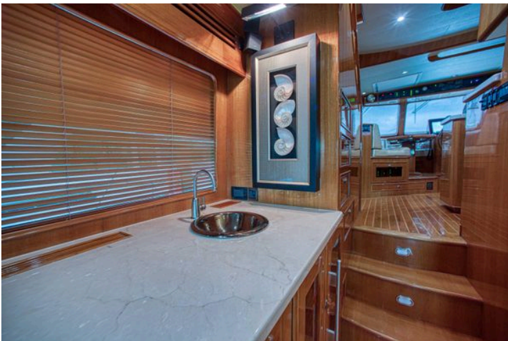
Luxurious Marlow 57E yacht interior with wooden finishes and modern sink, 2009 model.