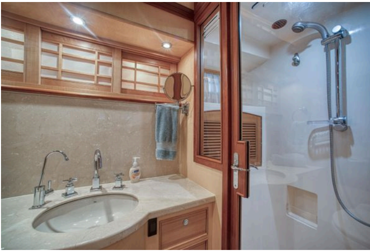
Luxurious bathroom in 2009 Marlow 57E yacht with modern fixtures and elegant design.