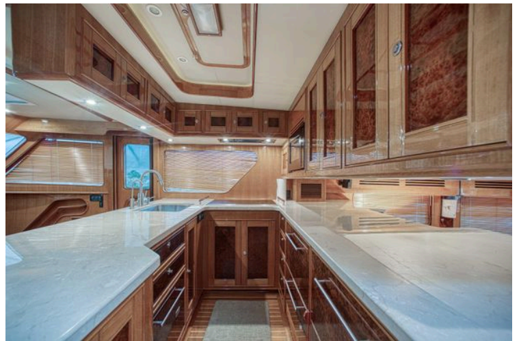
Luxurious wooden interior of a 2009 Marlow 57E yacht kitchen with modern amenities.