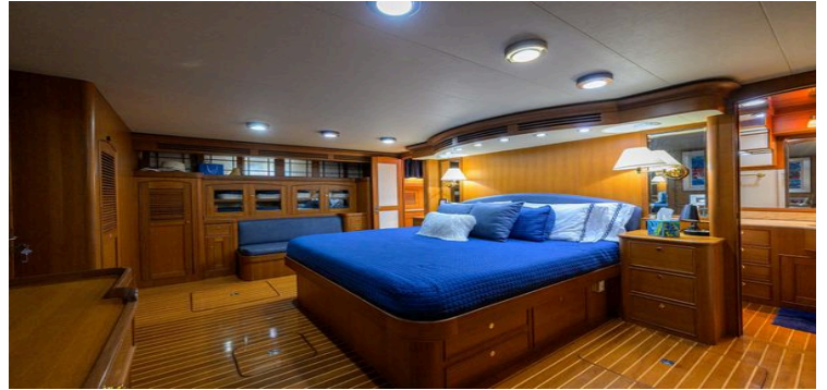
Luxurious cabin interior of 2006 Marlow 78E yacht with wooden furnishings and blue bedding.