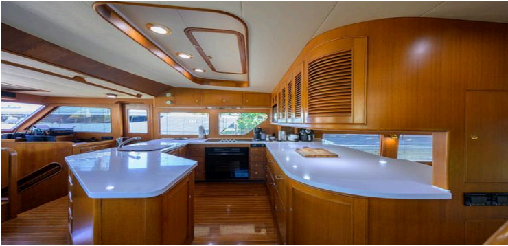
Luxurious Marlow 78E yacht kitchen interior with modern wood cabinetry, 2006 model.