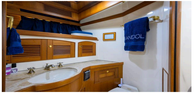
Luxurious Marlow 78E yacht bathroom with wooden cabinetry and elegant fixtures, 2006 model.