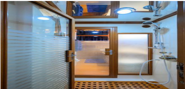
Luxurious Marlow 78E 2006 yacht shower with wood accents and modern fixtures.