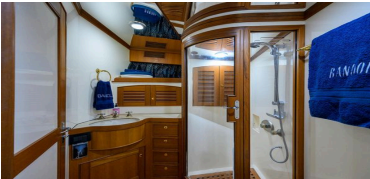
Luxurious Marlow 78E 2006 yacht bathroom with wood accents and modern shower.