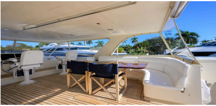
Luxurious 2006 Marlow 78E yacht deck with seating and table, surrounded by palm trees.