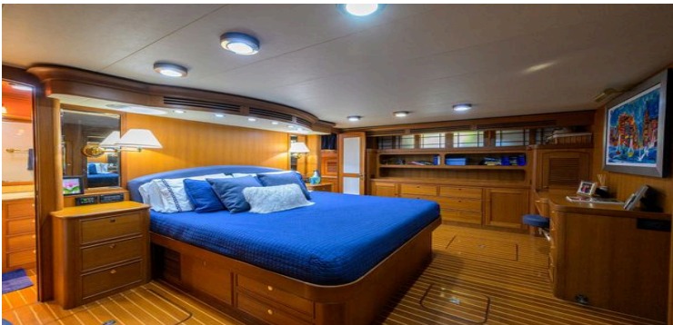
Luxurious Marlow 78E yacht bedroom with blue bedding and wooden furnishings, 2006 model.