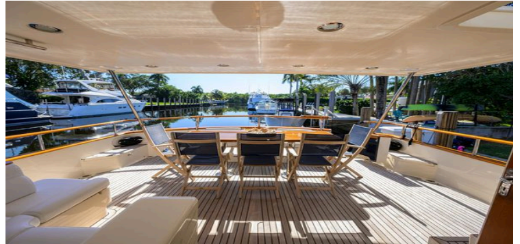
Spacious deck of 2006 Marlow 78E yacht with elegant seating and scenic marina view.