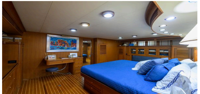
Luxurious Marlow 78E 2006 yacht bedroom with blue bedding and wooden decor.