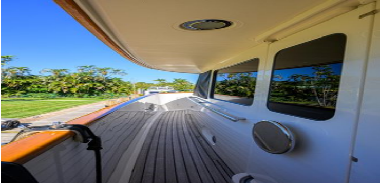
Side deck view of 2006 Marlow 78E yacht with teak flooring and sleek design.