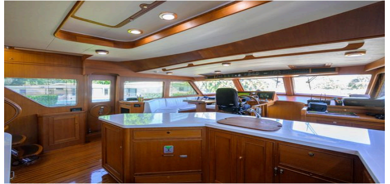
Luxurious 2006 Marlow 78E yacht interior with polished wood and modern amenities.