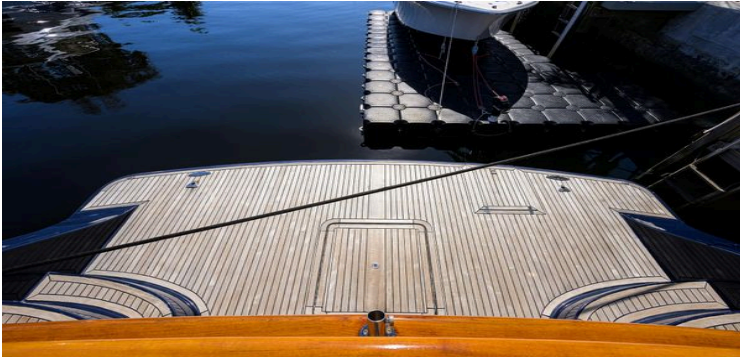
Marlow 78E yacht stern view, docked, showcasing teak deck, 2006 model.