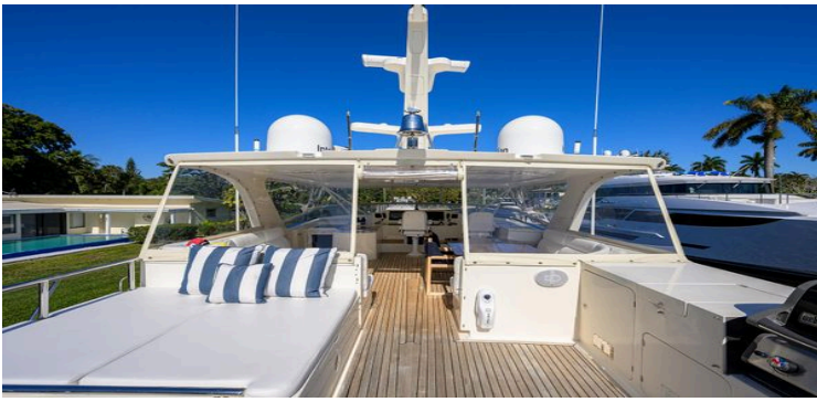
Luxurious 2006 Marlow 78E yacht deck with seating, blue sky, and palm trees.