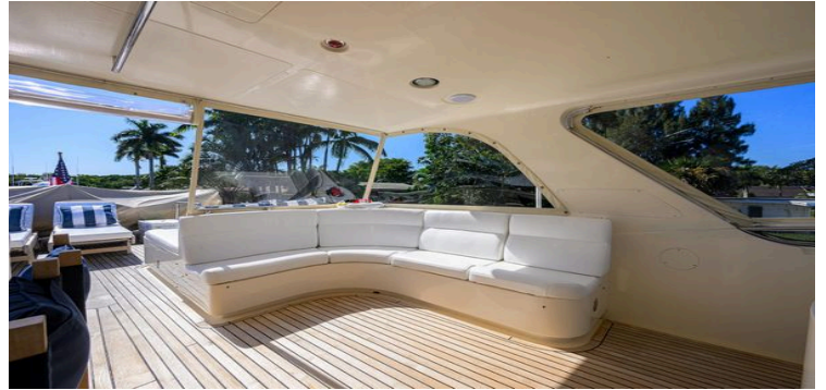
Luxurious 2006 Marlow 78E yacht interior with white seating and wooden deck.