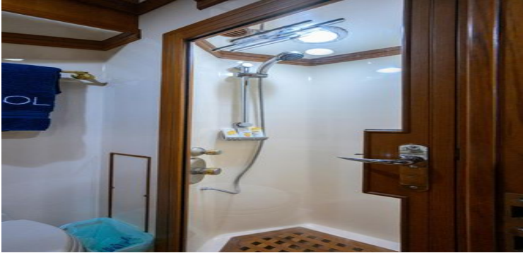
Luxurious shower in 2006 Marlow 78E yacht with wooden accents and modern fixtures.