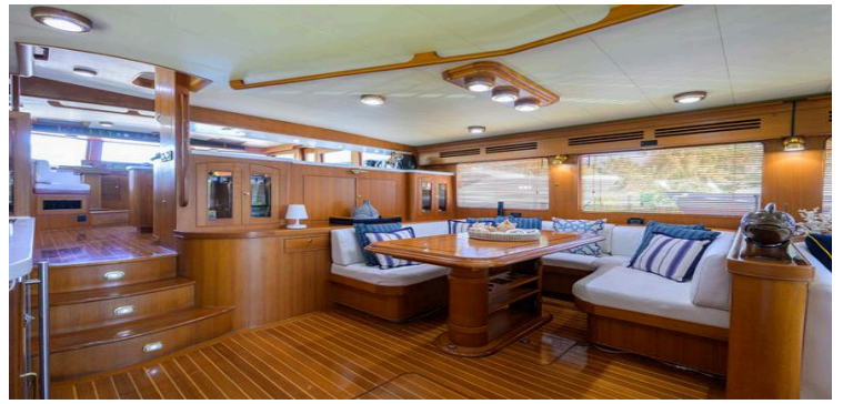
Luxurious interior of 2006 Marlow 78E yacht with elegant wood finish and cozy seating.