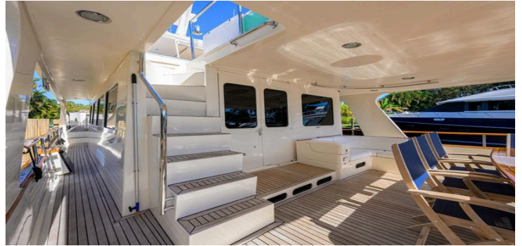
Spacious deck of 2006 Marlow 78E yacht with seating and stairs.