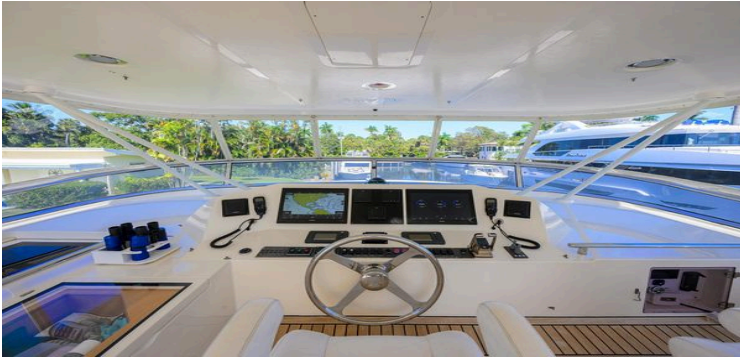
Interior view of 2006 Marlow 78E yacht helm with navigation screens and steering wheel.