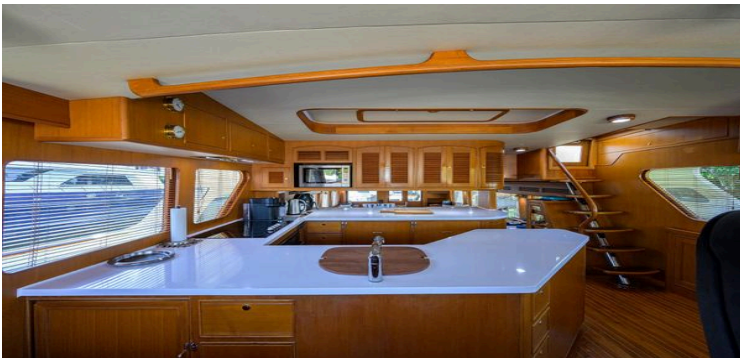
Luxurious Marlow 78E yacht kitchen interior, featuring modern appliances and elegant wood finishes, 2006 model.