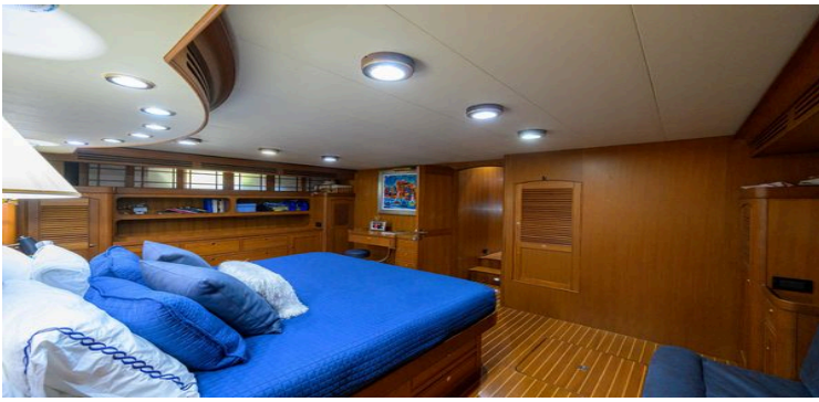
Luxurious Marlow 78E yacht bedroom with wood paneling and blue bedding, 2006 model.