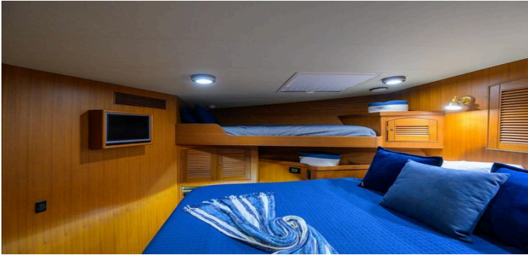
Cozy cabin interior of 2006 Marlow 78E yacht with wooden walls and blue bedding.