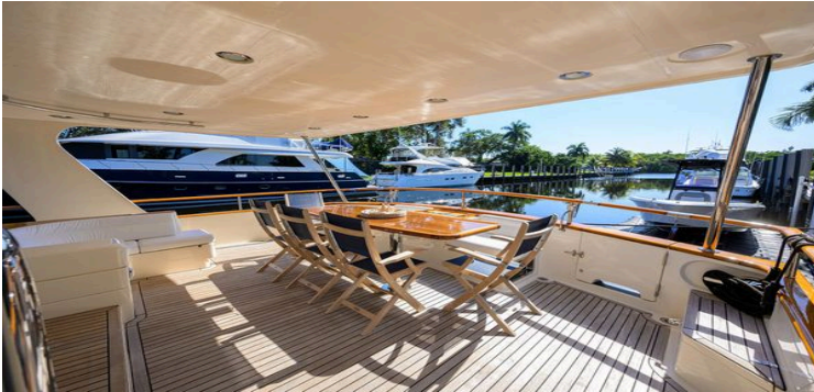
Spacious deck of 2006 Marlow 78E yacht with dining area, docked by serene waters.