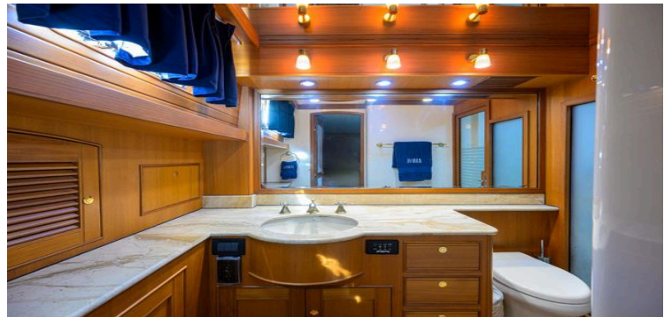
Luxurious Marlow 78E 2006 yacht bathroom with wood cabinetry and elegant lighting.