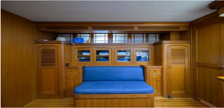
Luxurious wooden interior of 2006 Marlow 78E yacht with blue cushioned seating.