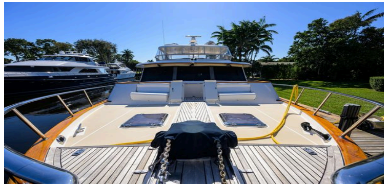
Marlow 78E yacht, 2006 model, docked with clear sky and lush greenery.