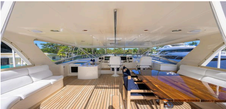
Luxurious 2006 Marlow 78E yacht interior with elegant seating and polished wood table.