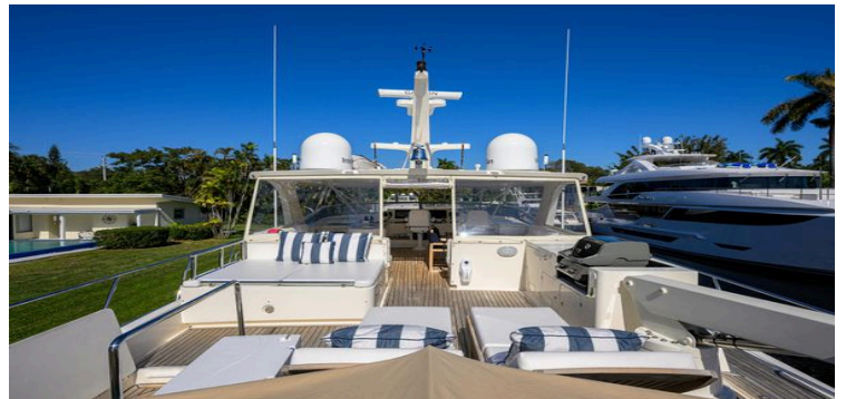
Luxurious 2006 Marlow 78E yacht deck with sun loungers and clear blue sky.