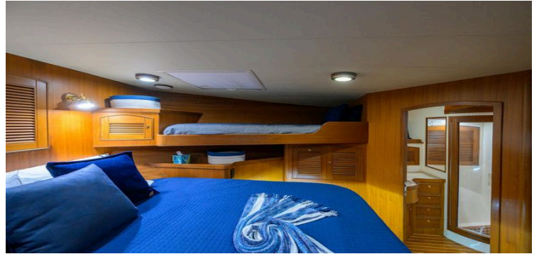
Cozy cabin interior of 2006 Marlow 78E yacht with blue bedding and wooden accents.