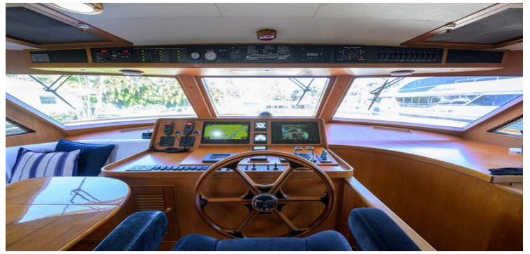
Interior helm of 2006 Marlow 78E yacht with navigation equipment and wooden steering wheel.