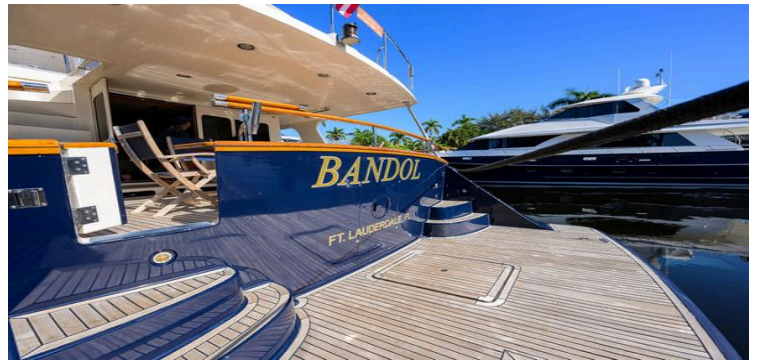
Luxury yacht Marlow 78E, 2006 model, docked in Fort Lauderdale marina.