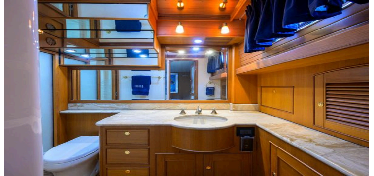
Luxurious Marlow 78E 2006 yacht bathroom with wood cabinetry and elegant lighting.