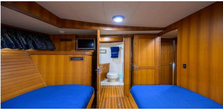
Luxurious Marlow 78E 2006 yacht cabin with twin beds and ensuite bathroom.