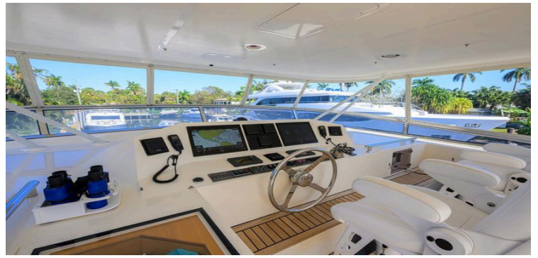
Luxurious 2006 Marlow 78E yacht helm with modern navigation equipment and panoramic views.