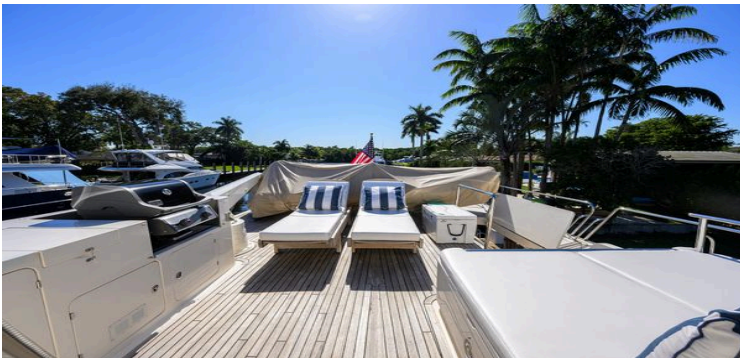
Luxury Marlow 78E yacht deck with sun loungers, palm trees, and clear blue sky.