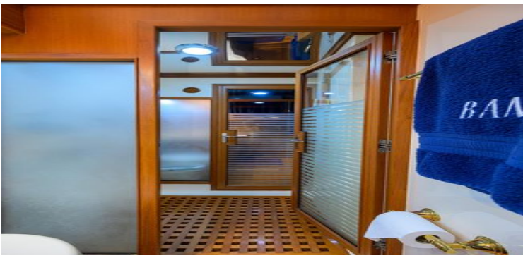
Luxurious Marlow 78E 2006 yacht bathroom with wooden accents and frosted glass doors.