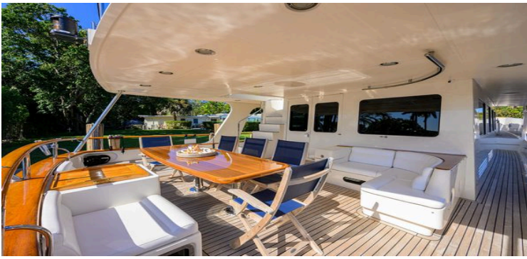
Luxurious 2006 Marlow 78E yacht deck with elegant seating and dining area.