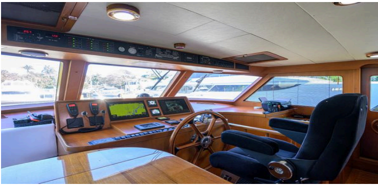
Luxurious 2006 Marlow 78E yacht helm with advanced navigation systems and plush seating.