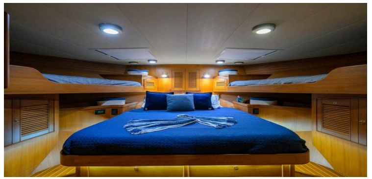
Luxurious cabin interior of 2006 Marlow 78E yacht with cozy bedding and ambient lighting.