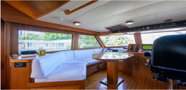
Luxurious interior of a 2006 Marlow 78E yacht with plush seating and navigation controls.