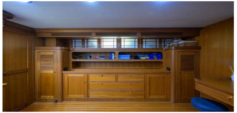
Wooden interior of 2006 Marlow 78E yacht with built-in storage and shelving.