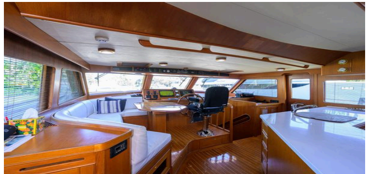
Luxurious interior of a 2006 Marlow 78E yacht with wood finishes and modern amenities.