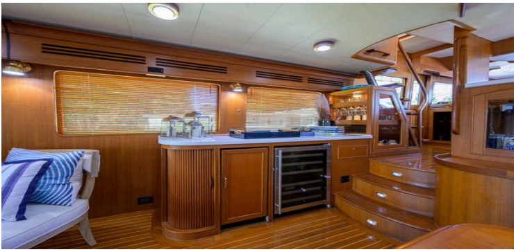
Luxurious 2006 Marlow 78E yacht interior with wooden cabinetry and modern amenities.