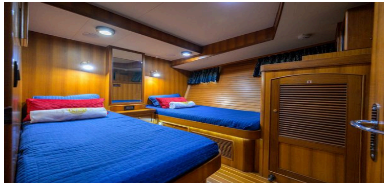
Luxurious 2006 Marlow 78E yacht cabin with twin beds and wooden interior.