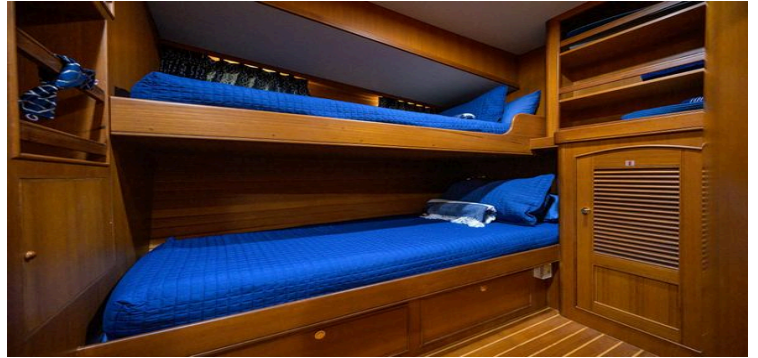
Wooden bunk beds with blue bedding in a 2006 Marlow 78E yacht cabin.