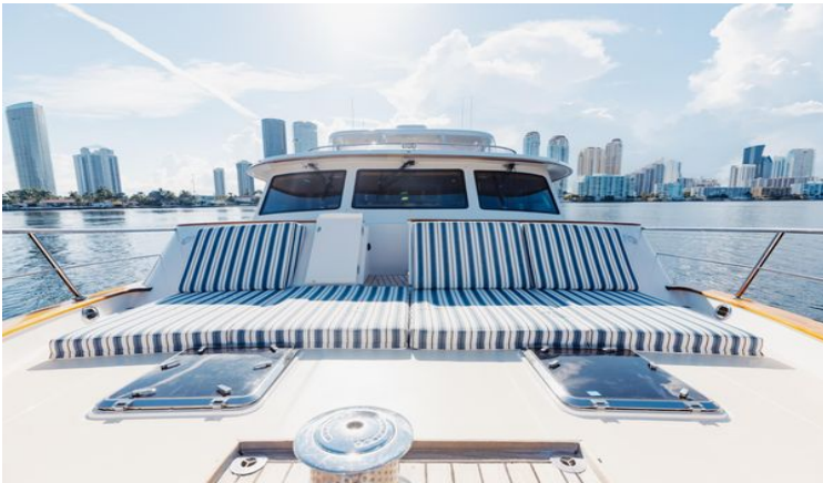
Seating area Bow