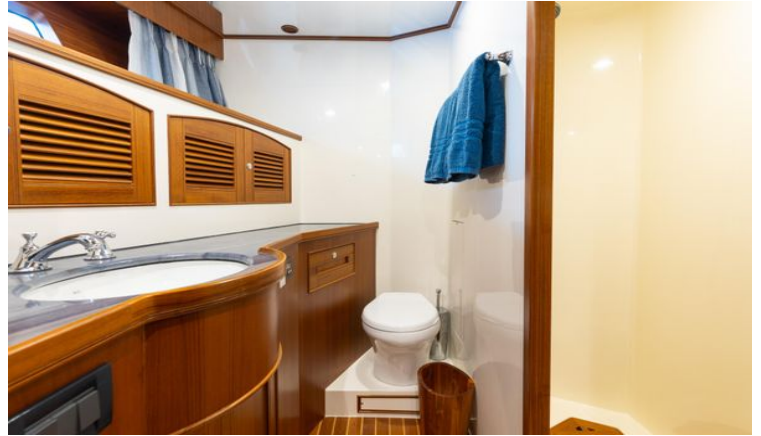
Guest 2 Head