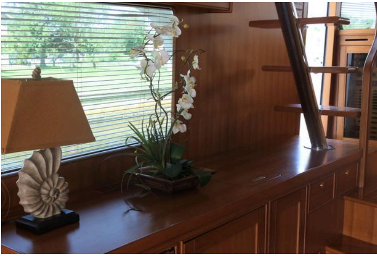
Interior of 2008 Marlow 53 C Explorer yacht with wooden decor and staircase.