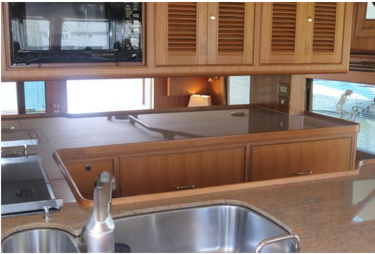
Interior of 2008 Marlow 53 C Explorer yacht kitchen with wood cabinets and stainless steel sink.