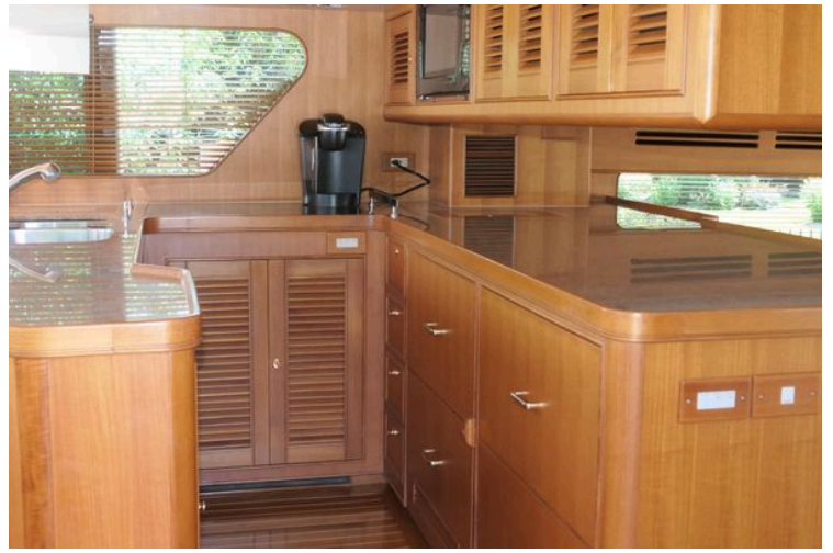
Luxurious wooden kitchen interior of 2008 Marlow 53 C Explorer yacht.