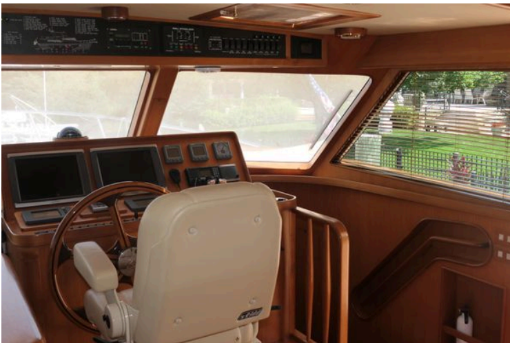
2008 Marlow 53 C Explorer yacht helm with wooden interior and navigation equipment.