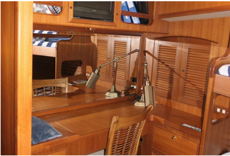
Interior of 2008 Marlow 53 C Explorer yacht with wooden cabinetry and desk.