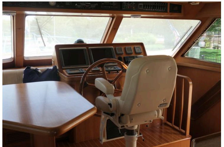
Interior of 2008 Marlow 53 C Explorer yacht with helm, steering wheel, and navigation equipment.