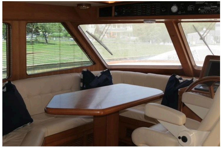
Interior of 2008 Marlow 53 C Explorer yacht with seating and helm.