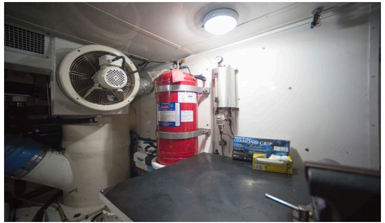
Fire Bottle and Fans