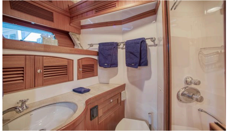
Port Guest Head