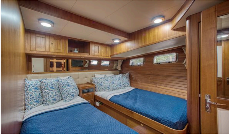
Port Guest Bunks