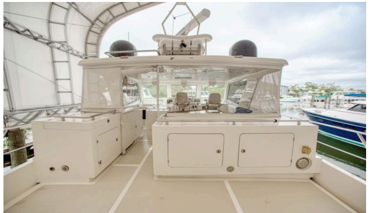
FB Storage, Sink, Grill