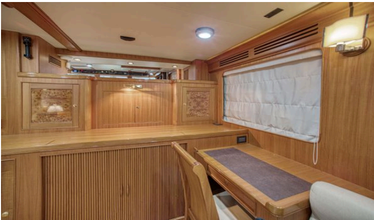
Salon Desk TV on Lift