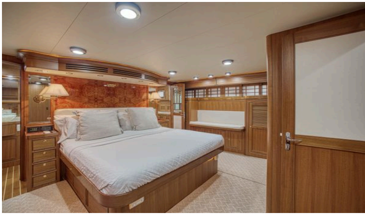
Master Looking Aft