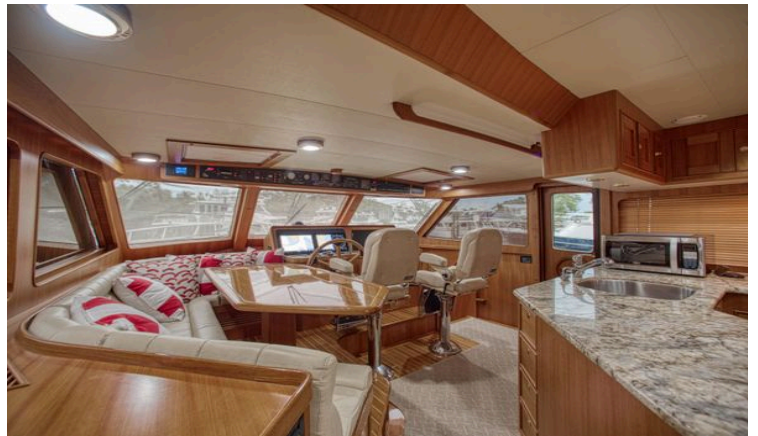
Pilothouse and Galley