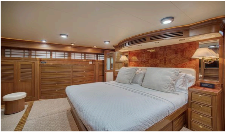
Master Looking Aft