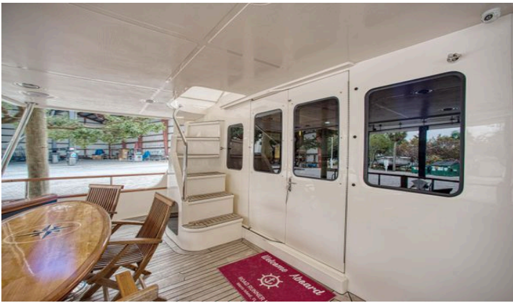
Stairs to Boat Deck