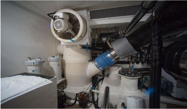
Port Sea Chest Below