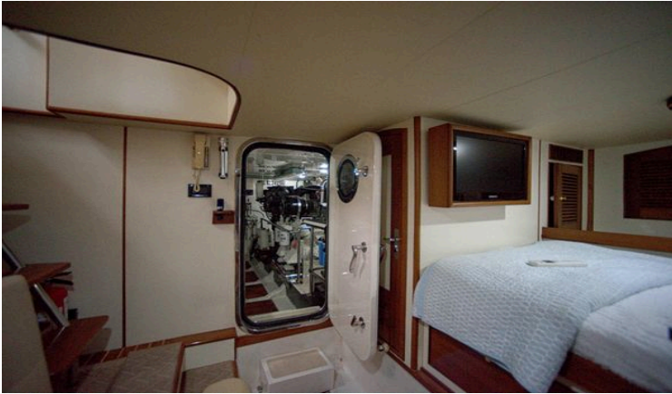
Engine Room Door