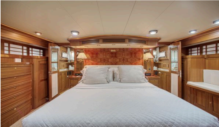
Master King Bed