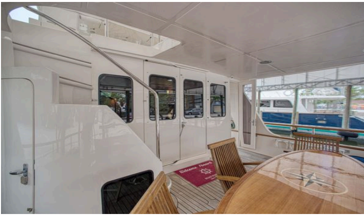
Aft Salon Doors and Crew Access