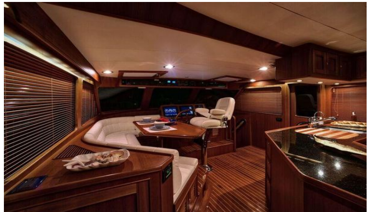
Pilot House and Settee