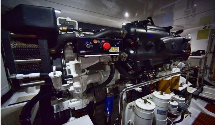
Engine Room Turbo