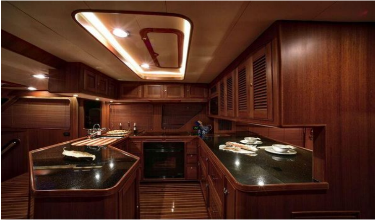
Galley Looking Starboard