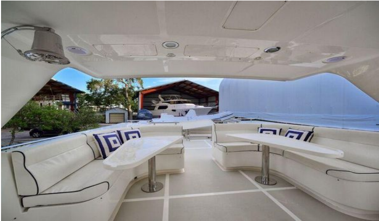
Flybridge Deck Settee Looking Aft