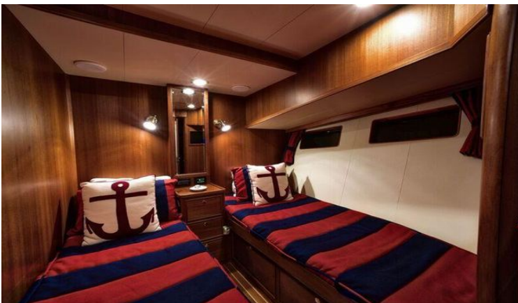
3rd Guest Stateroom