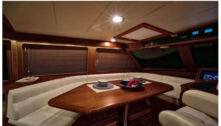
Pilot House Port Side Settee