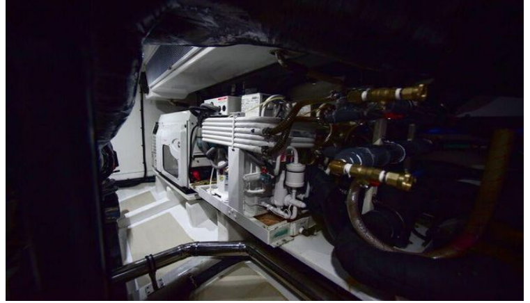
Engine Room Chillers