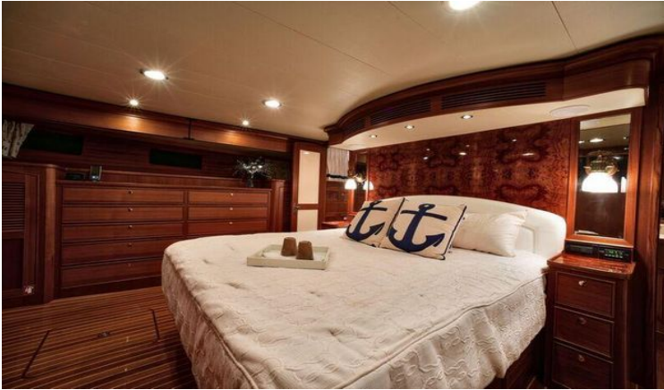
Master Stateroom Port Side View