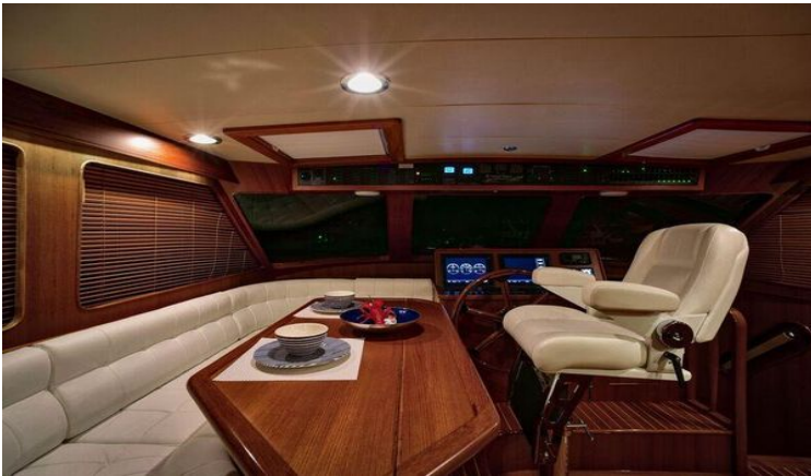
Pilot House Port Side Settee and Helm Chair