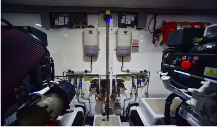
Fuel Tank Bulk Head