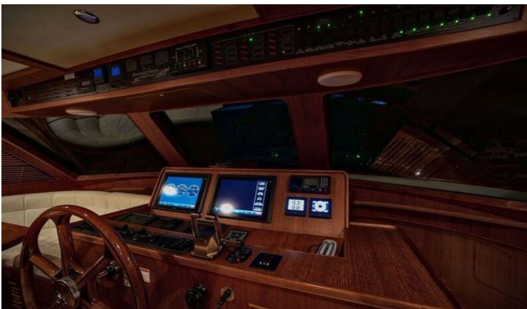
Pilot House Helm