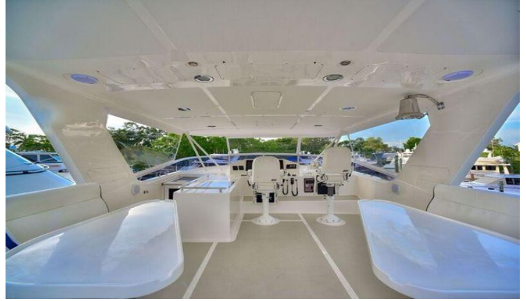
Flybridge Deck Looking Forward