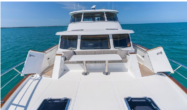
View from Bow Pulpit w/ Portuguese doors open