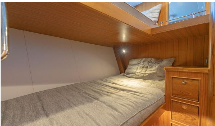
Port Side Stateroom bottom bunk