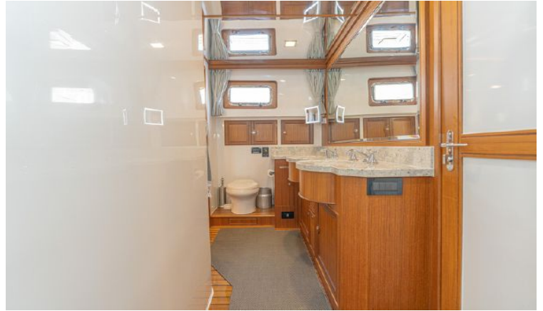
Master Stateroom en-suite looking starboard