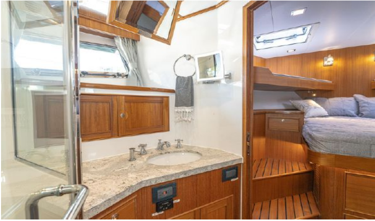
VIP Head looking forward