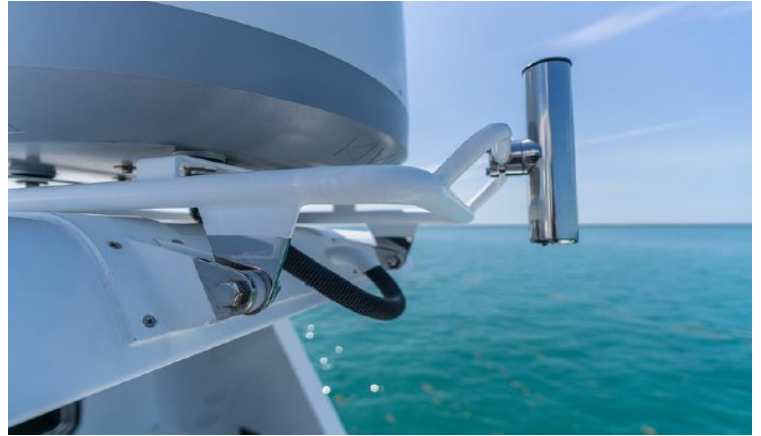
Loop ready electronics