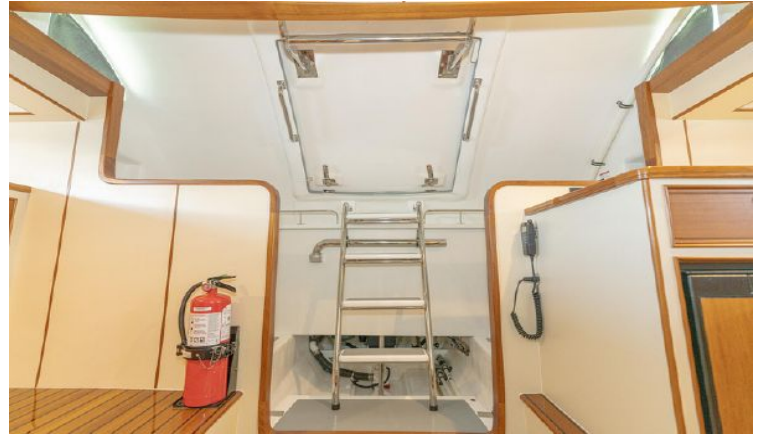
Large watertight transom door