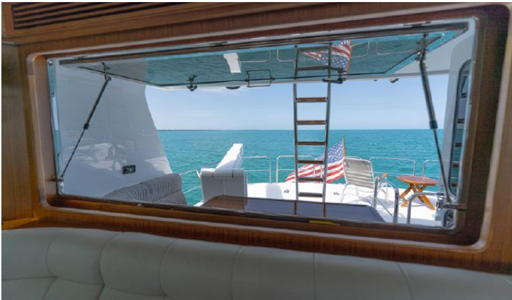
Opening Aft window