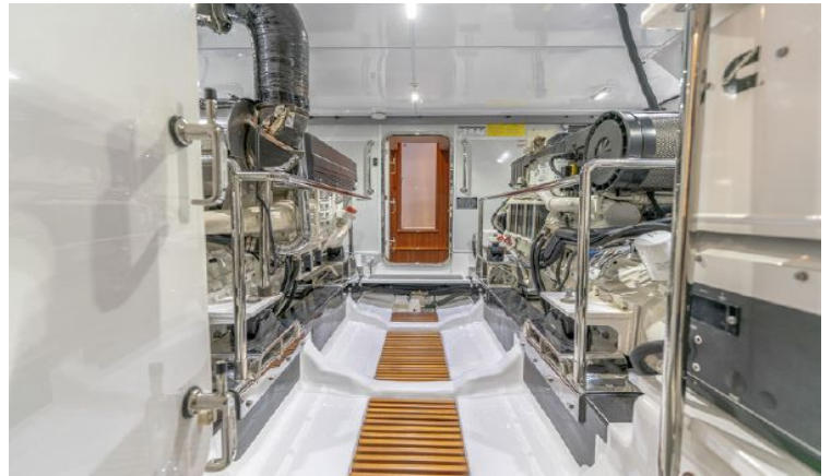
Engine Room looking Forward