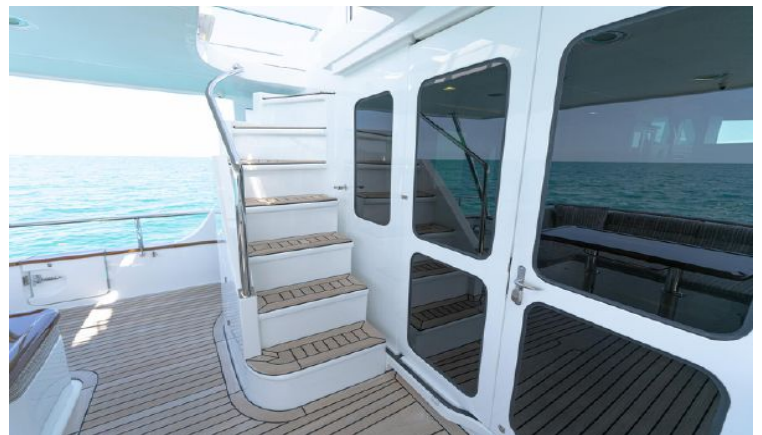
Lower Aft stairs to upper deck