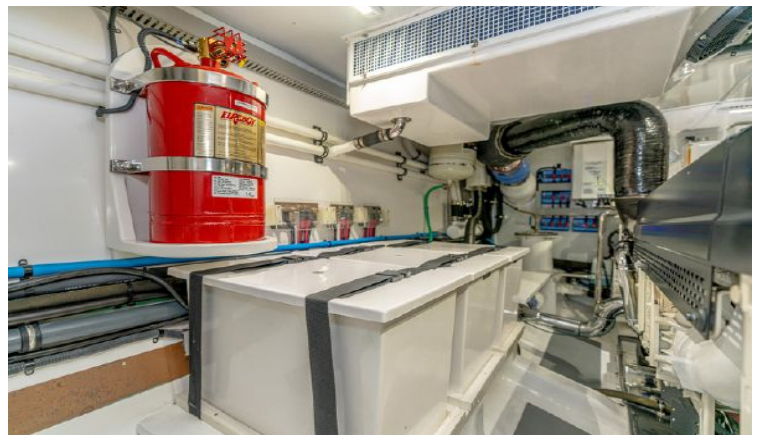
Engine Room outboard side 2