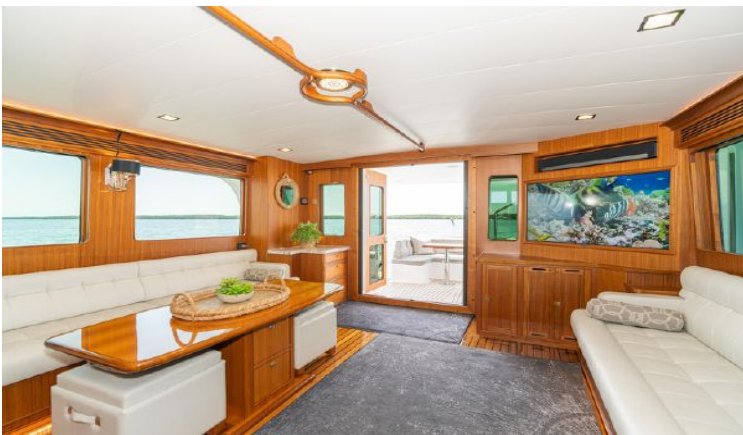
Salon looking Aft - doors open