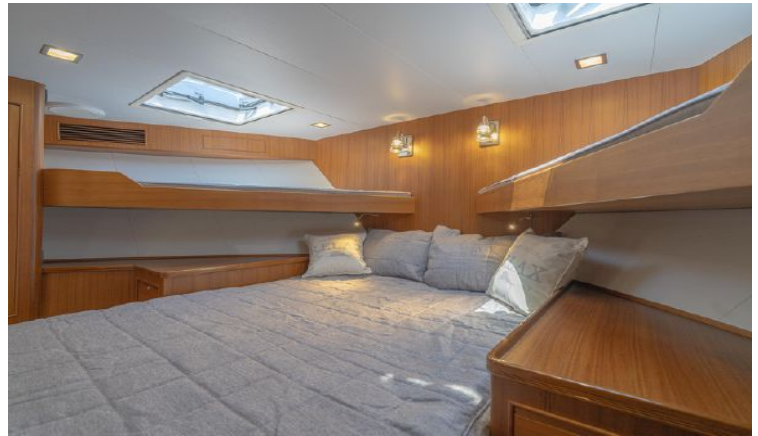
VIP looking port