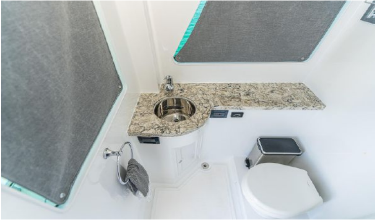
Command Bridge Day Head