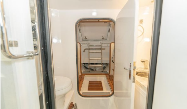
Looking Aft from Crew Head