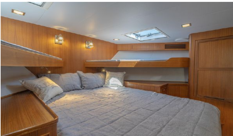
VIP looking starboard