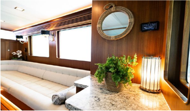
Gost system in Salon