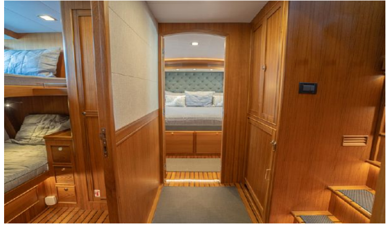
VIP aft view