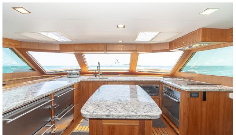
Custom galley with center island