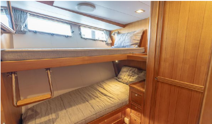
Port Side Stateroom