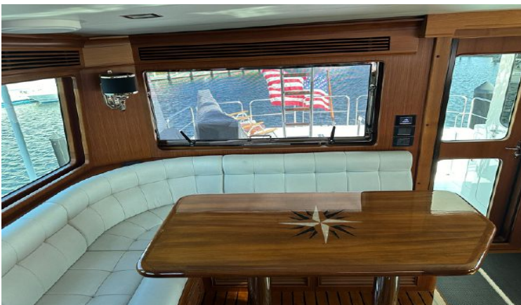
High gloss teak table with compass inlay