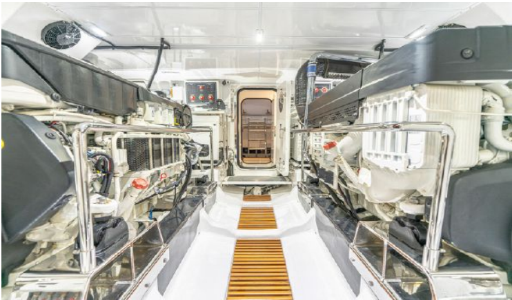
Engine Room looking Aft