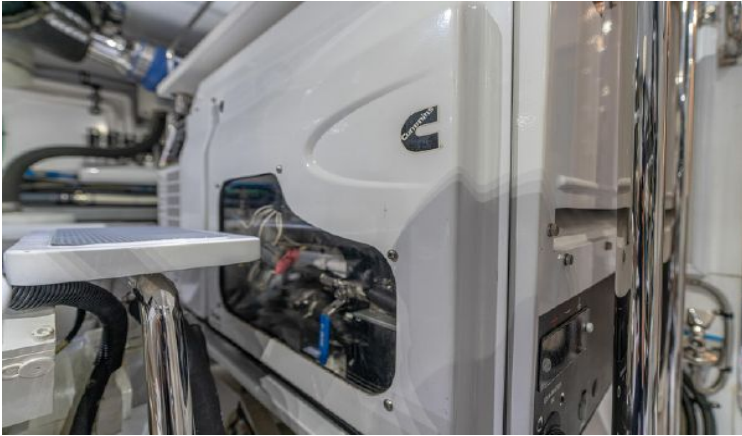
Engine Room outboard side 3