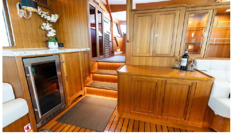
Salon wet bar