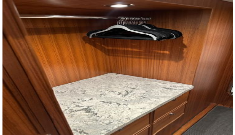
Built-in drawers w/ add'l hangin space, Cambria count...