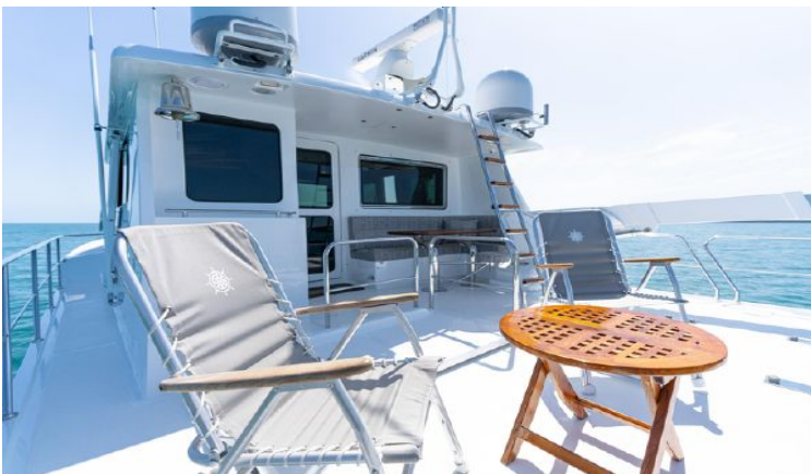
Upper deck facing forward