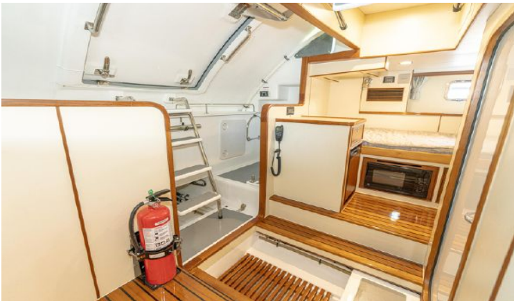
Crew quarters looking port