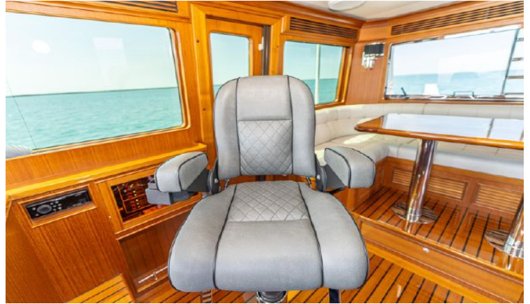
Custom diamond on Stidd