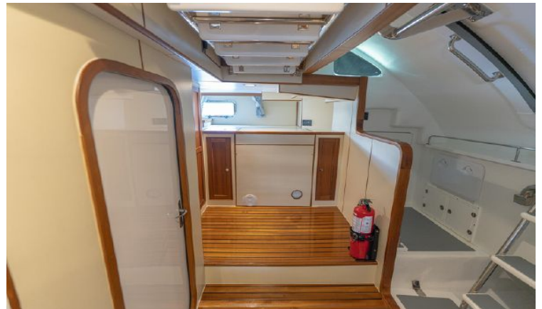
Crew quarters looking starboard with freezer