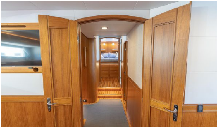
Master Stateroom looking forward