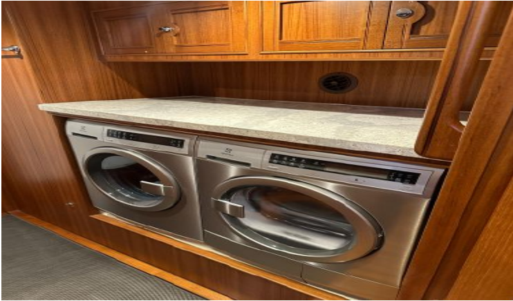
Electrolux W/D w/ Cambria countertops