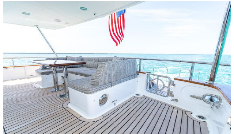
Lower Aft deck U-shape settee