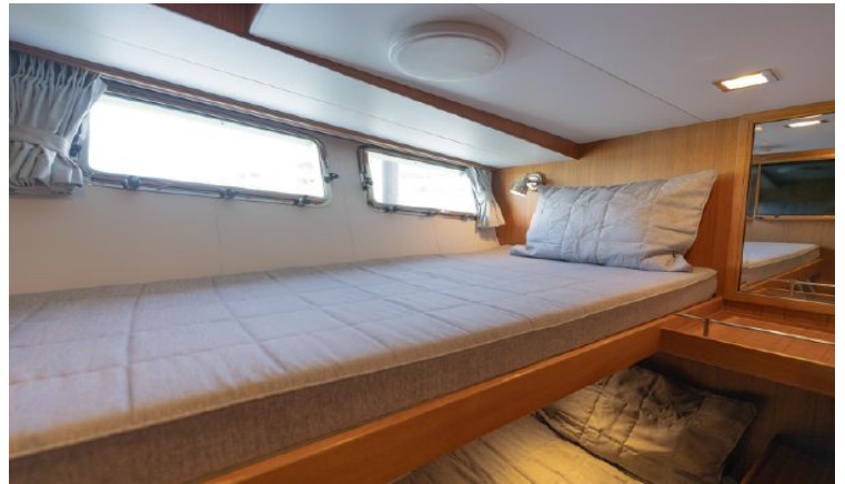
Port Side Stateroom top bunk