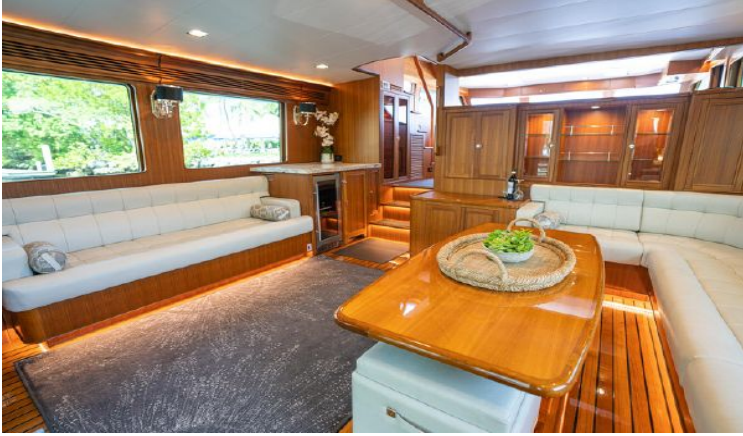
Salon looking to port