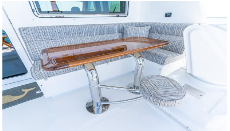
Upper Aft Deck settee