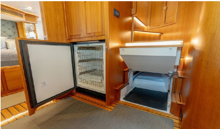
Companionway freezer with storage