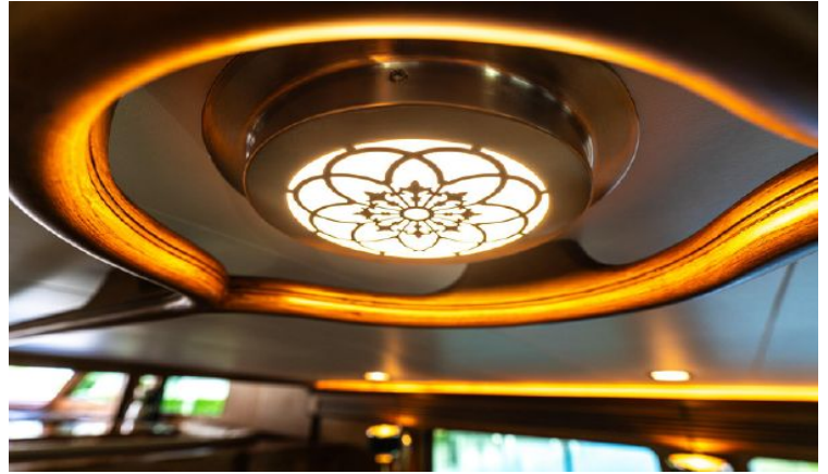
Custom light in Salon