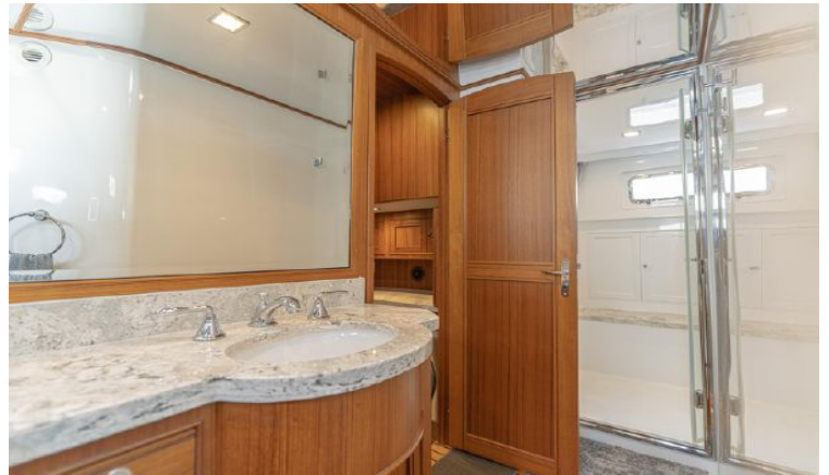
Access to laundry from en-suite