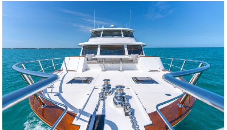
View from Bow Pulpit