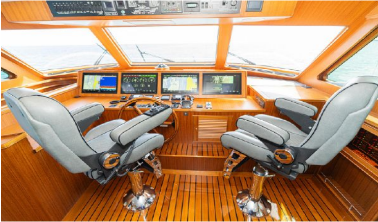
Stidd Helm Chairs