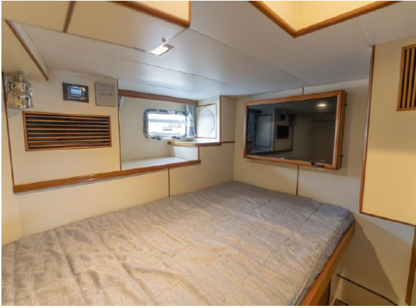
Crew oversized berth