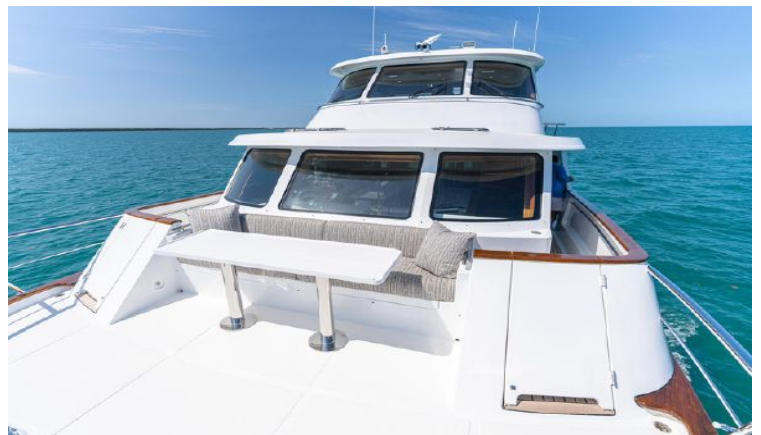
Custom Bow seating with large table