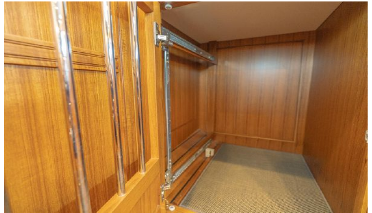
Custom built kennel