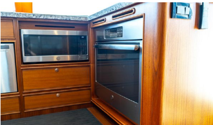
GE Monogram oven & microwave