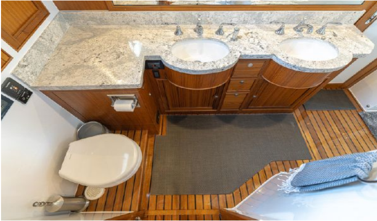
Master Stateroom en-suite double sink