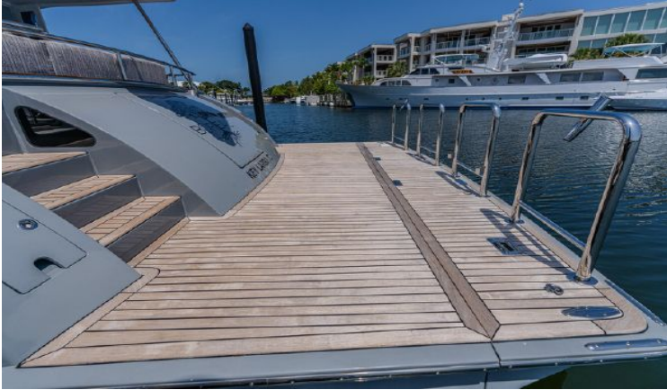
Extended hydraulic swim platform