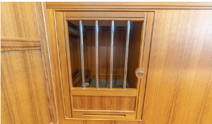
Custom built kennel w/ door closed