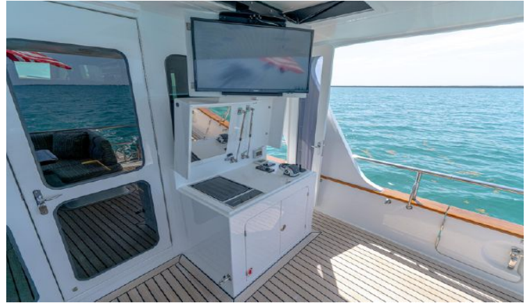
Stbd. corner w/ grill/docking station