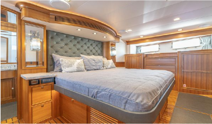
Master Stateroom looking port