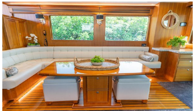
Salon looking to starboard