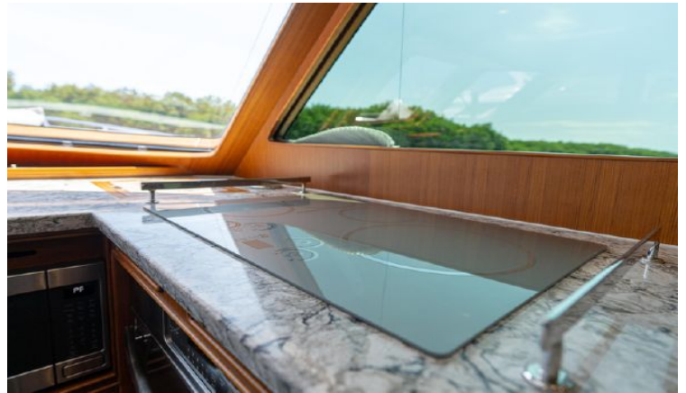
GE Monogram induction cook top