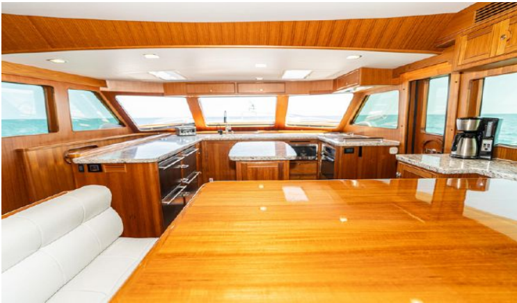
Galley facing forward from dining table