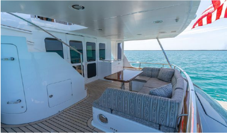
Aft deck seating