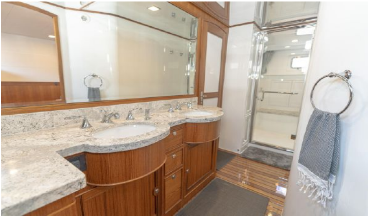
Master Stateroom en-suite shower looking to port