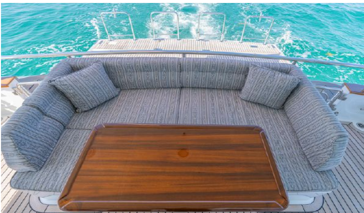
Lower Aft deck U-shape settee w/ high table