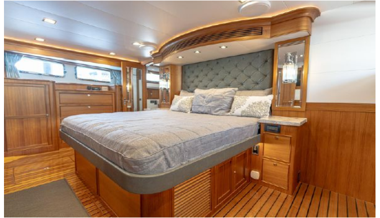
Master Stateroom looking to Starboard