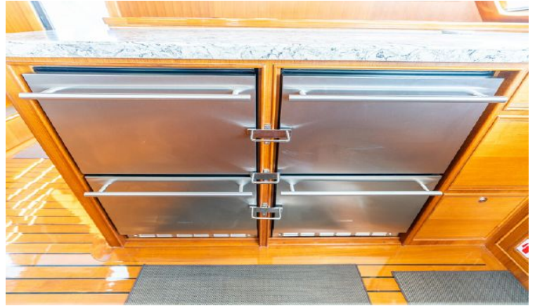
4 GE Monogram Refrigerators