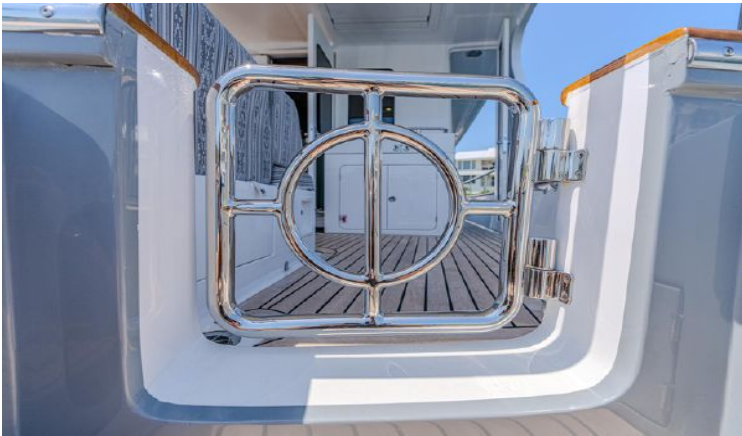
Custom stainless steel boarding gate