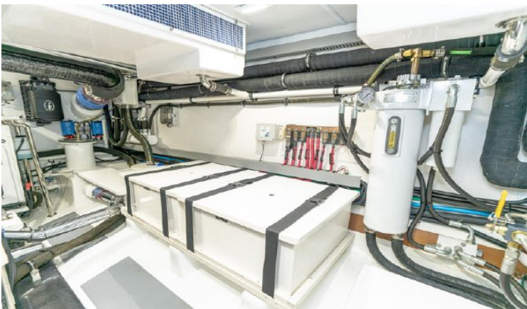
Engine Room outboard side