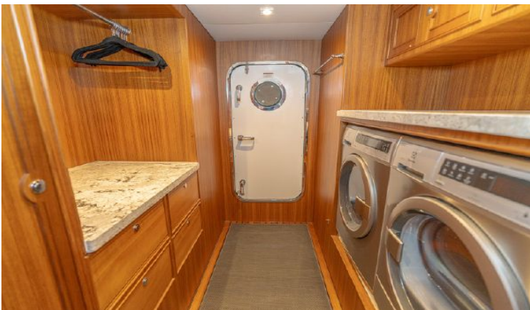
Access to laundry room