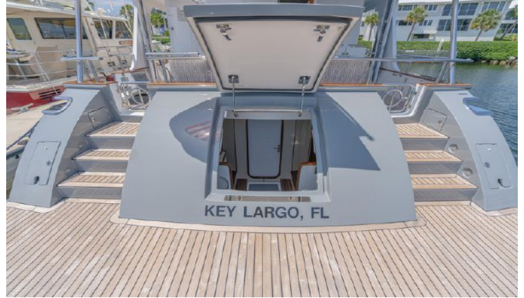
Transom door into Lazarette