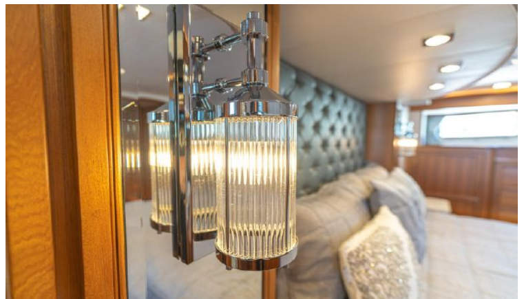
Designer sconce over nightstand