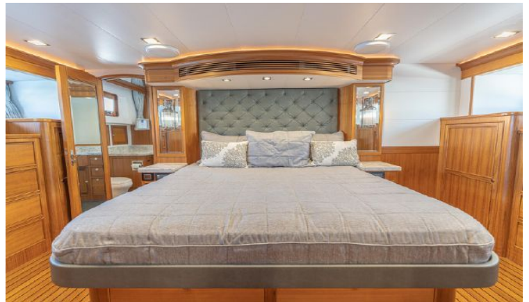
Master Stateroom looking aft