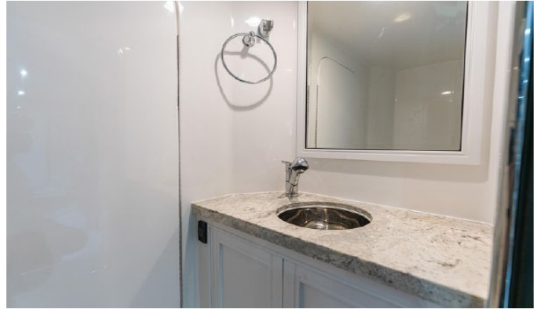
Crew wet head with Cambria countertops