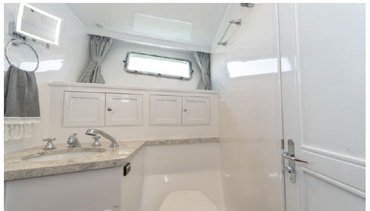
Port Side Stateroom Head