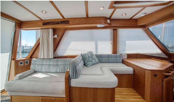
Salon Port Side