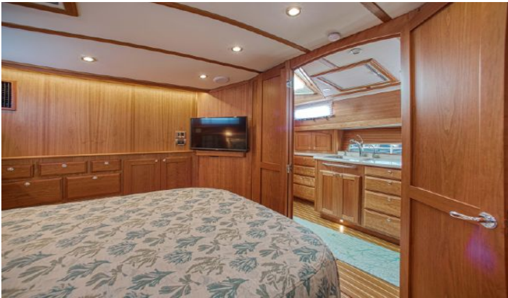
Master Looking out