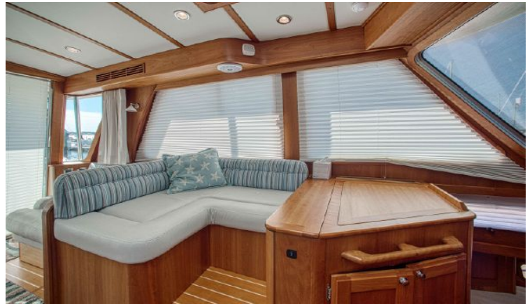
Port Side Salon