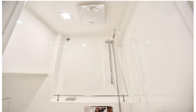
Master rain shower head