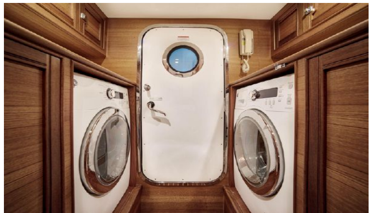
Washer and Dryer