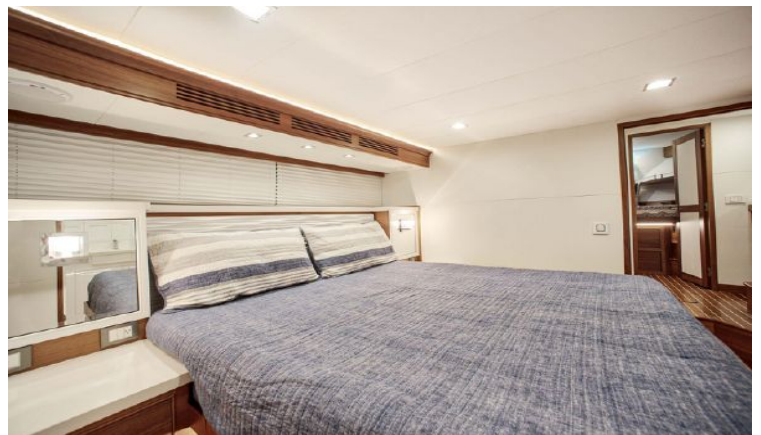
Master Stateroom looking forward