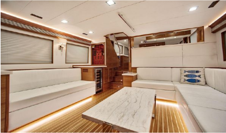
Salon looking forward