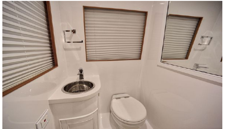
Command Bridge Day Head