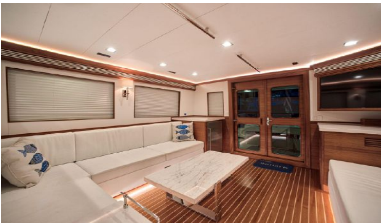
Salon looking to starboard-aft