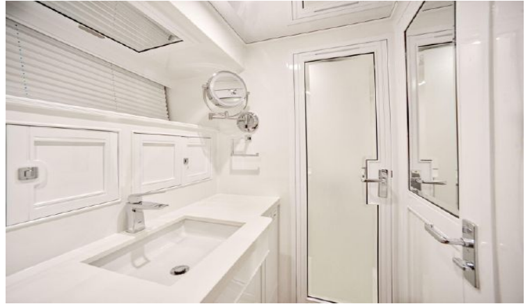
Master Head looking aft