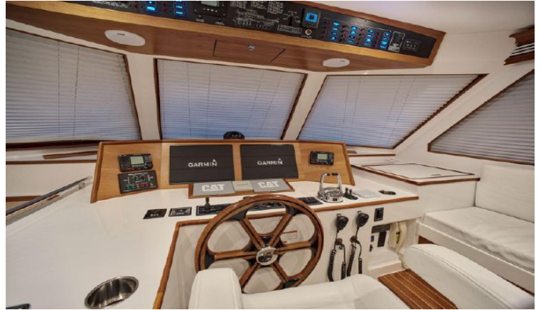
Command Bridge looking forward