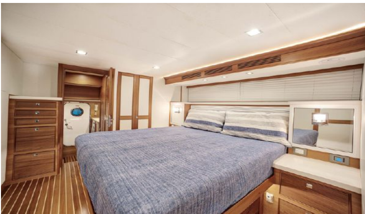
Master Stateroom looking aft