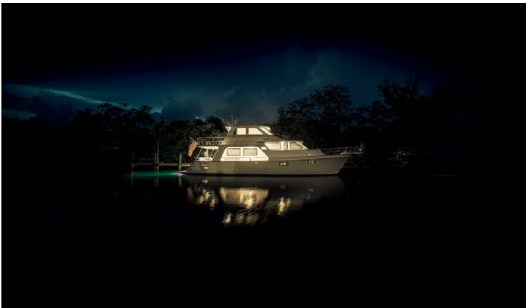
Timber's Toy at night