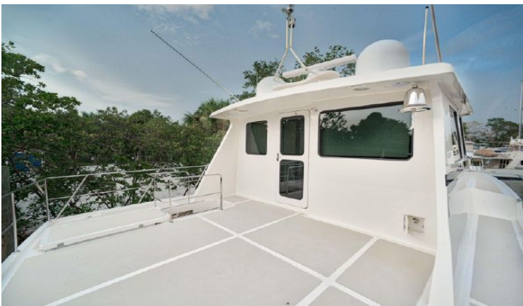
Upper Aft Deck