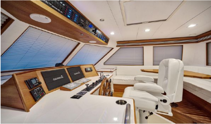
Command Bridge looking to starboard