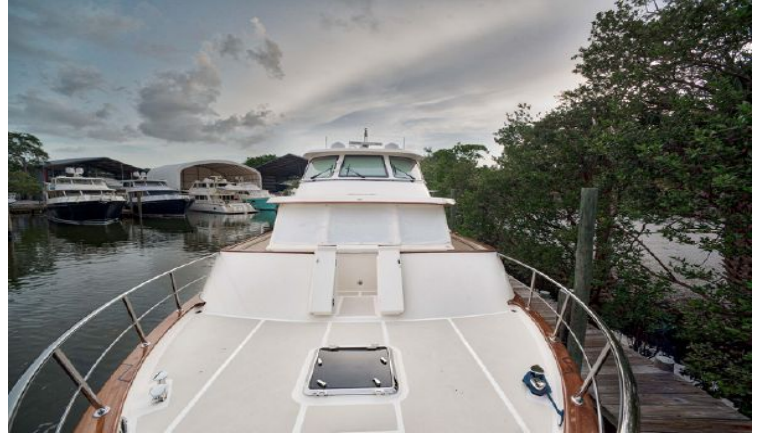
Foredeck Looking Aft