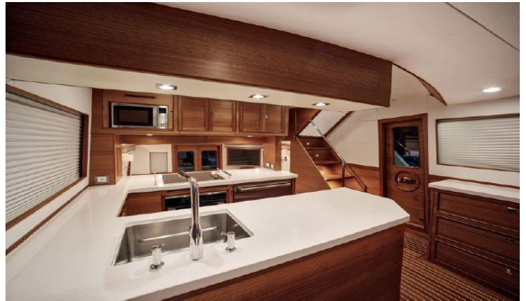
Galley Looking Aft