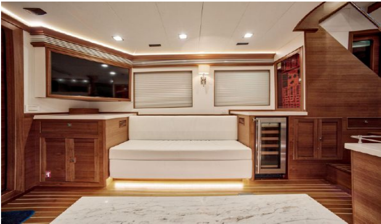
Salon looking to port