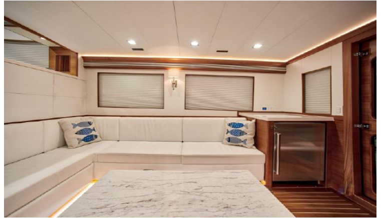
Salon looking to starboard