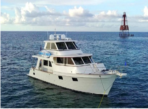
Timber's Toy anchored out