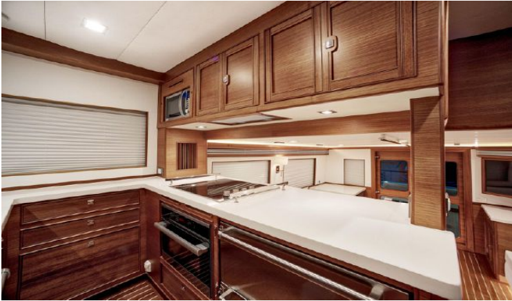
Galley aft counter