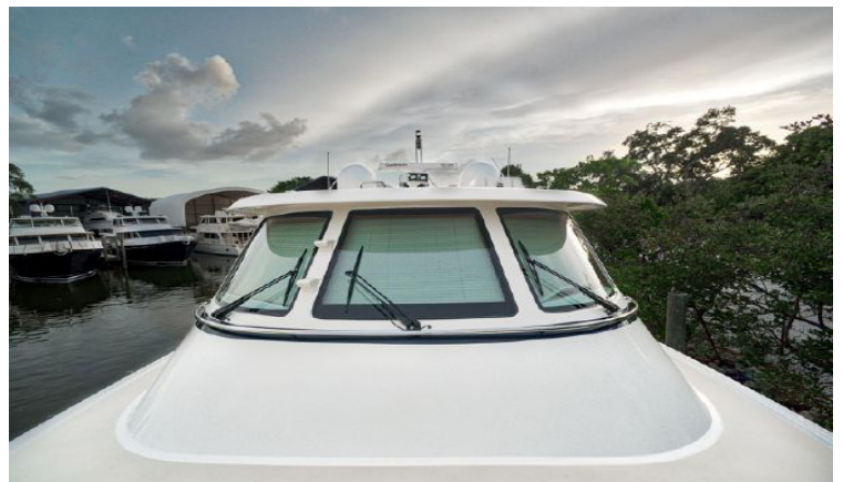
Command Bridge looking aft