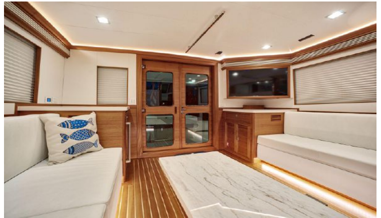
Salon looking port-aft