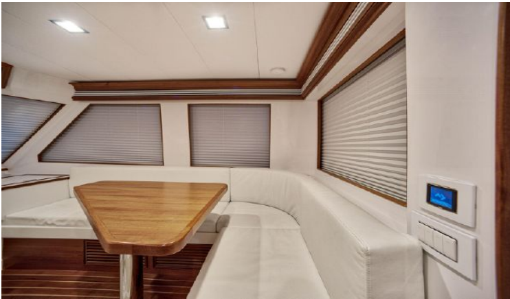
Command Bridge seating