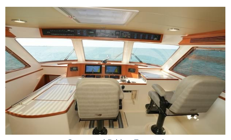
Command Bridge Forward