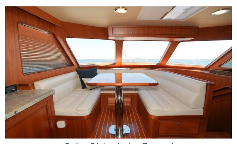
Galley Dining facing Forward