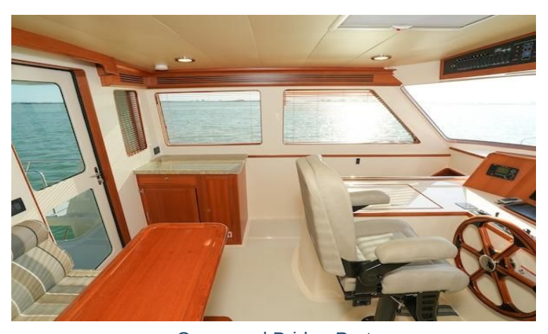
Command Bridge Port