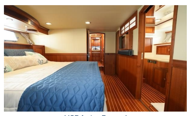
MSR facing Forward