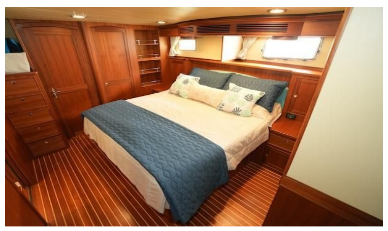
MSR facing Aft Port