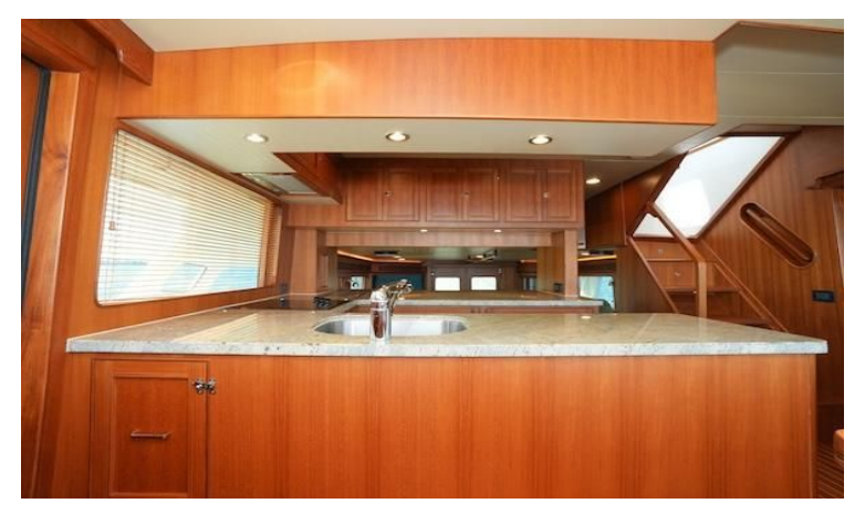
Galley facing Aft