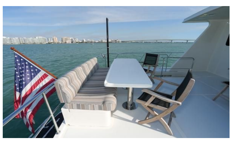
Upper Aft Deck Dining facing Stb