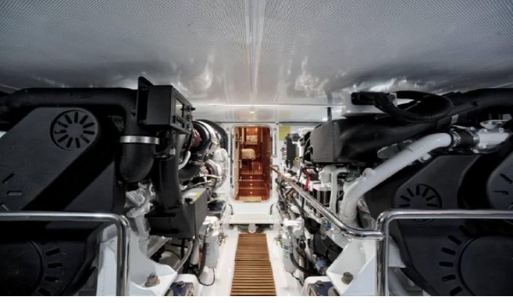
Engine Room Looking Aft