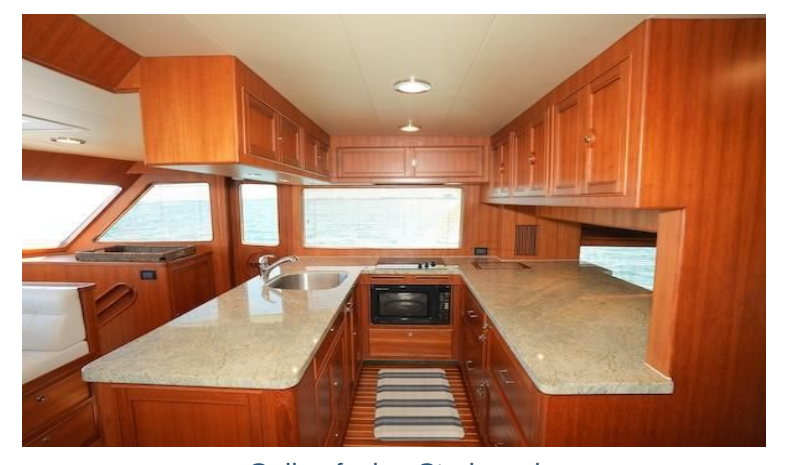
Galley facing Starboard