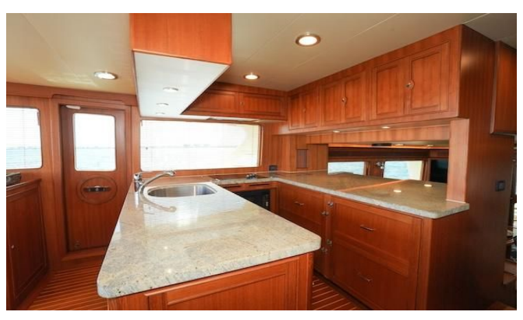
Galley facing Starboard