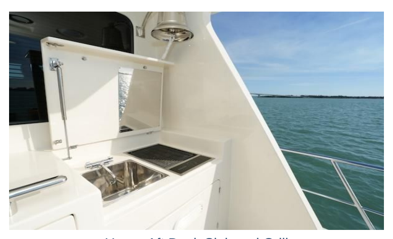
Upper Aft Deck Sink and Grill