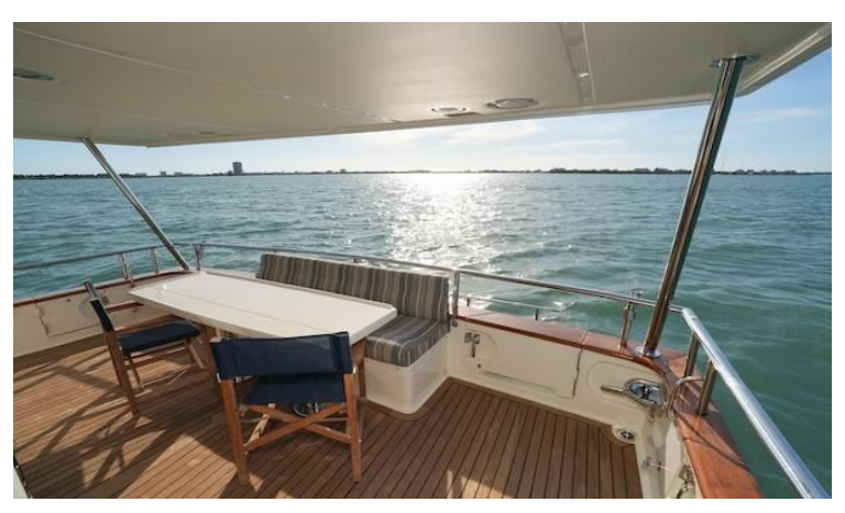
Cockpit facing Starboard Aft