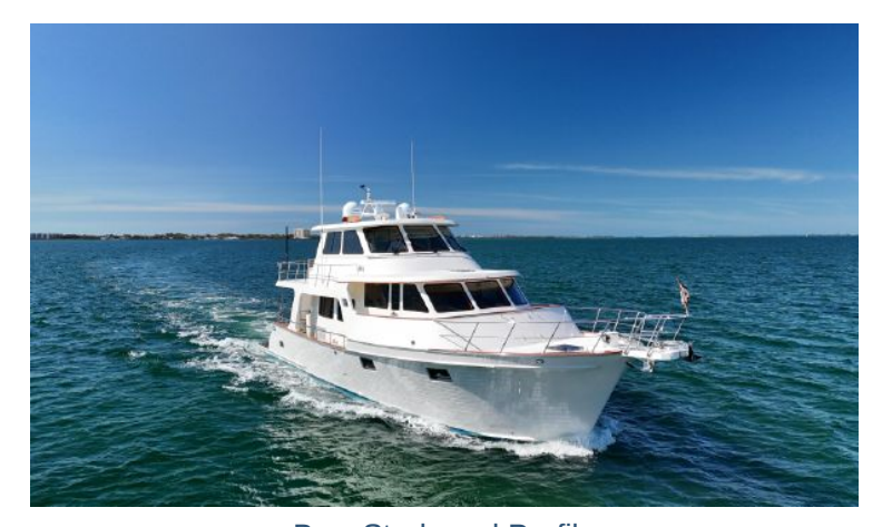
Bow Starboard Profile