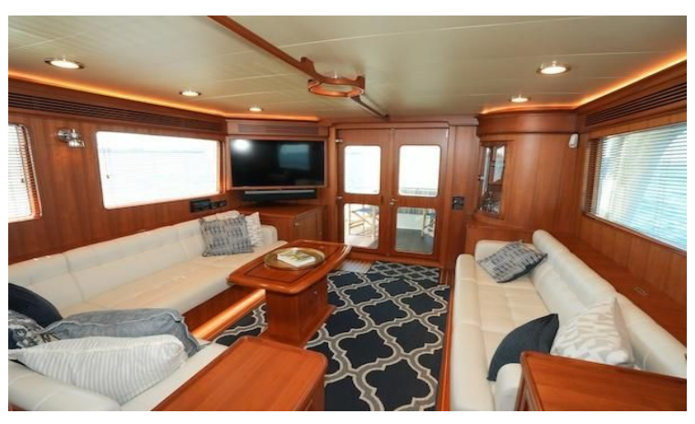
Salon facing Aft