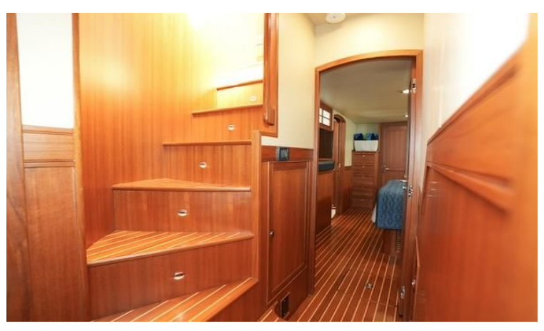
Companionway facing Aft and Stairs to Galley