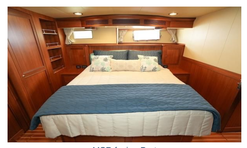
MSR facing Port