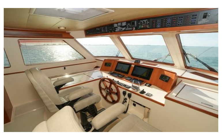
Command Bridge Port Foward