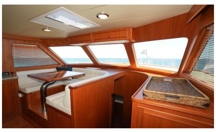
Galley Dining and Stairs to Companionway