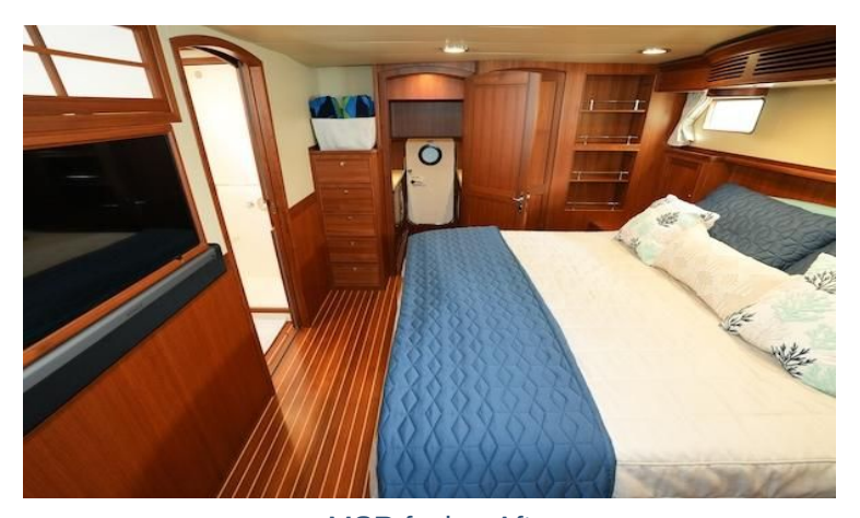
MSR facing Aft