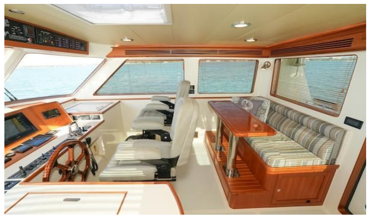
Command Bridge Starboard