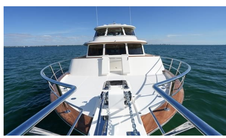
Bow facing Aft