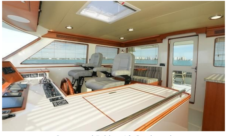
Command Bridge Aft Starboard