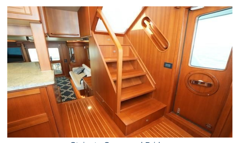
Stairs to Command Bridge