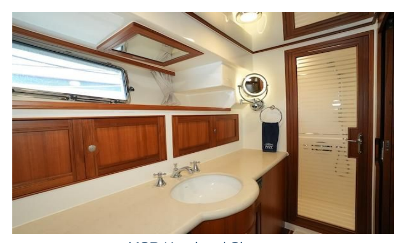
MSR Head and Shower