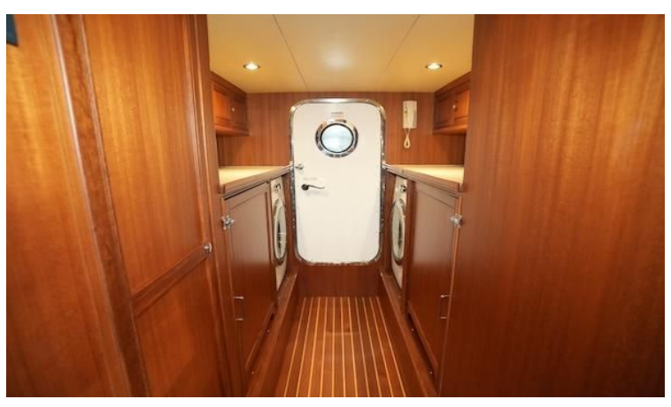
Laundry and Entry to Engine Room