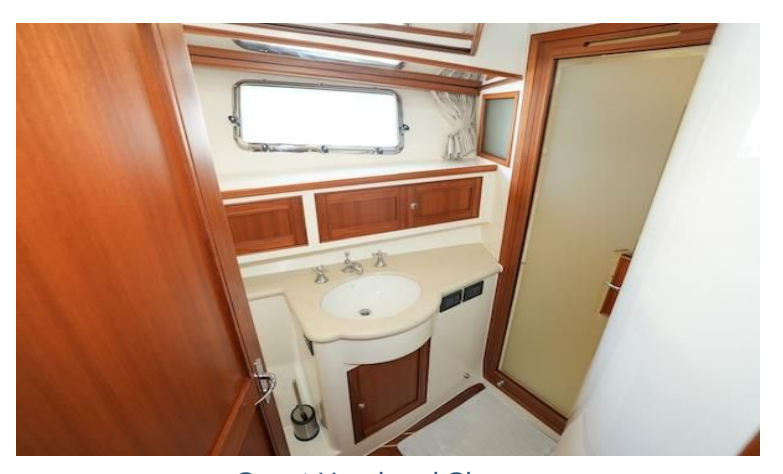
Guest Head and Shower