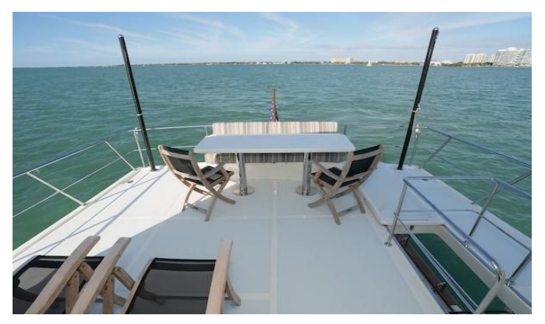
Upper Aft Deck facing Aft