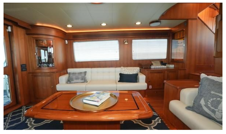
Salon facing Port