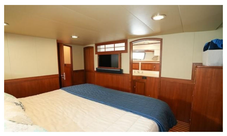
MSR facing Starboard