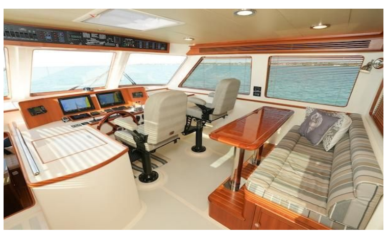
Command Bridge Starboard Forward