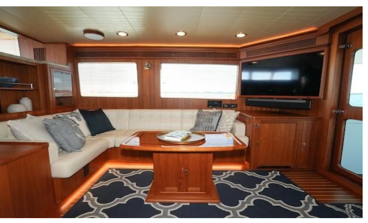
Salon facing Starboard