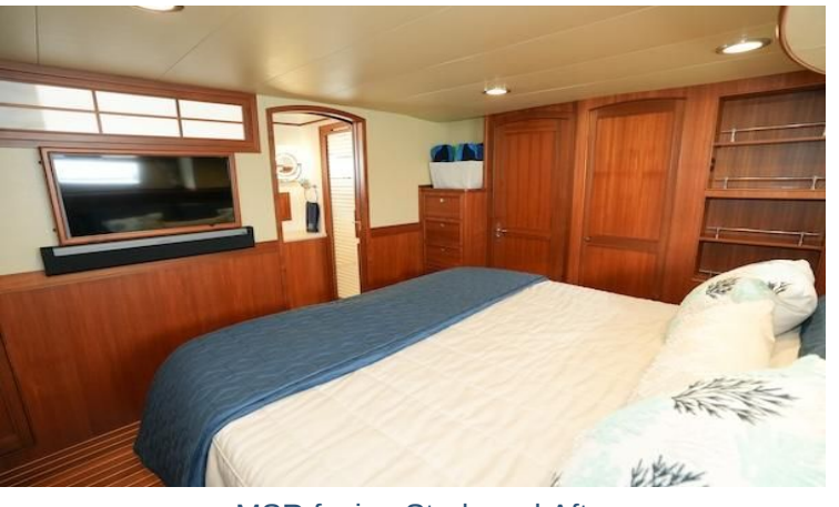
MSR facing Starboard Aft