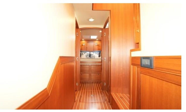
Companionway facing Forward