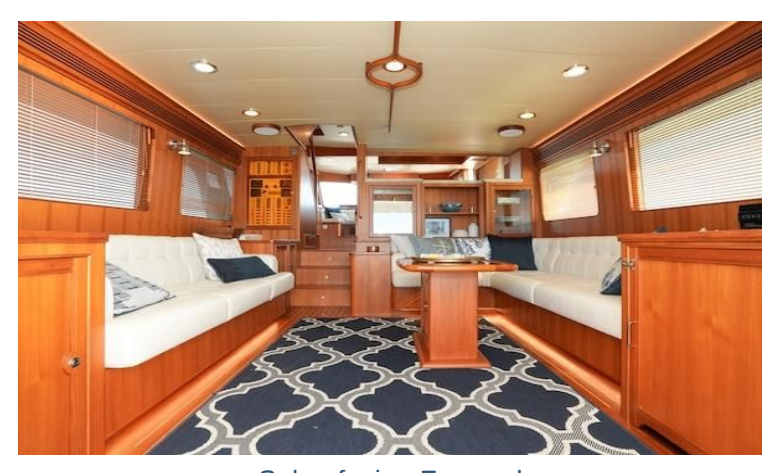
Salon facing Forward