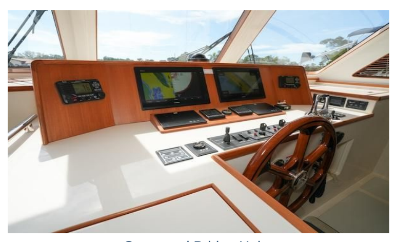
Command Bridge Helm