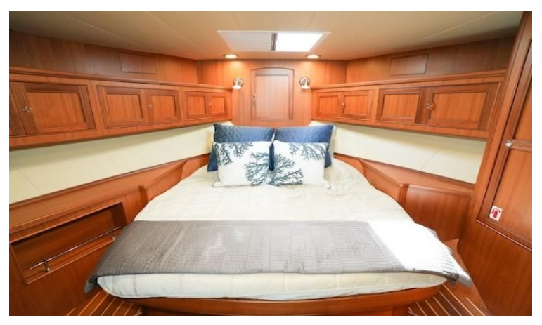
VIP facing Forward