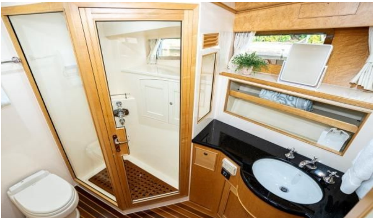
VIP Guest Head/Day Head