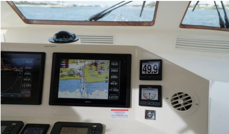
Upper Helm Electronics