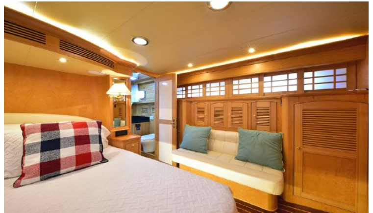
Master Stateroom Portside settee