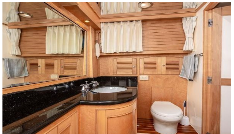
Master Head looking to Port