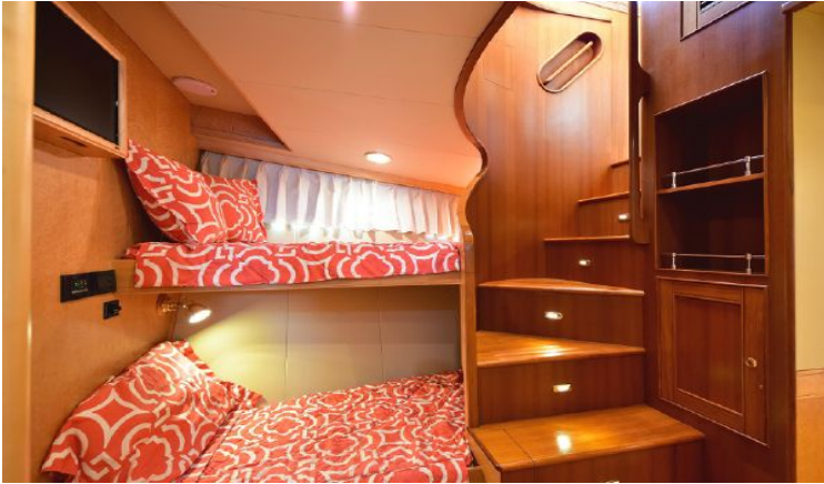
Steps to Companionway