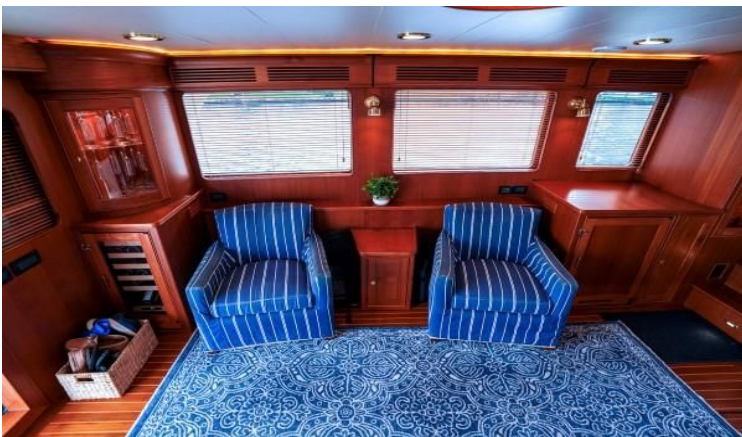
Salon looking to Port with Carpet