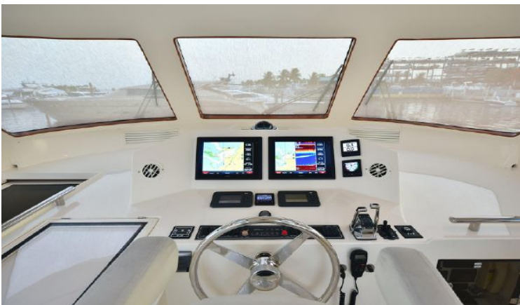
Upper Helm looking Forward