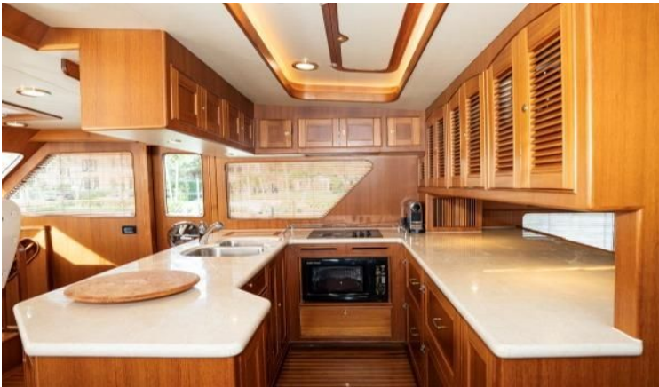
Galley looking Starboard