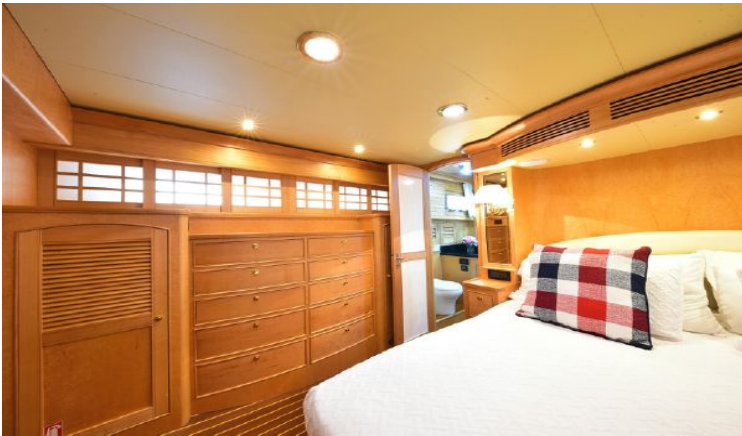
Master Stateroom looking to Starboard