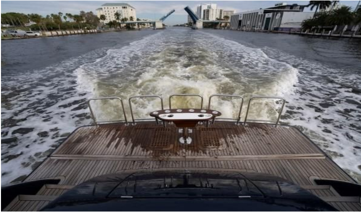
Hydraulic Swim Platform looking Aft