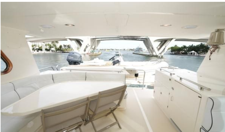
Bridge looking Aft