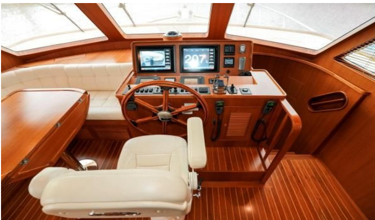
Pilothouse Helm looking Forward