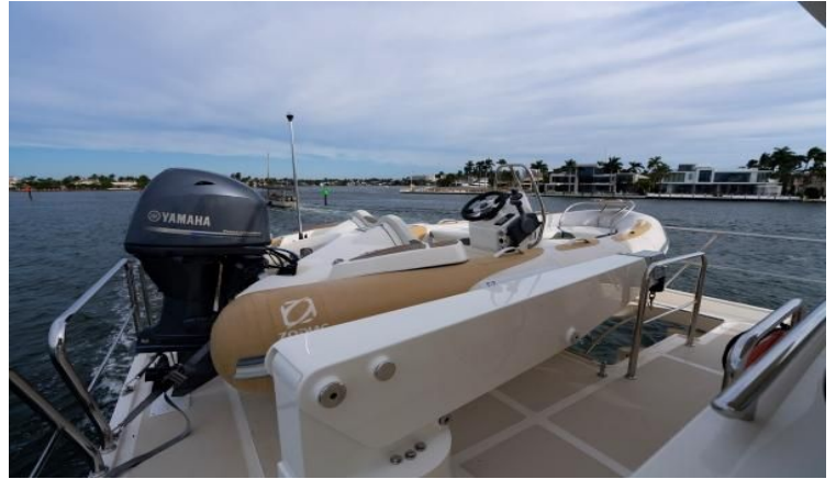
Tender and Davit looking to Aft Port