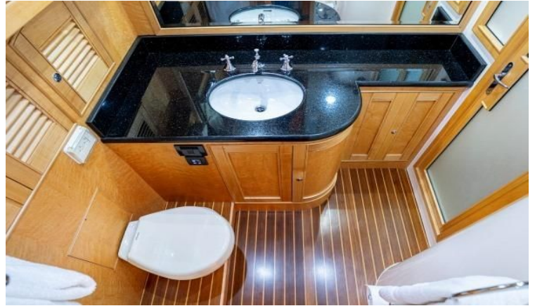
Master Head Starboard looking Aft