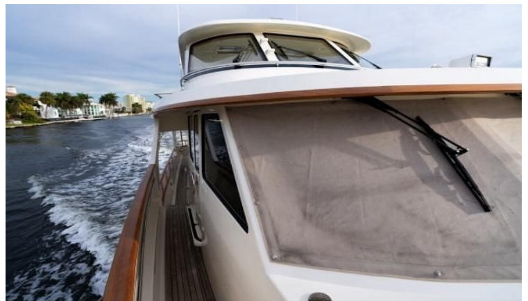
Starboard Promenade looking Aft