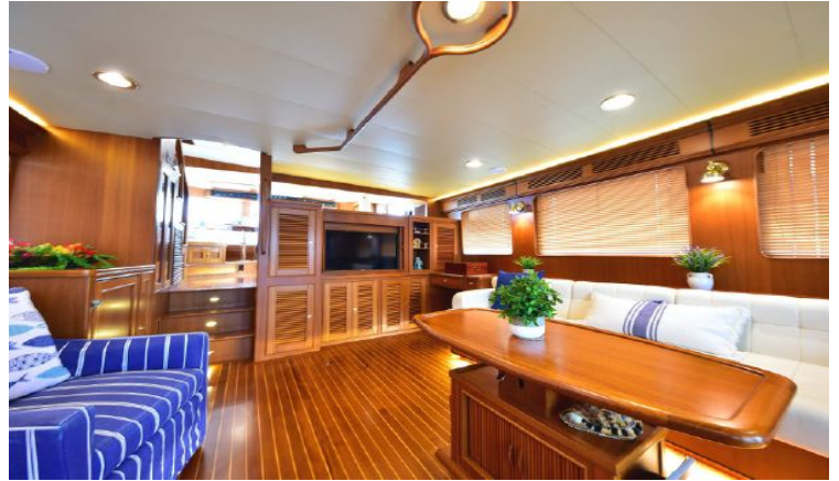
Salon looking to Forward Starboard