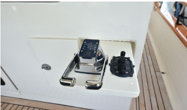
Cockpit Docking Station