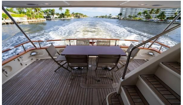
Cockpit looking Aft