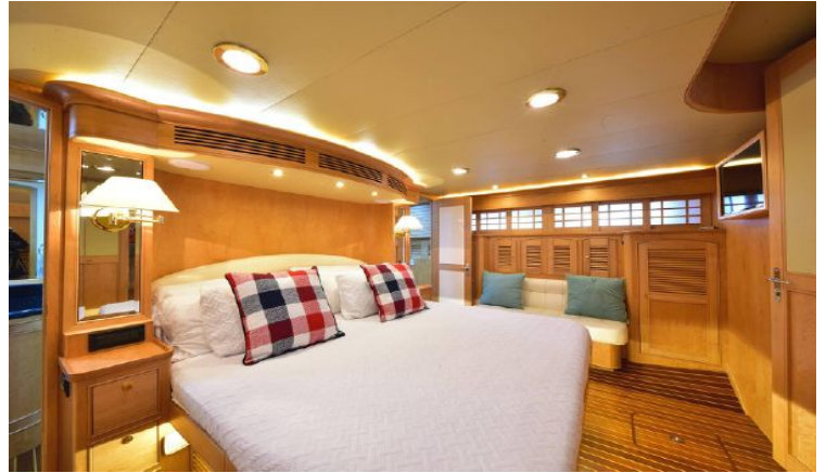
Master Stateroom looking to Port