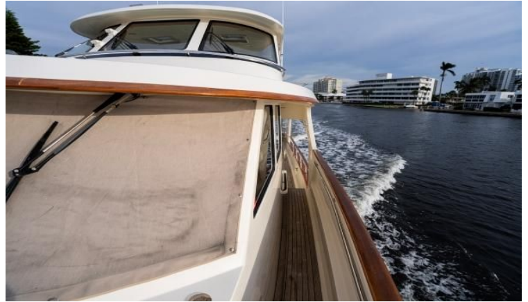
Port side Promenade looking Aft