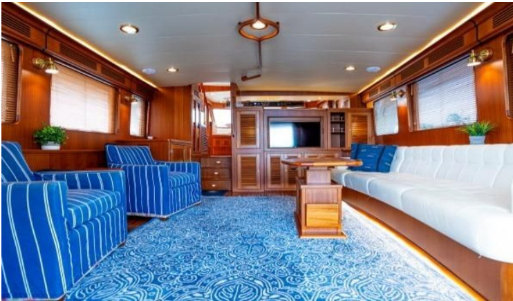
Salon looking Forward with Carpet