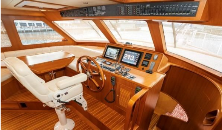
Pilothouse looking to Port