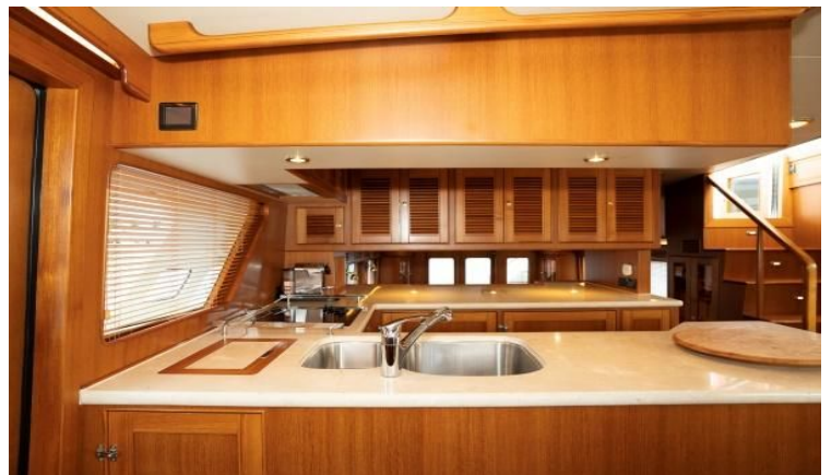
Galley looking Aft