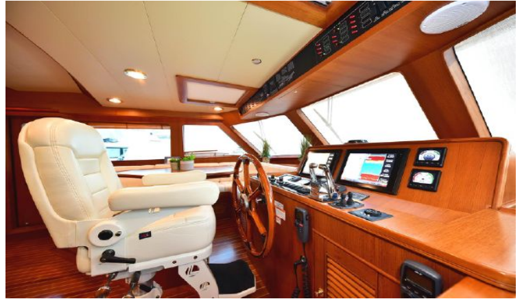
Pilothouse Helm looking to Port