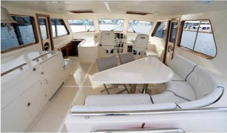
Bridge looking Forward