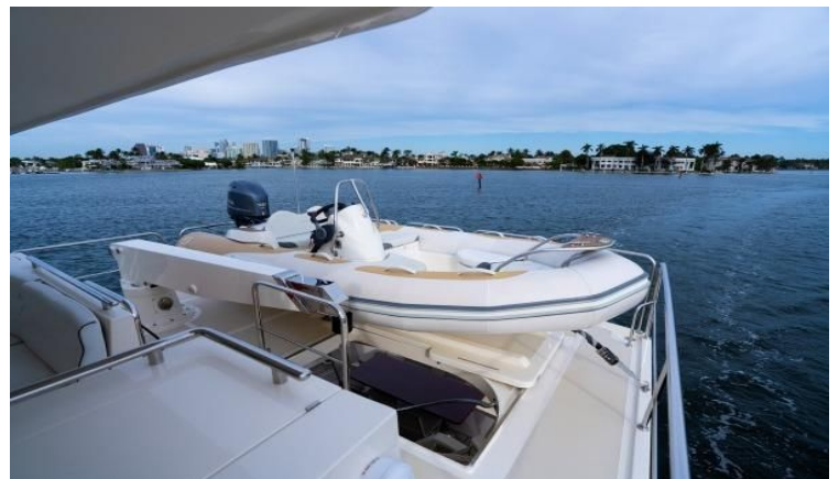
Tender looking to Starboard Aft