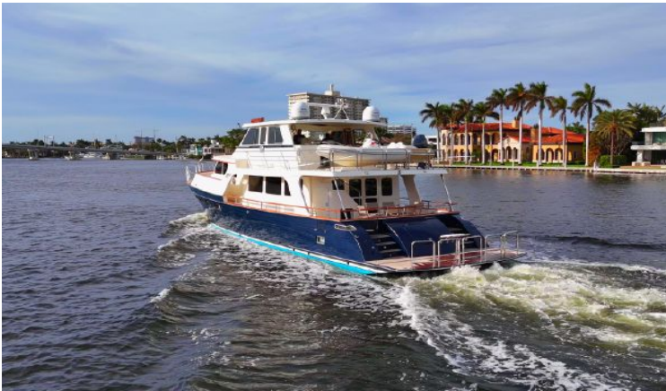
Port Aft Profile