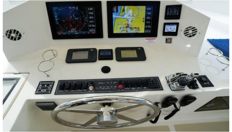
Upper Helm Electronics