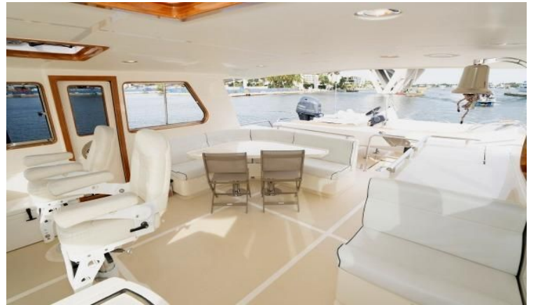
Bridge looking to Starboard Aft