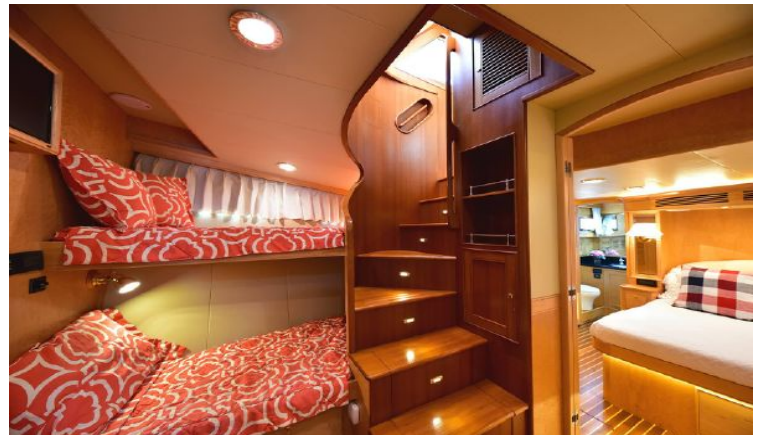
Starboard Guest stateroom