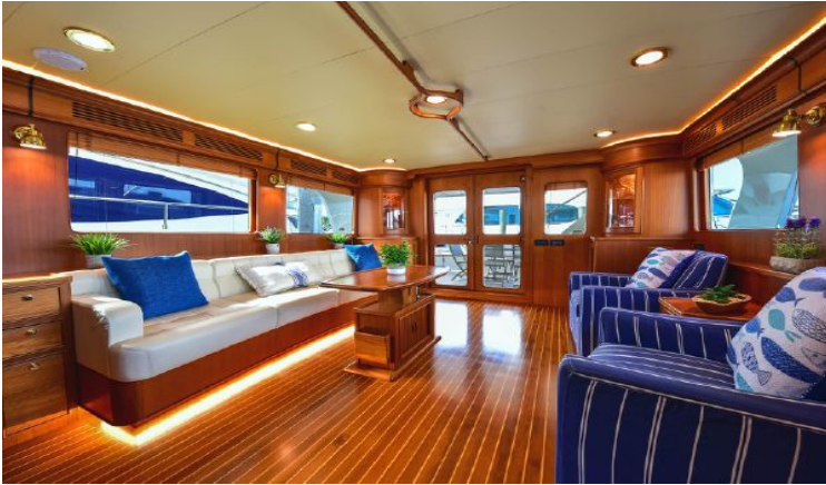
Salon looking to Starboard Aft