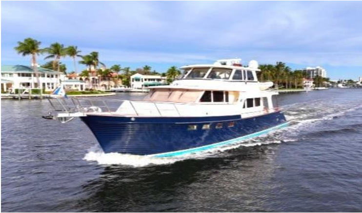
Port Bow Profile