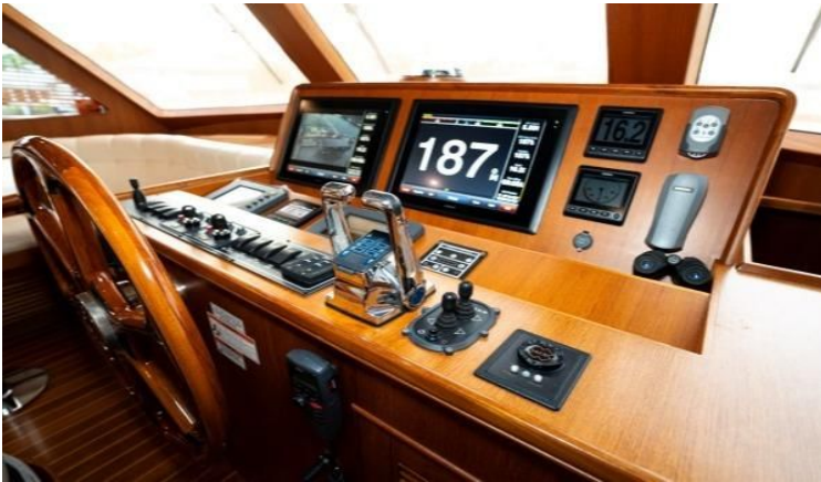
Pilothouse Helm Electronics