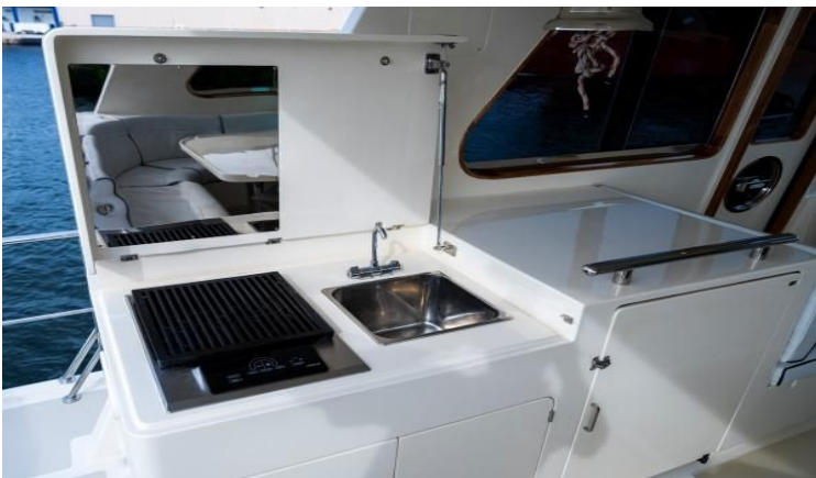
Upper Aft Deck Grill