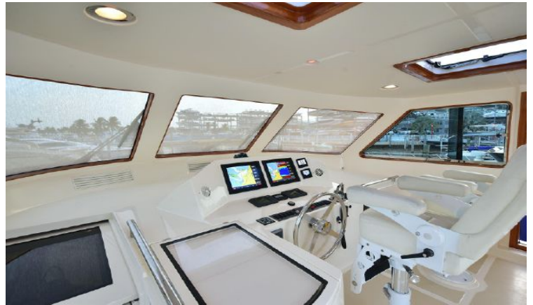
Upper Helm looking to Starboard