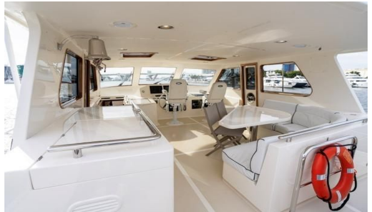
Bridge looking to Foward Starboard