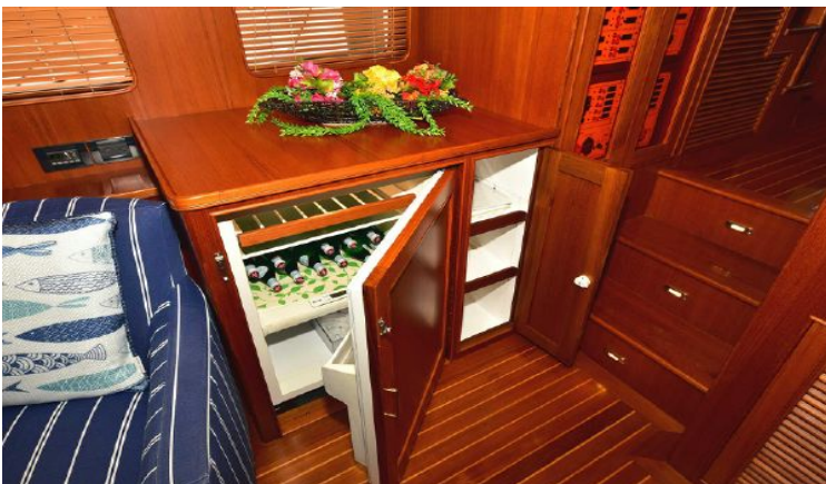
Salon Refrigerator to Port