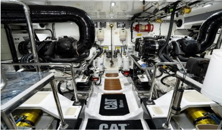
Engine Room looking Forward