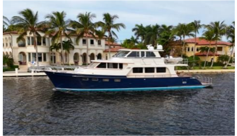
Port Side Profile