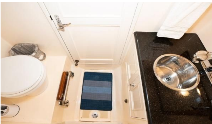
Crew Head and Shower