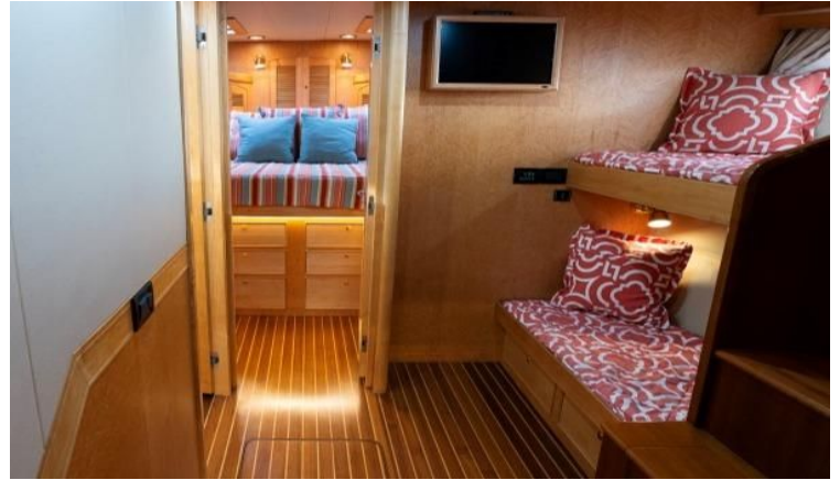
Companionway looking Forward