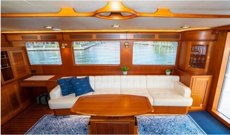
Salon looking to Starboard