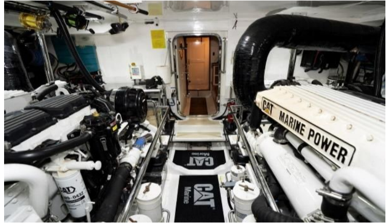
Engine Room looking Aft