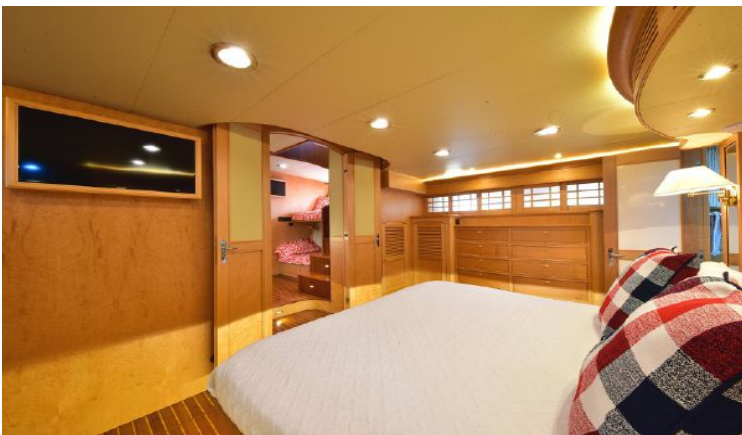
Master Stateroom looking Forward Starboard