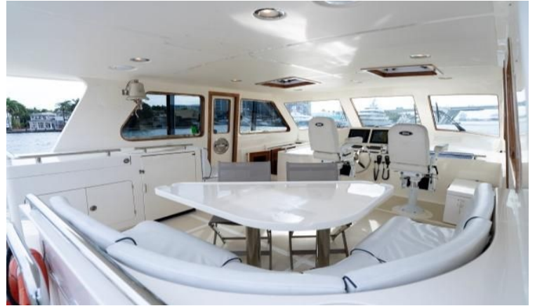
Bridge looking to Forward Port