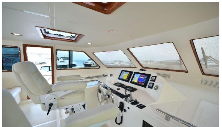
Upper Helm looking to Port