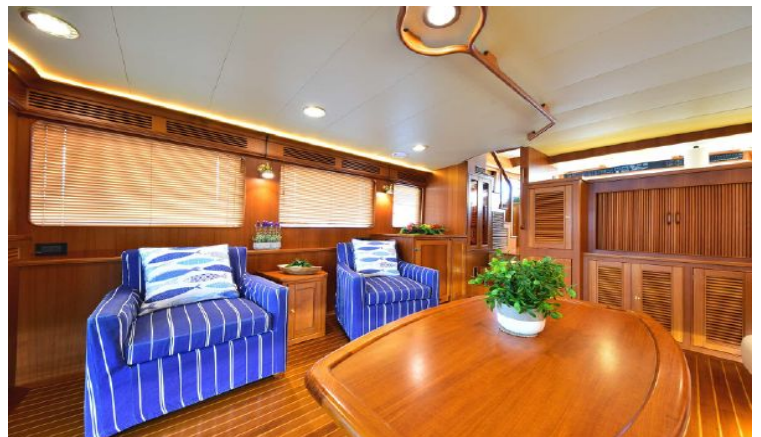
Salon looking to Port