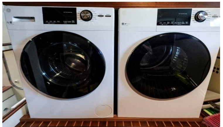
Full Size Washer and Dryer