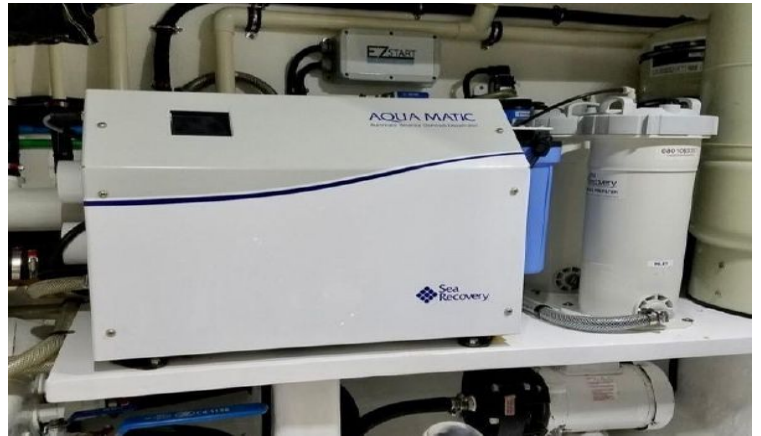
Sea Recovery Watermaker