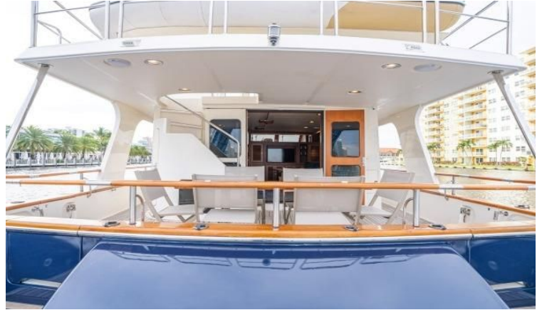
Cockpit looking Forward