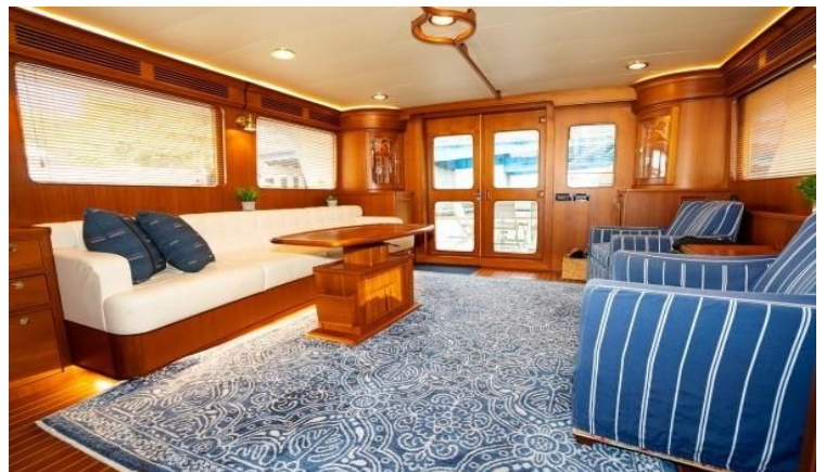
Salon looking to Starboard Aft with Carpet