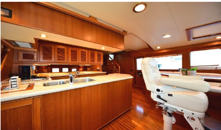
Pilothouse looking Aft