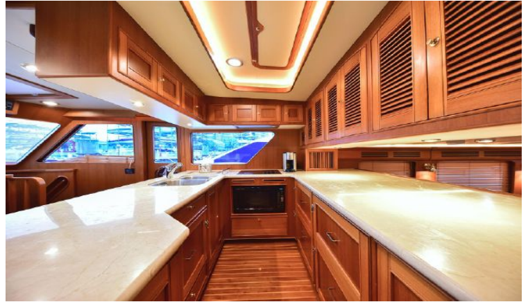
Galley looking Starboard