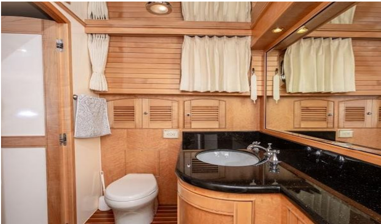
Master Head looking to Starboard