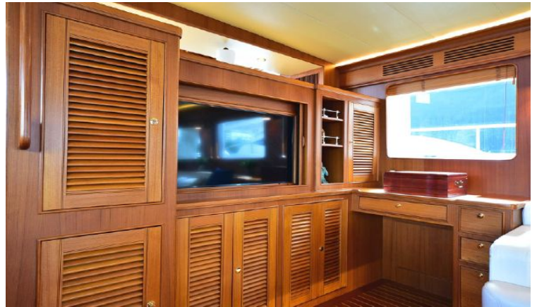
Salon TV and Desk