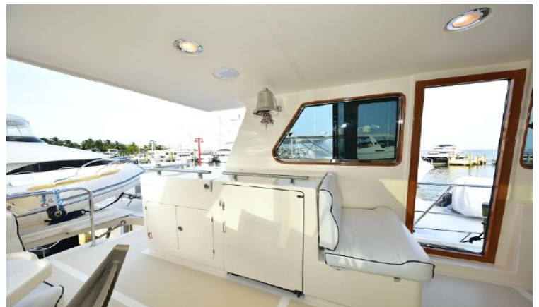
Bridge looking to Port