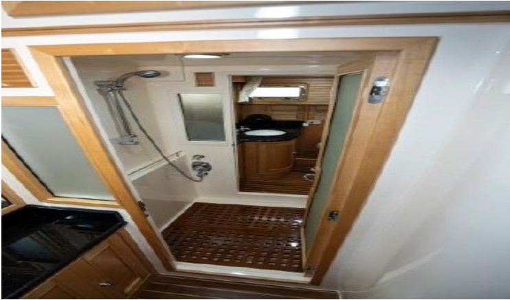
Master Stateroom Shower looking to Port