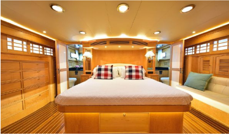
Master Stateroom looking Aft