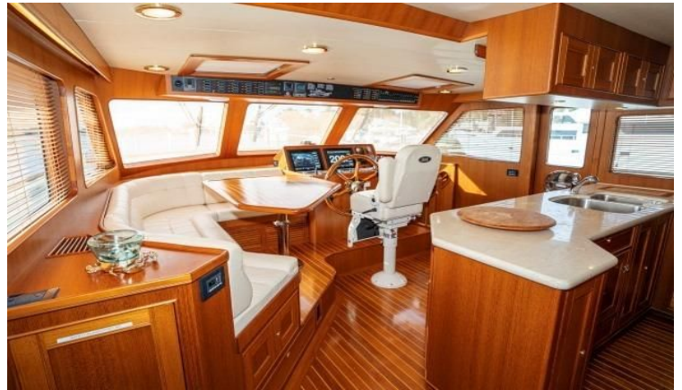
Pilothouse looking Forward