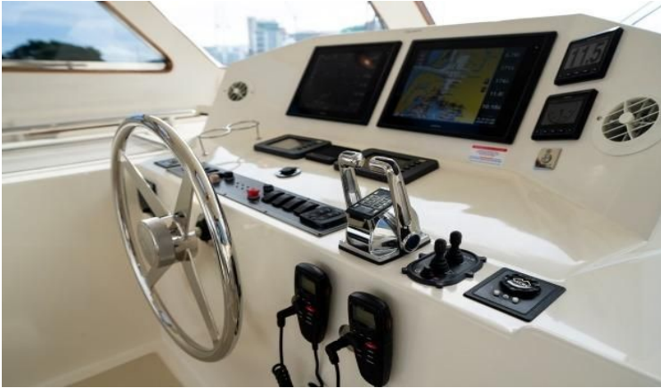
Upper Helm Electronics