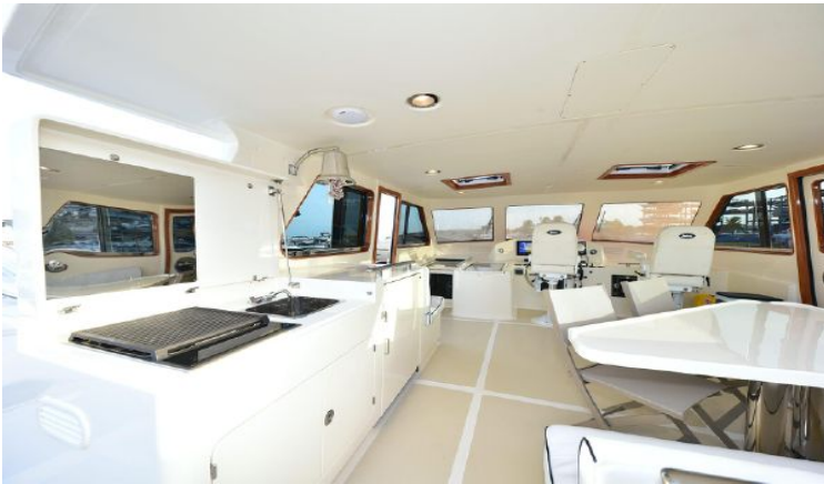
Bridge looking to Forward Port