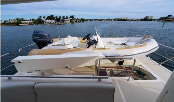
Tender looking Aft