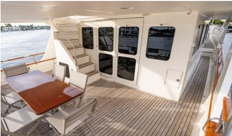
Cockpit looking to Port