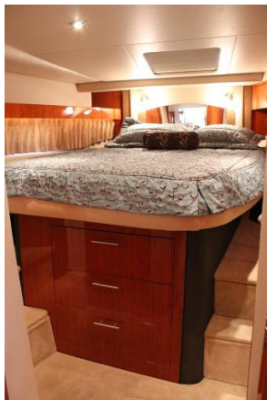
Master Stateroom Forward