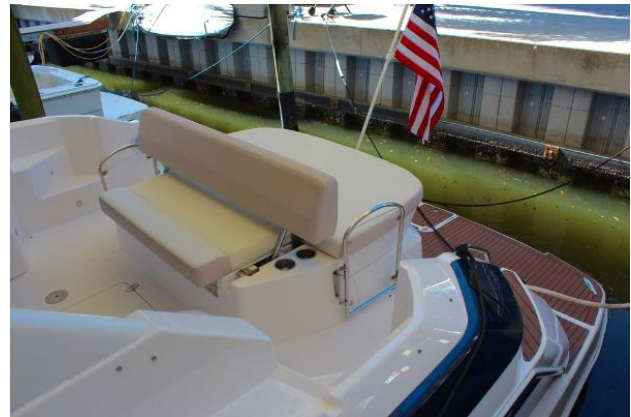
Cockpit Seating & Sunpad