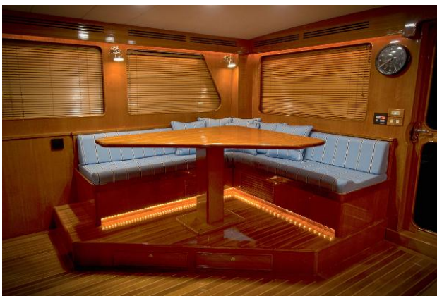
Command Bridge Dining